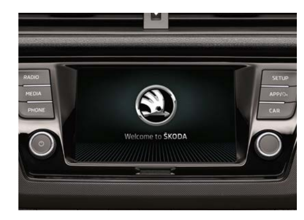
SWING RADIO WITH 6.5" TOUCHSCREEN DISPLAY