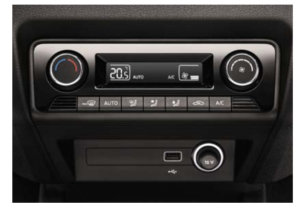
CLIMATE CONTROL AIR CONDITIONING

> SATIN BLACK CLOTH AND MICROSUEDIA UPHOLSTERY