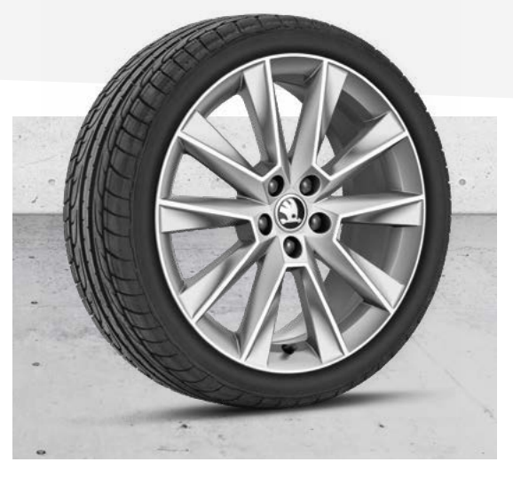
17" SAVIO ALLOY WHEELS