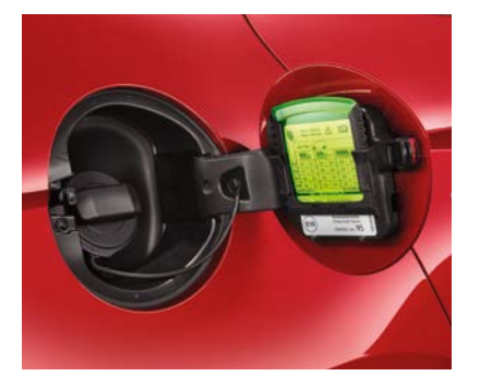
ICE SCRAPER Mounted out of sight on the fuel cap, this handy ice scraper is ideal for frosty mornings.

A spot of rain will never dampen your spirits again thanks to the umbrella located under the passengers seat.