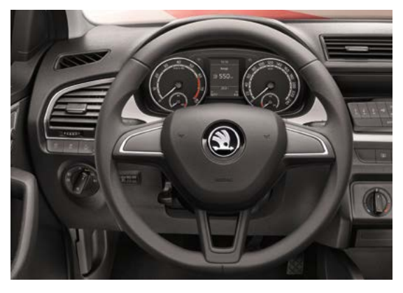
HEIGHT AND REACH ADJUSTABLE THREE-SPOKE STEERING WHEEL

ELECTRICALLY ADJUSTABLE AND HEATED DOOR MIRRORS