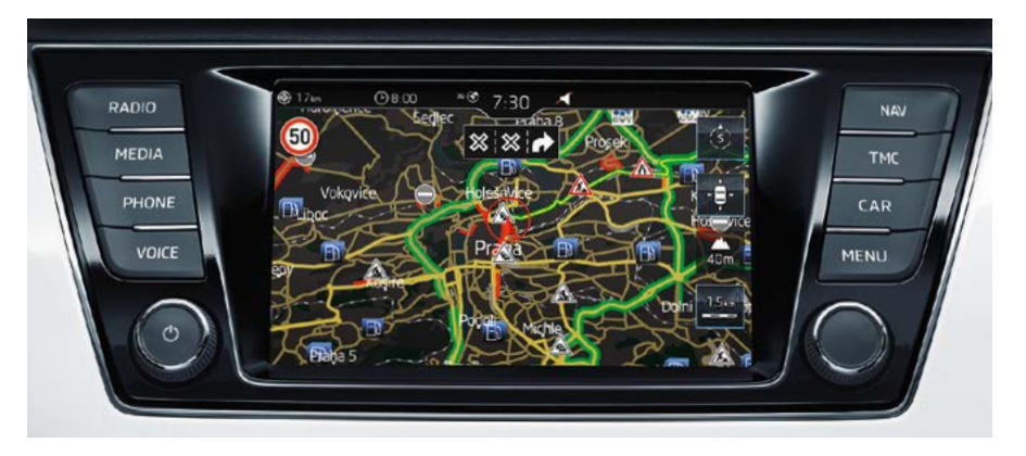
AMUNDSEN SATELLITE NAVIGATION WITH 6.5" TOUCHSCREEN DISPLAY