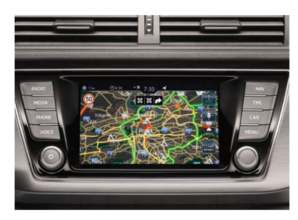
AMUNDSEN SATELLITE NAVIGATION