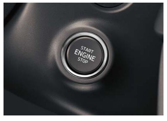
KEYLESS ENTRY AND START/STOP