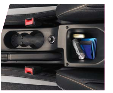
JUMBO BOX The Jumbo Box is extremely handy for

You'd expect the SCALA to provide plenty of user-friendly space, simple controls and a quality feel. But we've taken the interior to a whole new level. Now there's more space for everyone and their belongings, with an impressively vast luggage compartment and a cabin that really lets everyone relax. When you glance at the sharp, compact exterior, you wouldn't believe how accommodating the SCALA can be.