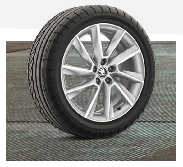
17" STRATOS ALLOY WHEELS