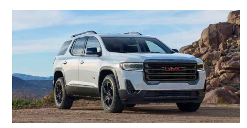
second-row seats, an advanced twin-clutch AWD system, Hill Descent Control, Hill Start Assist, all-terrain tires, premium heavyduty floor mats, a Cargo Management System (two-row models) and an Off-Road mode within the Traction Select System.