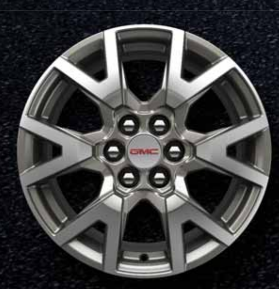
18" Machined Aluminum (RD9) — Standard on SLT