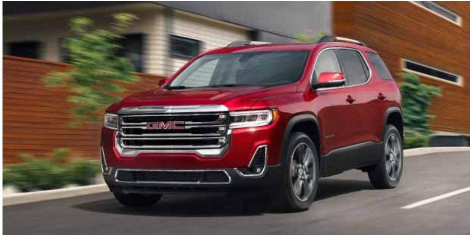
leather-appointed first- and second-row seats, LED fog lamps, a hands-free programmable power liftgate with GMC logo projection, an 8-way power-adjustable driver seat, remote start and a Traction Select System.