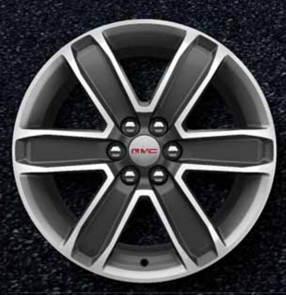
20" Ultra-Bright Machined Aluminum (SHV)<sup>1</sup> — Available on SLT