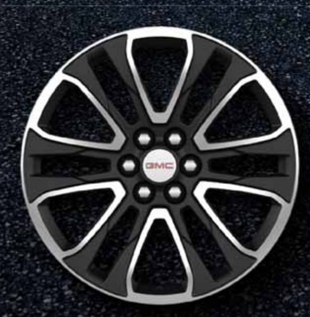
20" Machined Aluminum With Dark Accents (SSZ) — Available on AT4