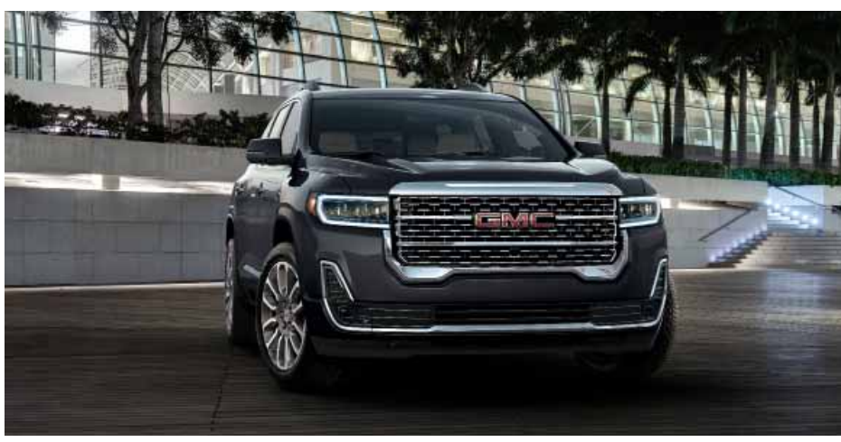
AT4 includes most SLT standard content and adds a 3.6L V6 engine, cloth or available perforated leather-appointed first- and DENALI includes most SLT standard content and is embellished with premium features such as a 3.6L V6 engine, unique 20" wheels, an automatic heated steering wheel, ventilated front seats, heated second-row outboard seats, Navigation, Forward Collision Alert? Automatic Emergency Braking<sup>2</sup> and power-folding mirrors.