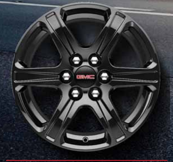
17" Gloss-Black Aluminum (Q7D) — Standard on AT4