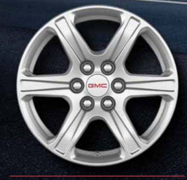
17" Painted Aluminum (RSC) — Standard on SL