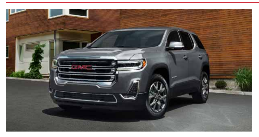
SL/SLE models come with a 2.5L engine on FWD models and a 2.0L Turbo engine (late availability) on SLE AWD models, a 9-speed SLT includes most SLE standard content and adds features such as a 2.0L Turbo engine (late availability), perforated automatic transmission, LED headlamps and taillamps, cloth seating, the next-generation 8" diagonal infotainment system, Smart Slide flat-folding second-row seats, Lane Change Alert with Side Blind Zone Alert? Rear Cross Traffic Alert² and Rear Park Assist? (SLE shown.)