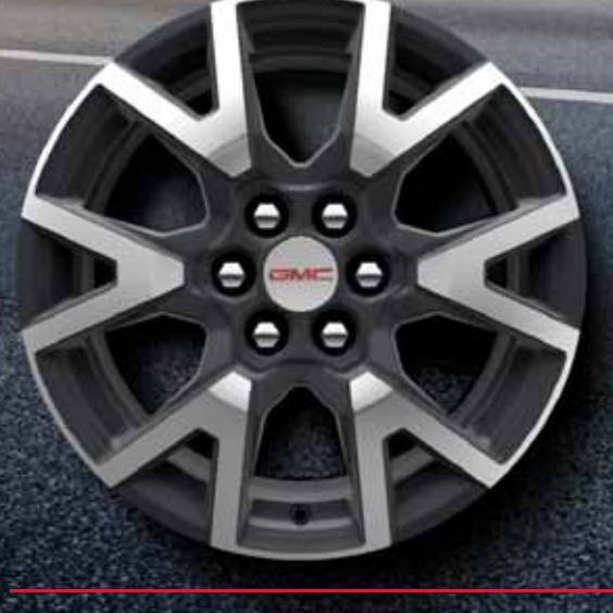
18" Machined Aluminum With Dark Accents (5PB) — Standard on SLE