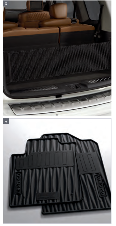
3 CARGO NET WITH CARPETED CARGO AREA PROTECTOR<sup>3</sup> 4 ALL-SEASON FLOOR MATS

▶ INTERIOR Take life with you. Whether you're downtown or out of town, the next great find could appear at any time. A Cargo Net keeps your latest valuables secure while a Carpeted Cargo Area Protector guards against wear and tear – of the vehicle and your items.<sup>3</sup> Out in the elements? Embrace your adventurous nature with All-Season Floor Mats that collect dirt and sand, preserving your interior footwells.