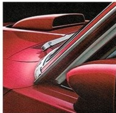
Functional engine-mounted shaker hood scoop.

If you do, full rally instrumentation is available, including an electric tach. To