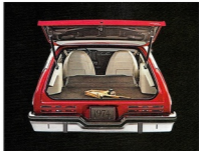
The GTO Hatchback.