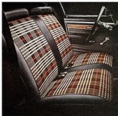
Standard bench seat upholstered in cloth and Morrokide. Shown in black/white/red plaid—also available in black/white/green plaid.

GTO's performance comes from Pontiac's new cold-air induction 350 4-bbl. V-8, teamed with a tough, floor-shifted 3-speed and a 3.08:1 rear axle that relays the