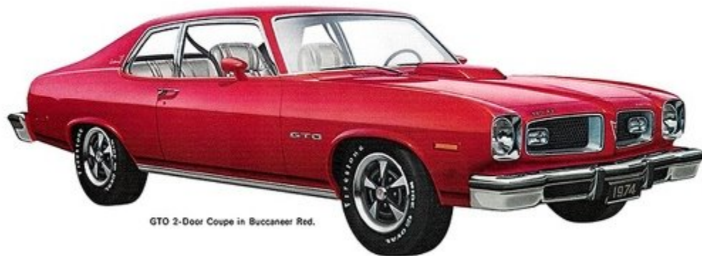
GTO 2-Door Coupe in Buccaneer Red.

After all, the Wide-Track people have a way with cars.