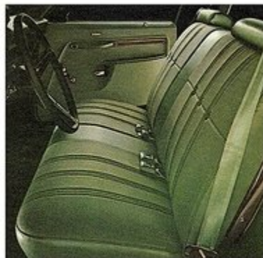
Custom bench seat upholstered in cloth and Morrokide. Shown in green—also available in black.

Power front disc brakes are available for