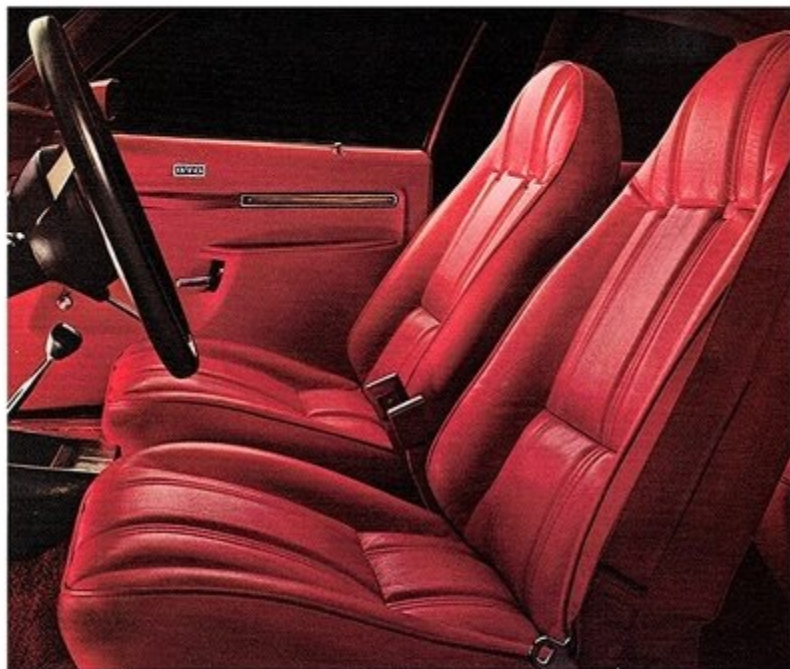
Available all-Morrokide bucket seats. Shown in red—also available in white, saddle and green.