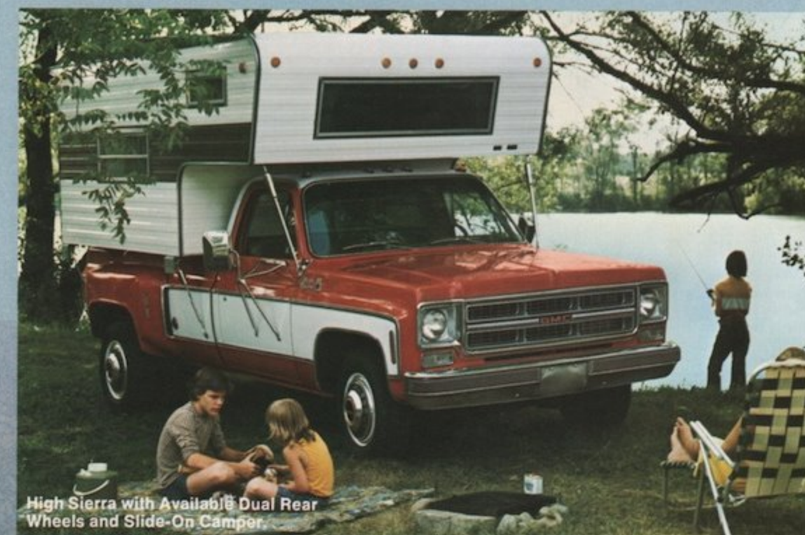
High Sierra with Available Dual Rear Wheels and Slide-On Camper.

Power Steering, 61 Amp. Generator, 4000 Watt HD Battery, Locking Differential Rear Axle, Heavy Duty Radiator in combination with 4-speed manual transmission, Sliding Rear Window, Comfortilt Steering Wheel, Engine Oil Cooler and Dealer Installed Accessories including Automatic Transmission Auxiliary Oil Cooler.