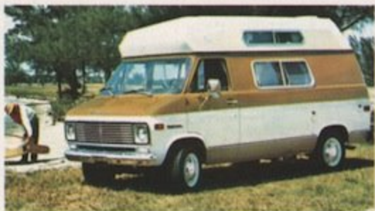
VANDURA/RALLY page 7

It's GMC's Rally Camper Special, the proven light duty Cab & Chassis, that teams up with MotorHome manufacturers to provide popular floor plans with features that you'd expect to find only in larger units. GMC Rally Camper Special MotorHome units are not available at all GMC dealers.