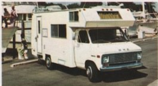
MINI-MOTORHOME page 6

Full-Time four-wheel drive with available automatic transmission will take you out and back again from practically anywhere you want to be. Light camper and utility trailering specifications are included. For more information, see GMC's Four-Wheel Drive Brochure. And we offer part-time four-wheel drive and two-wheel drive Jimmys' too.