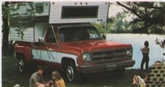
PICKUP TRUCKS page 4 & 5

Suburban . . . the truck station wagon for people, equipment and trailer towing. Check the trailer towing chart to find the Suburban equipment that suits your plans. For additional Suburban information, see GMC's People Movers Brochure. See the Four-wheel Drive Brochure for 4x4 Suburbans.