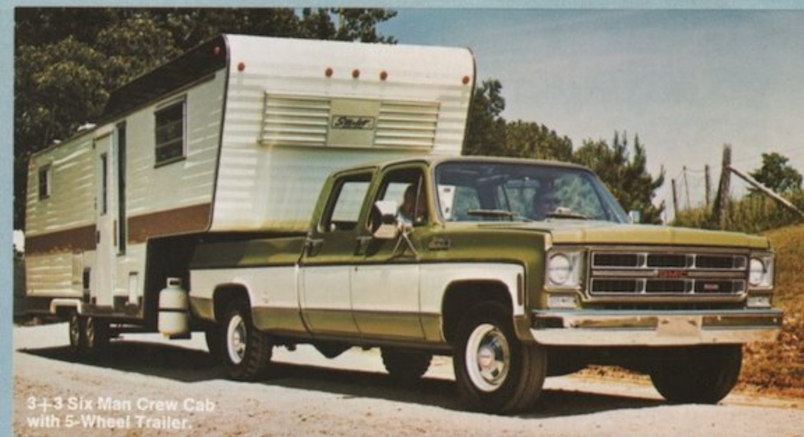
3+3 Six Man Crew Cab with 5-Wheel Trailer.

wiring harness, heavy duty front springs (depending on model); heavy duty front and rear shock absorbers, capacity rear springs (depending on model) and heavy duty front stabilizer bar. ① Deluxe Camper package includes front Elimji-Pitch stabilizers for camper body cabover section and cargo box mounted shock absorber for camper body fore-and-aft pitch control. The chart left, below can help you spec your Pickup for your camper size. For Pickup trailer towing information, see the back cover.