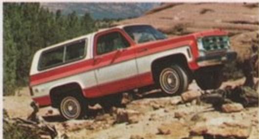
JIMMY page 6

Pickups can tow trailers, with or without a shell camper or carry slide-on campers. For a close match to your camping and travel ideas, check the charts, camper categories and trailer ratings. For more information, see GMC's Pickup Brochure and for 4x4 Pickups, see the Four-Wheel Drive Brochure.