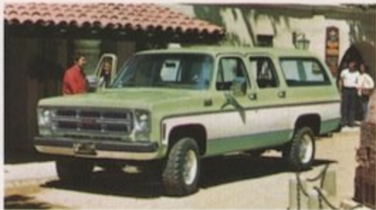
SUBURBAN page 3

GMC's line up of light duty trucks offers something for almost everyone's idea of recreational adventure and an additional plus in everyday transportation. Look over the models below for the GMC that adds up to a great fun investment. Talk to your GMC dealer, he can answer your questions about the RV vehicles of your choice.