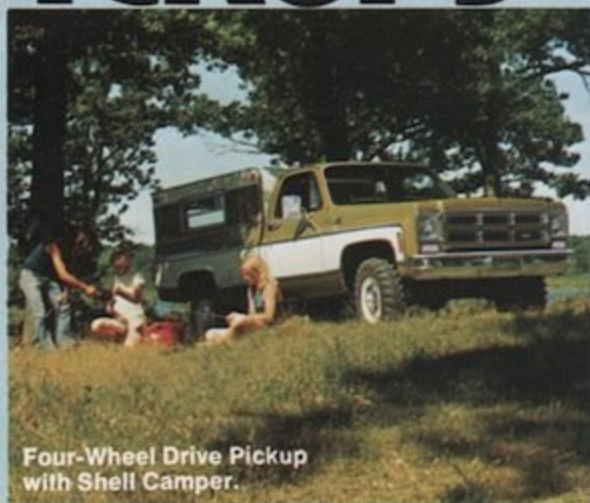
Four-Wheel Drive Pickup with Shell Camper.