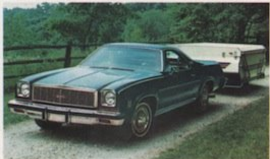
SPRINT page 8

Available in half, three-quarter and one-ton models, you can find ways available to adapt one to camp-in, tow a trailer or travel with your own private group in your truck. For additional information, see GMC's People Movers and Commercial Truck Brochures.