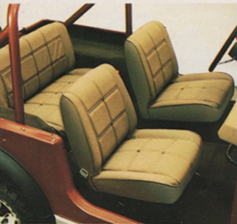
CJ-5 & CJ-7 LEVI'S® BUCKET SEATS OPTIONAL REAR SEAT