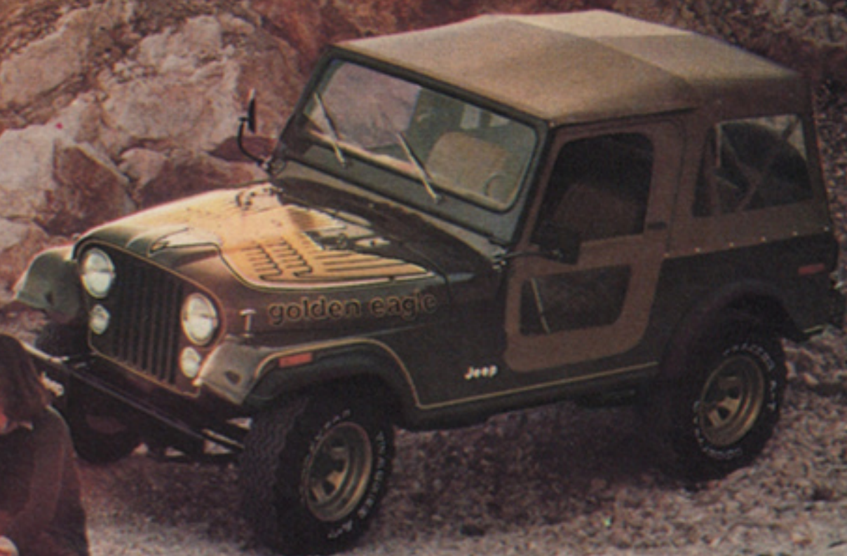
CJ-7 GOLDEN EAGLE