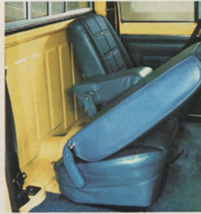
PICKUP LEVI'S® BUCKET SEAT FOLDING SEAT BACK

To receive a complete catalog, write to American Motors Corp., Special Events Dept., 27777 Franklin Rd., Southfield, MI 48034