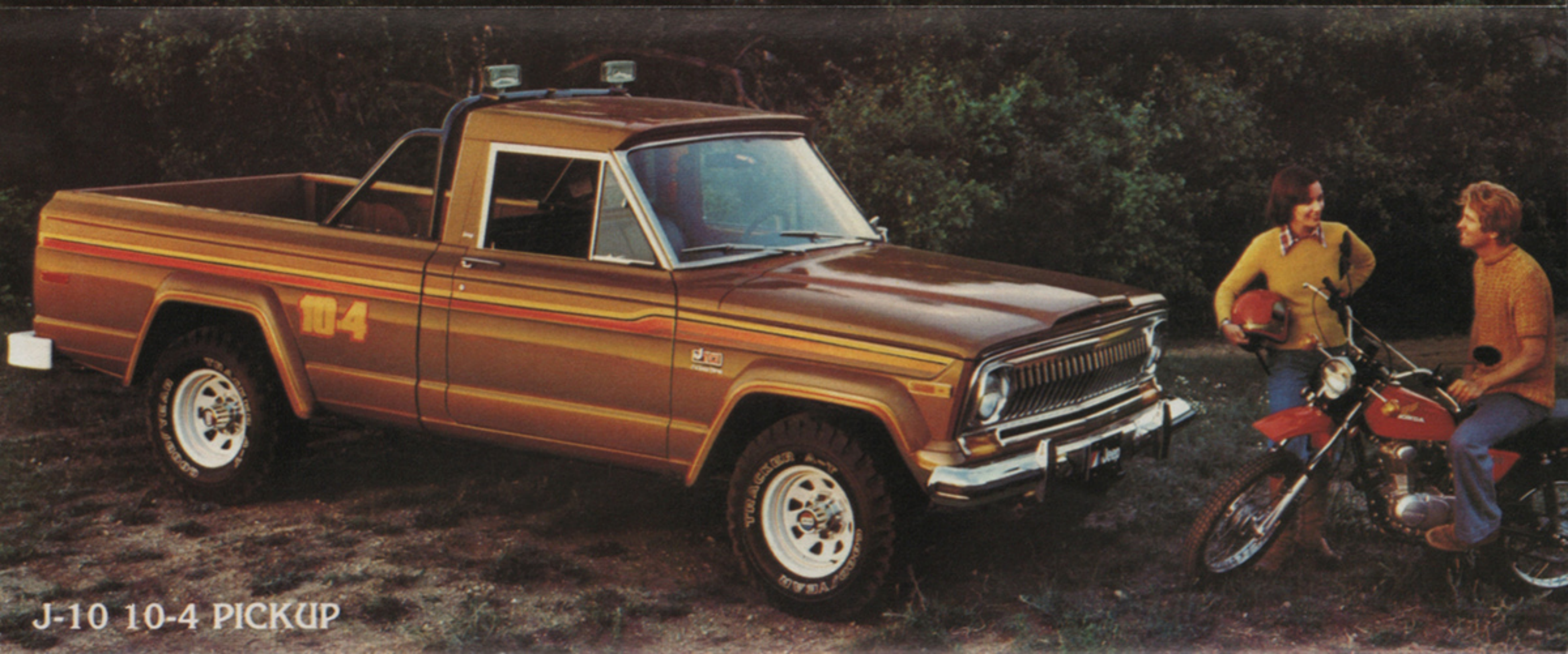
J-10 10-4 PICKUP