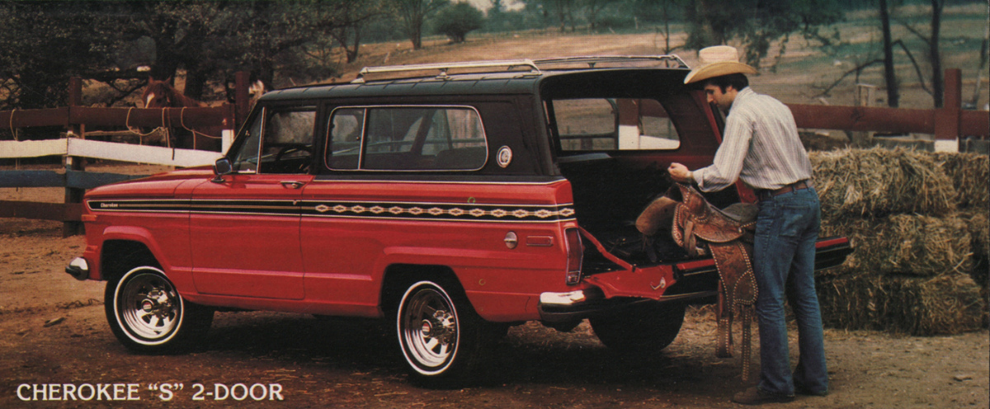
CHEROKEE "S" 2-DOOR