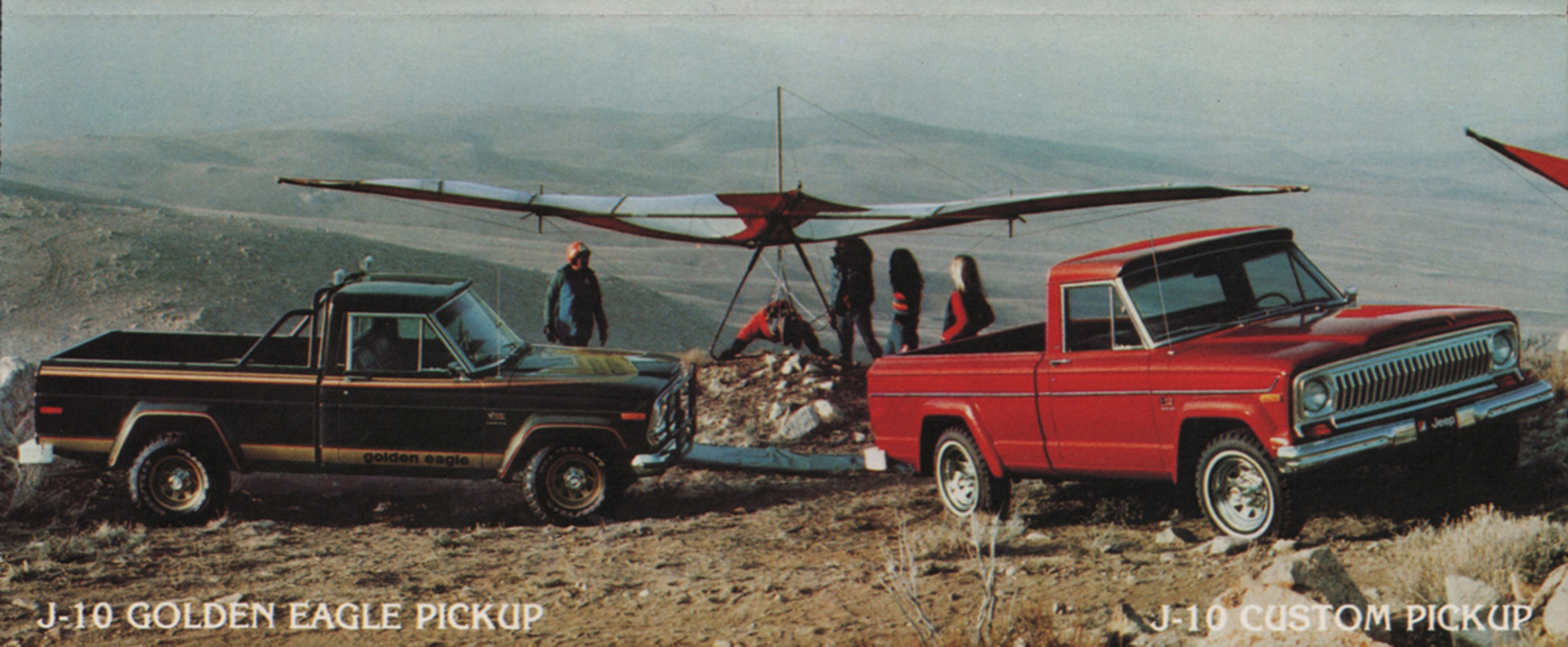
J-10 GOLDEN EAGLE PICKUP