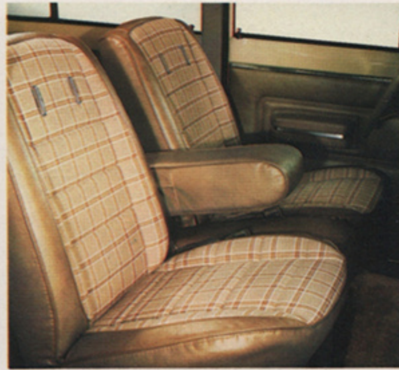
WAGONEER BUCKET SEAT CUSTOM CLOTH