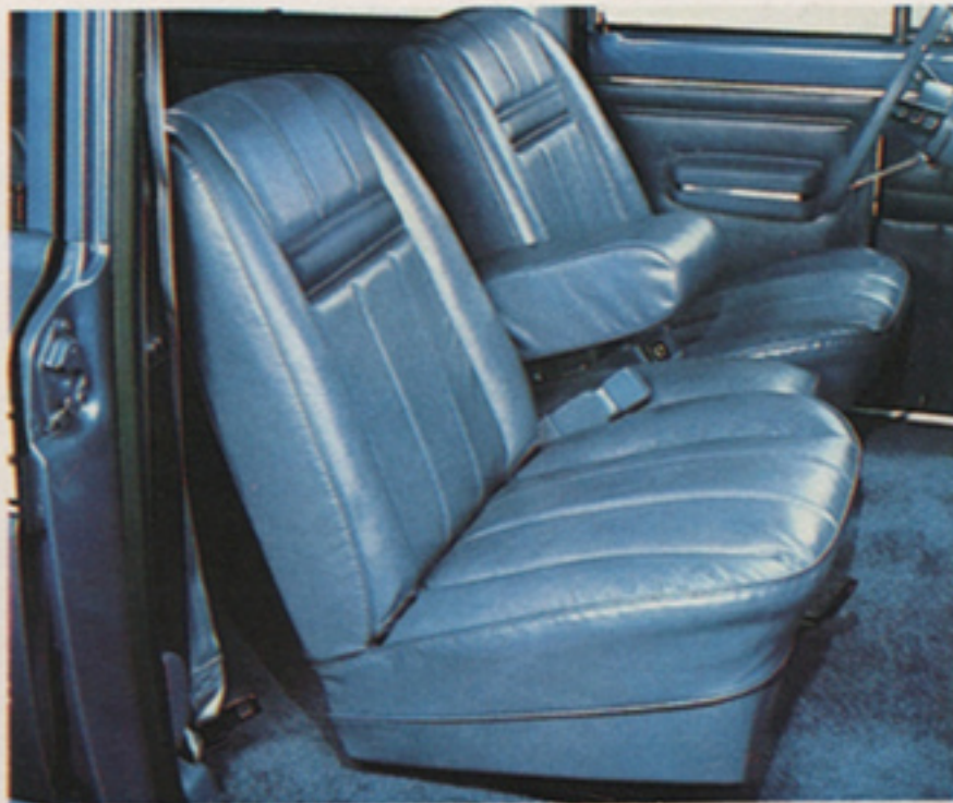
CHEROKEE BUCKET SEAT ("S") PACKAGE