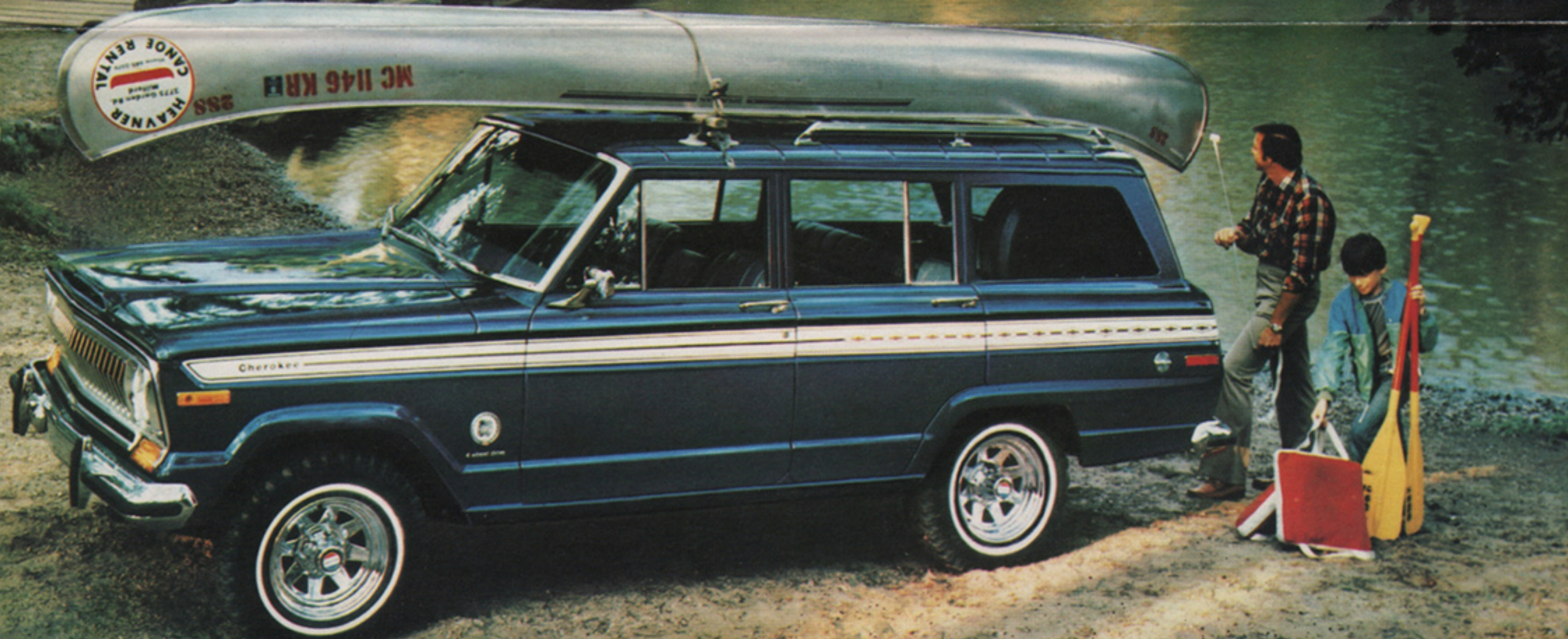
CHEROKEE "S" 4-DOOR