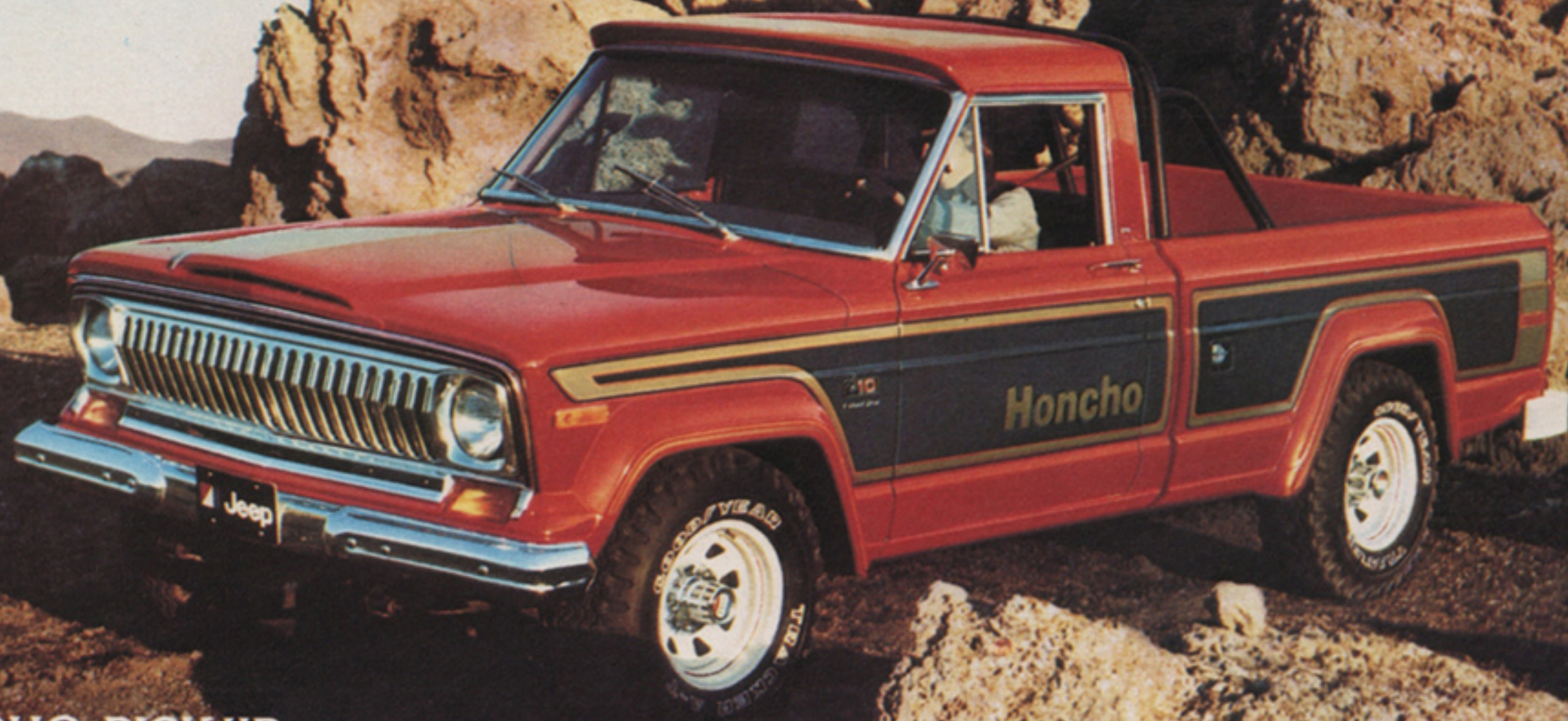
J-10 HONCHO PICKUP