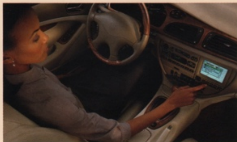
The Jaguar Integrated Navigation System uses voice responses to help lead you to your destination.

The S-TYPE interior provides such traditional Jaguar attributes as Connolly leather and bird's-eye maple trim. Yet its true luxury lies in its superb functionality. A standard 60/40 split-fold rear seat adds cargo-carrying versatility, while dual zone automatic climate control allows two individual comfort levels. The optional Jaguar Integrated