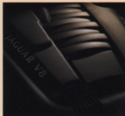
The AJ-V8 shares most of its design with the XK8 sports car engine.

technology as well. The V6 offers 2-stage variable cam phasing for smooth low-end torque, while the V8 provides even more advanced continuous variable cam phasing for optimal performance at all speeds. The S-TYPE's performance is further enhanced by its spirited ride and handling, a sensation that's delivered through a rigid body structure as well as independent double wishbone front and rear suspensions.