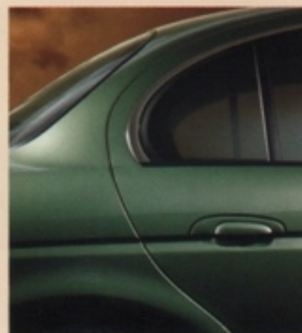
Even our world-class ten-step paint process has been upgraded.

Over the past five years, Jaguar automobiles have demonstrated tremendous advances in quality. The S-TYPE represents the important next step. Its home, Castle Bromwich, Birmingham, England, has been reengineered and retooled to house one of the world's most advanced automotive manufacturing facilities. A wealth of new production methods help deliver exacting quality, including laser gauging systems that check the tolerances