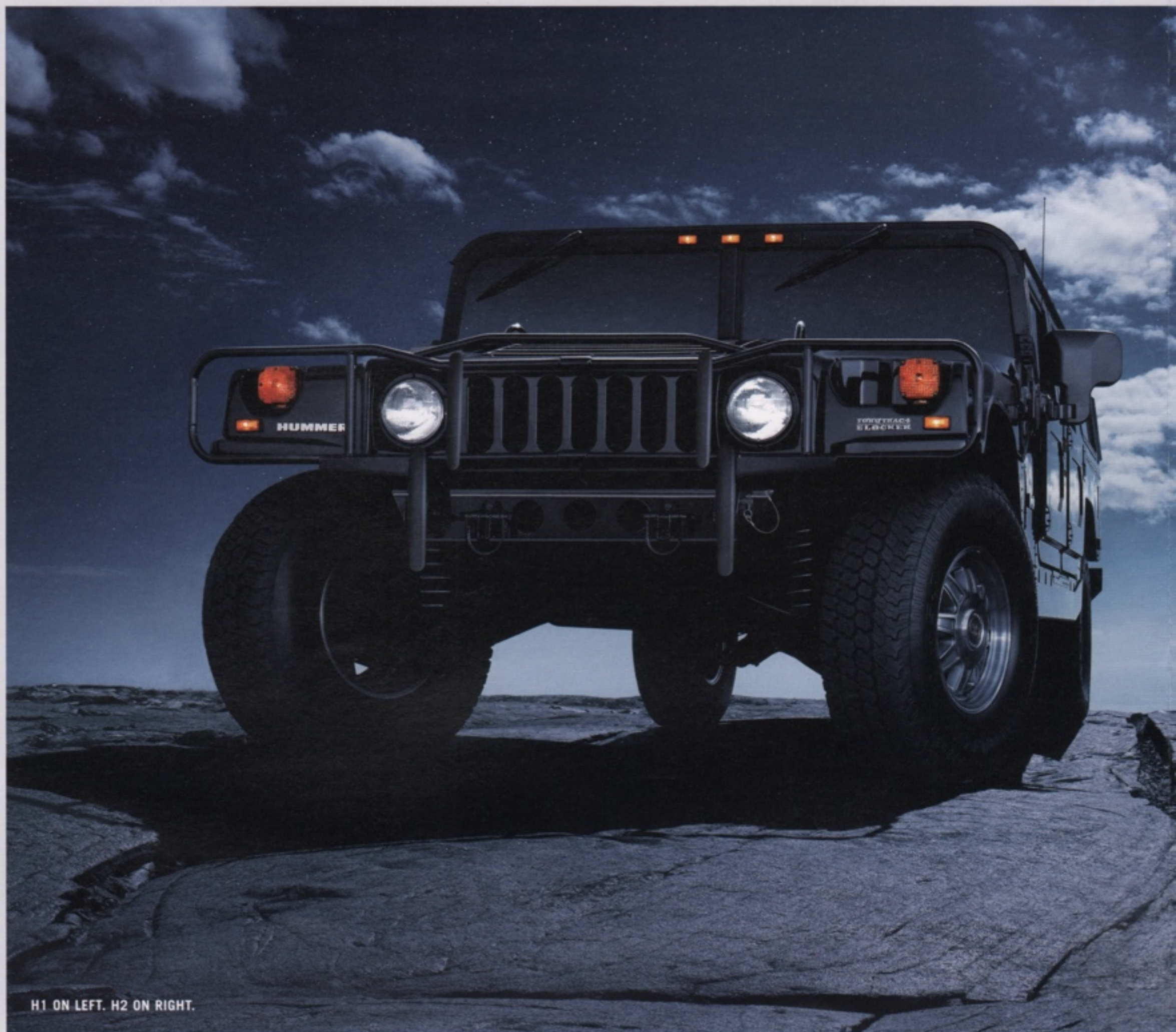
H1 ON LEFT. H2 ON RIGHT.