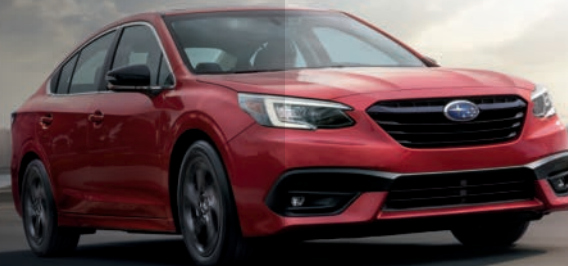
Legacy Sport in Crimson Red Pearl with optional equipment.