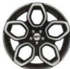
20" Cast-Aluminum with Aero Cover Standard: GT