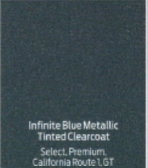
Infinite Blue Metallic Tinted Clearcoat Select, Premium, California Route 1, GT