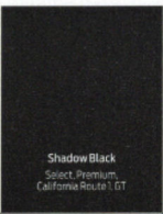
Shadow Black Select, Premium, California Route 1, GT