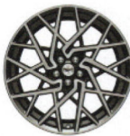
20" Premium Forged Machined-Face Dark Tarnish-Painted Available: GT