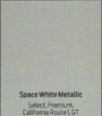
Space White Metallic Select, Premium, California Route 1, GT