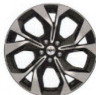
19" Machined-Face Aluminum with High Gloss Black-Painted Pockets Standard: Premium, First Edition