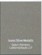
Iconic Silver Metallic Select, Premium, California Route 1, GT