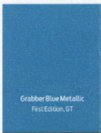
Grabber Blue Metallic First Edition, GT