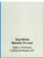
Star White Metallic Tri-coat Select, Premium, California Route 1, GT