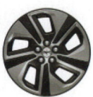
18" Magnetic-Painted Aluminum with Sparkle Silver and Black Aero Cover Standard: California Route 1