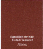
Rapid Red Metallic Tinted Clearcoat All trims