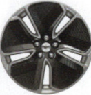
19" Shadow Silver-Painted Aluminum with High Gloss Black-Painted Aero Cover Available: Select