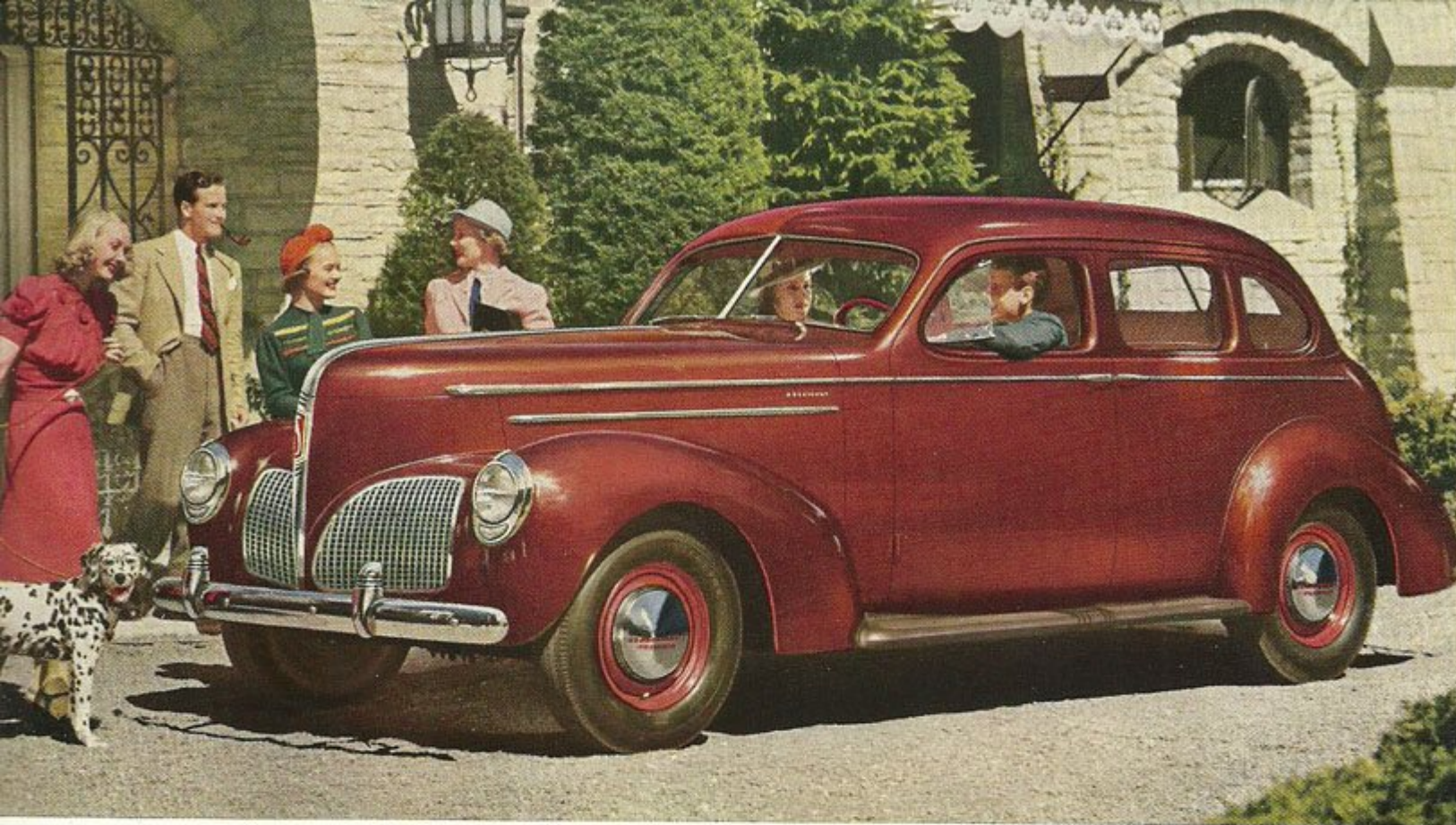
STUDEBAKER STATE PRESIDENT 4-DOOR CRUISING SEDAN