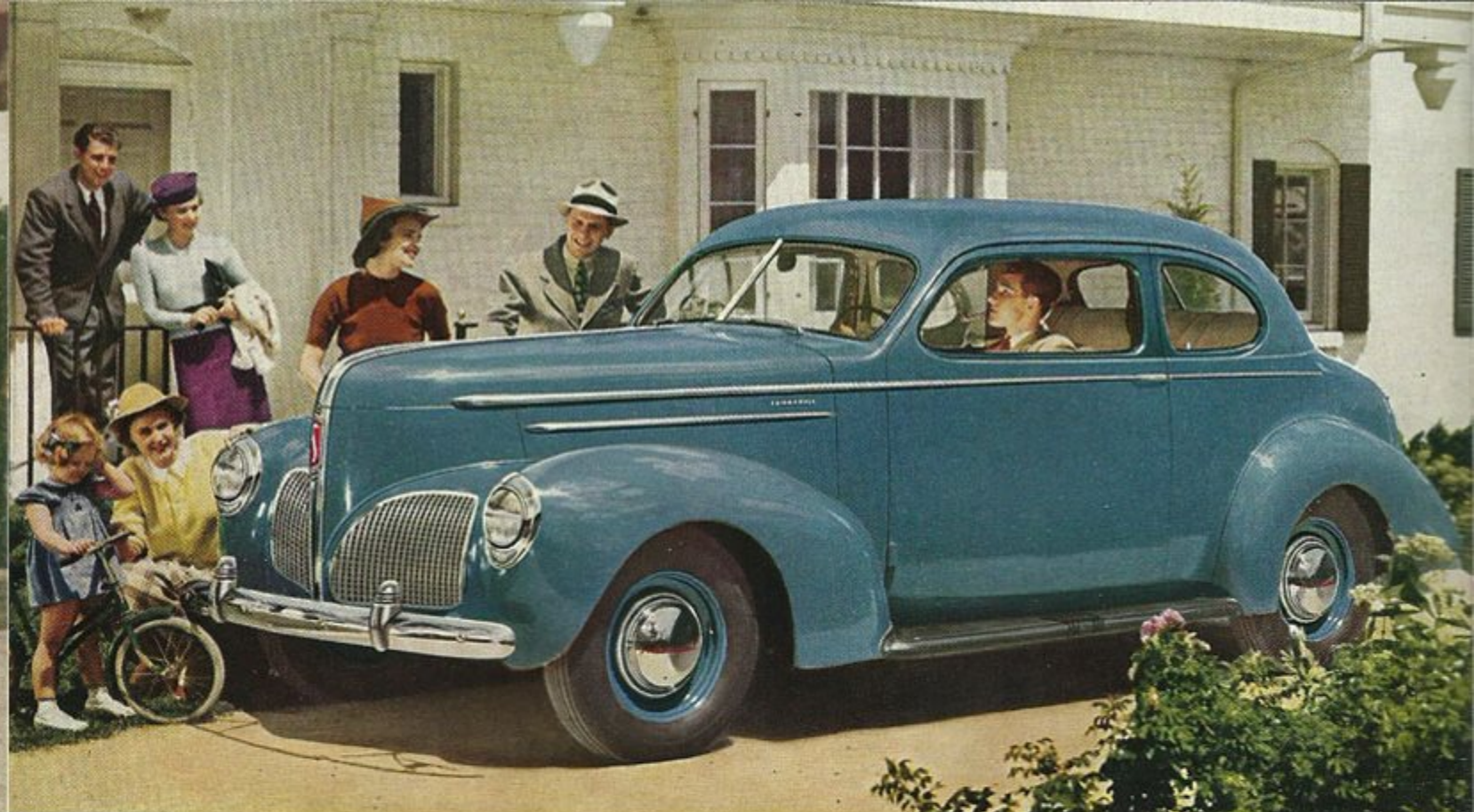
STUDEBAKER STATE COMMANDER 2-DOOR CLUB SEDAN

You get a roomy luxurious motor car in this 1940 Champion, high-powered but of low horsepower rating. Yet because this full-fledged team mate of Studebaker's Commander and President consumes so small an amount of fuel—10% to 25% less than other cars of its low price—you save both on fuel cost and fuel tax every mile you drive.