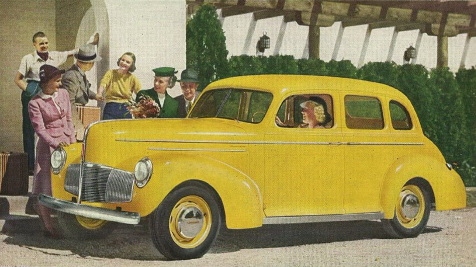
STUDEBAKER CHAMPION 4-DOOR CRUISING SEDAN