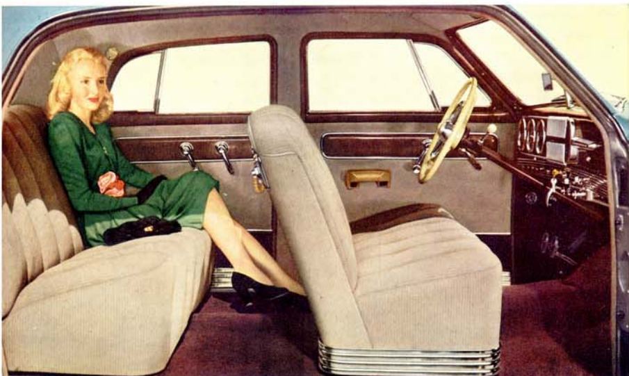
The Land Cruiser's spacious, 6-passenger Regal De Luxe interior sets the pattern for a new postwar mode in motor car luxury. You won't find anything finer in the most costly motor car.

A low, long, luxurious new kind of car . . . especially distinguished for its far advanced postwar styling, exceptional comfort and brilliant performance