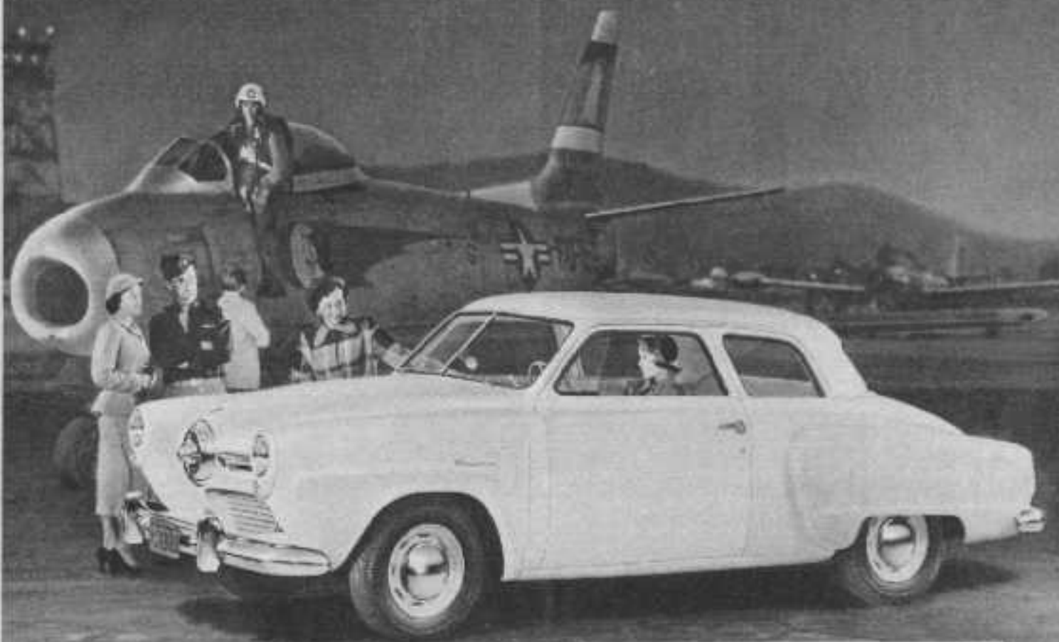
STUDEBAKER CHAMPION 2-Door Custom Sedan

TOP QUALITY CAR IN THE LOWEST PRICE FIELD