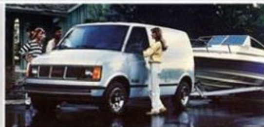
Available equipment from GMC Truck enables Safari to tow large trailers.