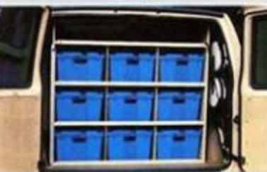
Vocational racks, partitions and other special equipment are available from aftermarket suppliers. Ask your GMC Dealer for details.

Safari comes only in standard trim, but a large selection of paint colors, moldings, striping and other dress-up trim is available. A vinyl-trimmed low-back driver seat, insulated front compartment headliner and black rubber floor covering in the driver area are standard. Available seating includes a matching low-back passenger seat, and arrangements of two or four high-back bucket seats. Interiors offer a choice of four colors, depending on your selection of seats and upholstery fabric.