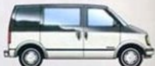
Available glass for sliding door, side panel opposite door, and rear doors