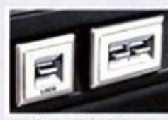
Power door locks and/or power windows