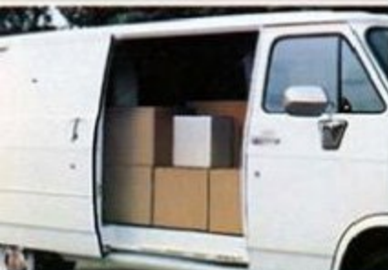
Easy-sliding side cargo door with wide opening is standard.