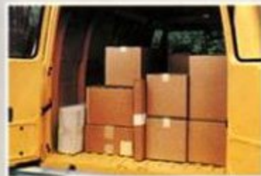
Rear doors open wide for easy loading. Positive-stop feature is available.

S - Standard A - Available 1 - Model TG1305 only 2 - Not available in California 3 - Model TG1305 only