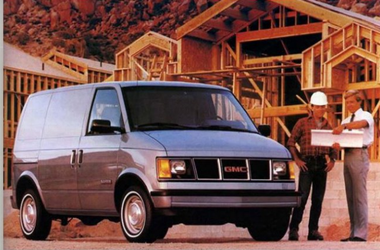
Safari Cargo Van shown with available equipment.