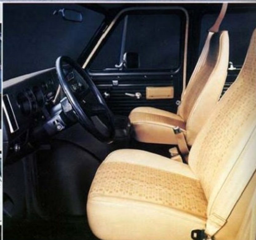
Available high-back bucket seats come in new Standard Vinyl material (shown) in two colors or available Custom Vinyl in five colors.