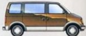
Available complete body glass