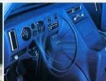
Comfortilt steering wheel