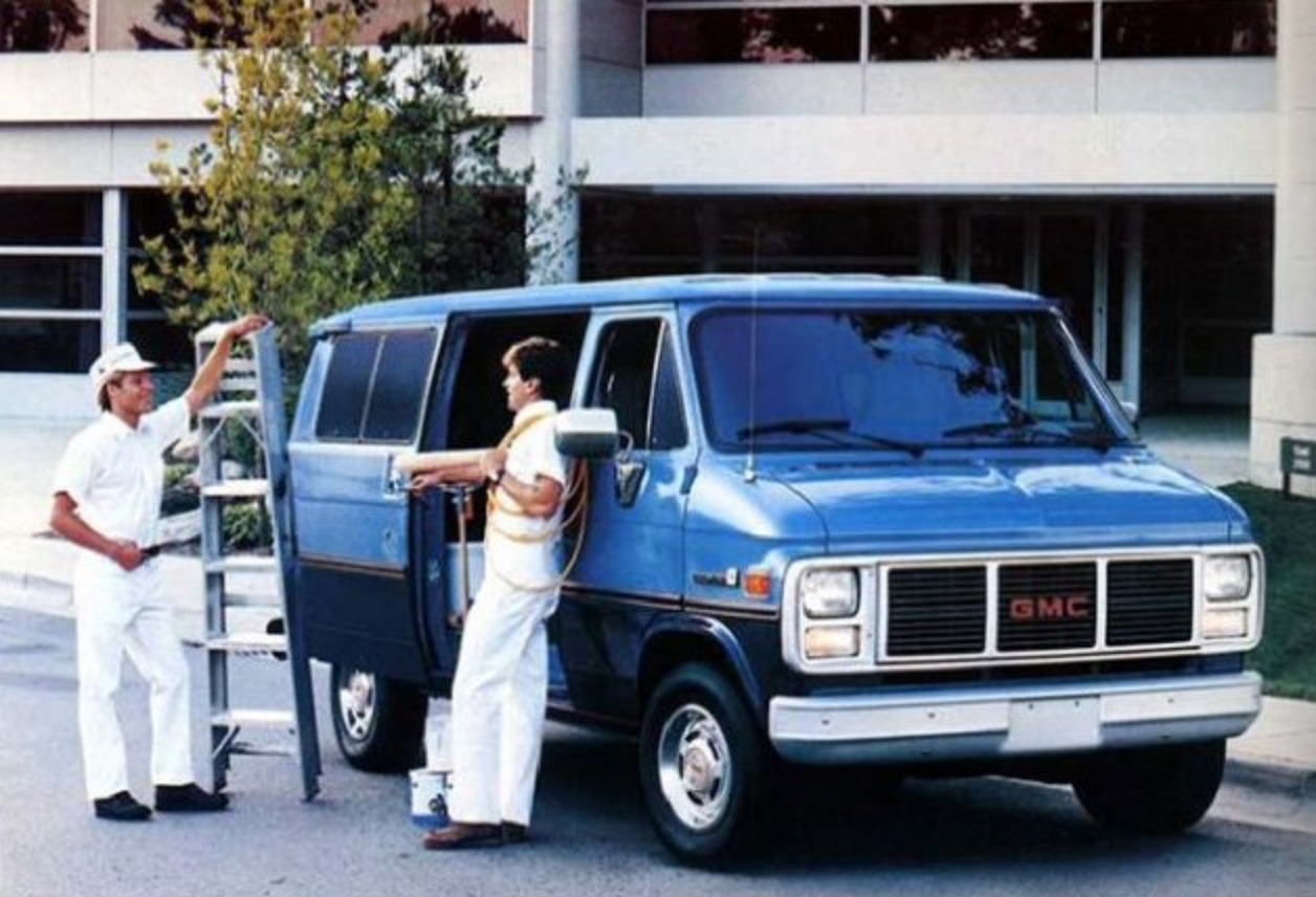
Series 1500 Vandura shown with Special Two-Tone paint scheme and other available equipment.