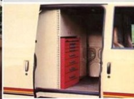
Safari helps simplify cargo loading with a wide-opening, easy-sliding side door.