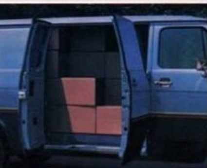
60/40 panel side doors are available at no extra charge to replace standard sliding door.