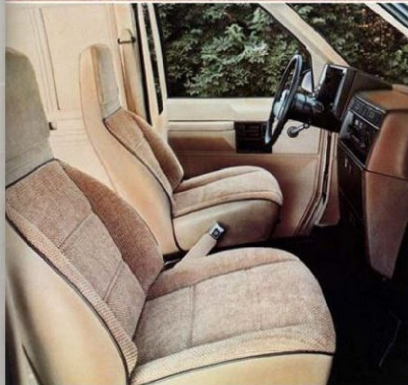
High-back bucket seats are available with Standard Vinyl and Custom Cloth (shown) or Custom Vinyl upholstery.