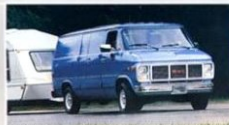
Vandura has the muscle to tow large trailers with available equipment from GMC Truck.