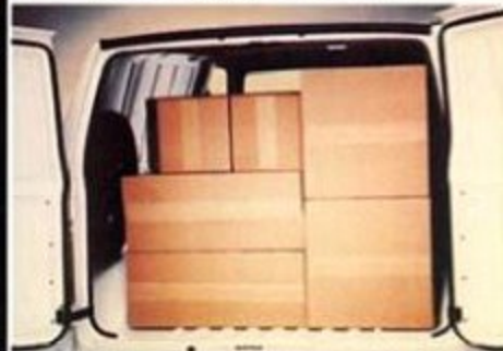
Panel-type rear doors can be swung open almost 180°. Flat load floor only 24.8" from ground level makes loading easy.