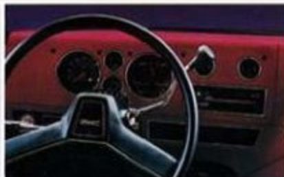
Instruments are arranged and identified for easy reading.

5.0 Liter V8 Gasoline. A job-proven engine that provides impressive performance for a wide range of commercial applications.