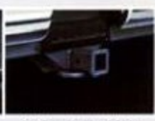
Platform trailer hitch