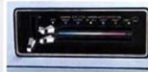
Front air conditioning

Your Vandura can be ordered with available Trailing Special Equipment packages to help you properly equip it for trailering. See your GMC Truck Dealer for details.