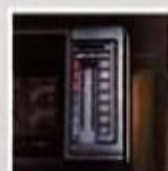
Front air conditioning

Safari Cargo Van can be ordered with available Trailing Special Equipment packages to help you properly equip it for trailering. See your GMC Truck Dealer for package content, and ask him for the '87 GMC Truck Trailering Guide which gives complete details on trailering requirements and recommendations.