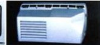
Rear compartment heater