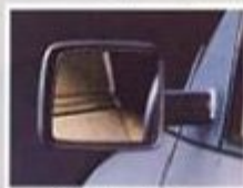
Below-eyeline rearview mirror