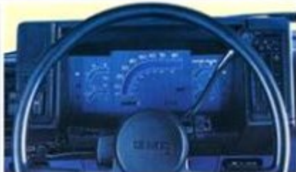
High-tech instrument cluster; gauges and warning lights identified by international graphics.