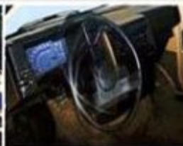
Comfortilt steering wheel