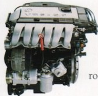
PERFORMANCE: 172-HORSEPOWER VR6 ENGINE

15 degrees to reduce weight, every VW has plenty