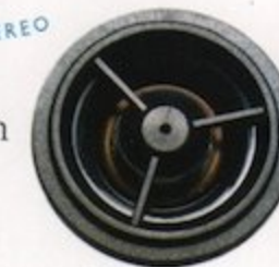
SOUND: MULTI-SPEAKER STEREO