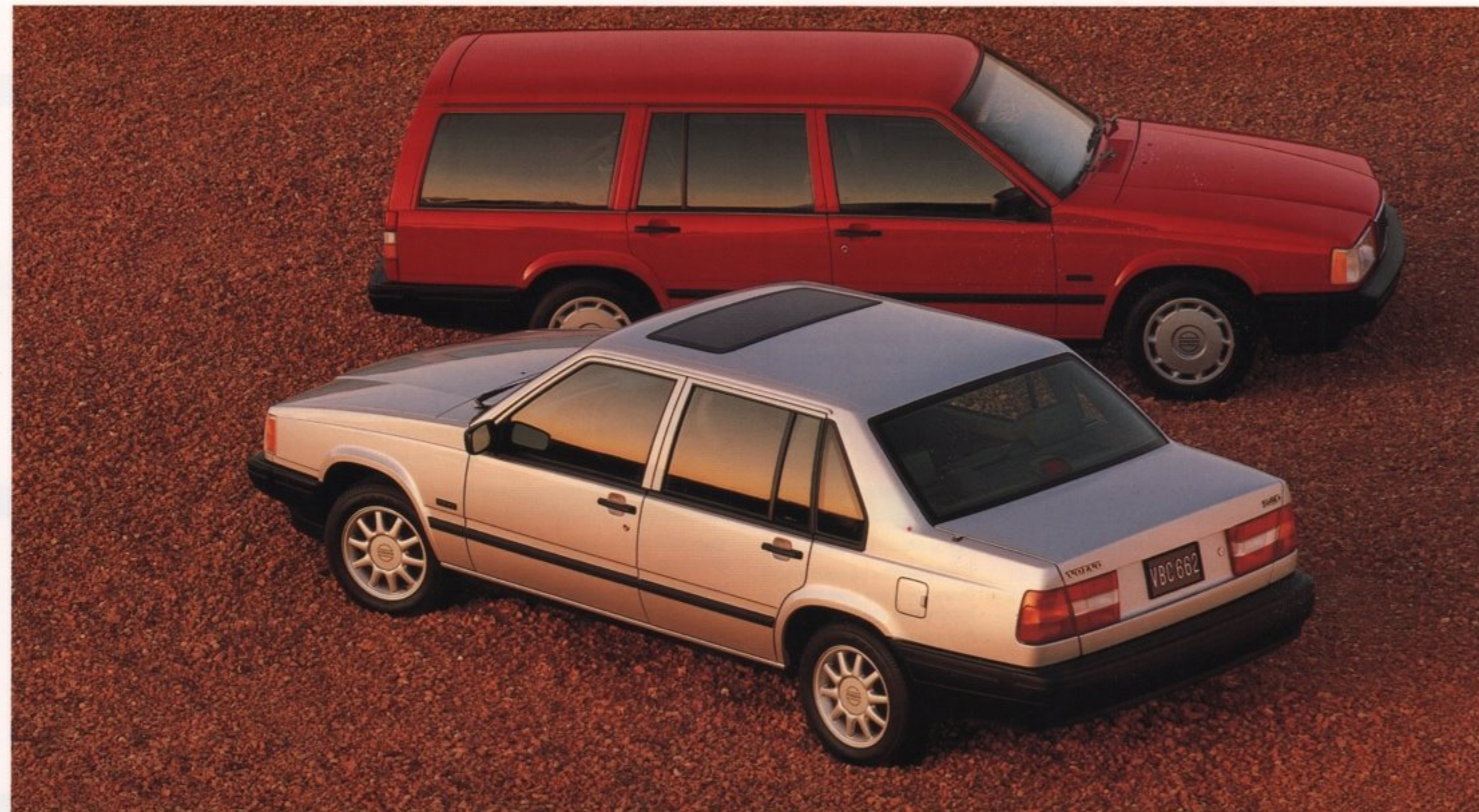
940 Sedan and Wagon (shown with optional equipment)