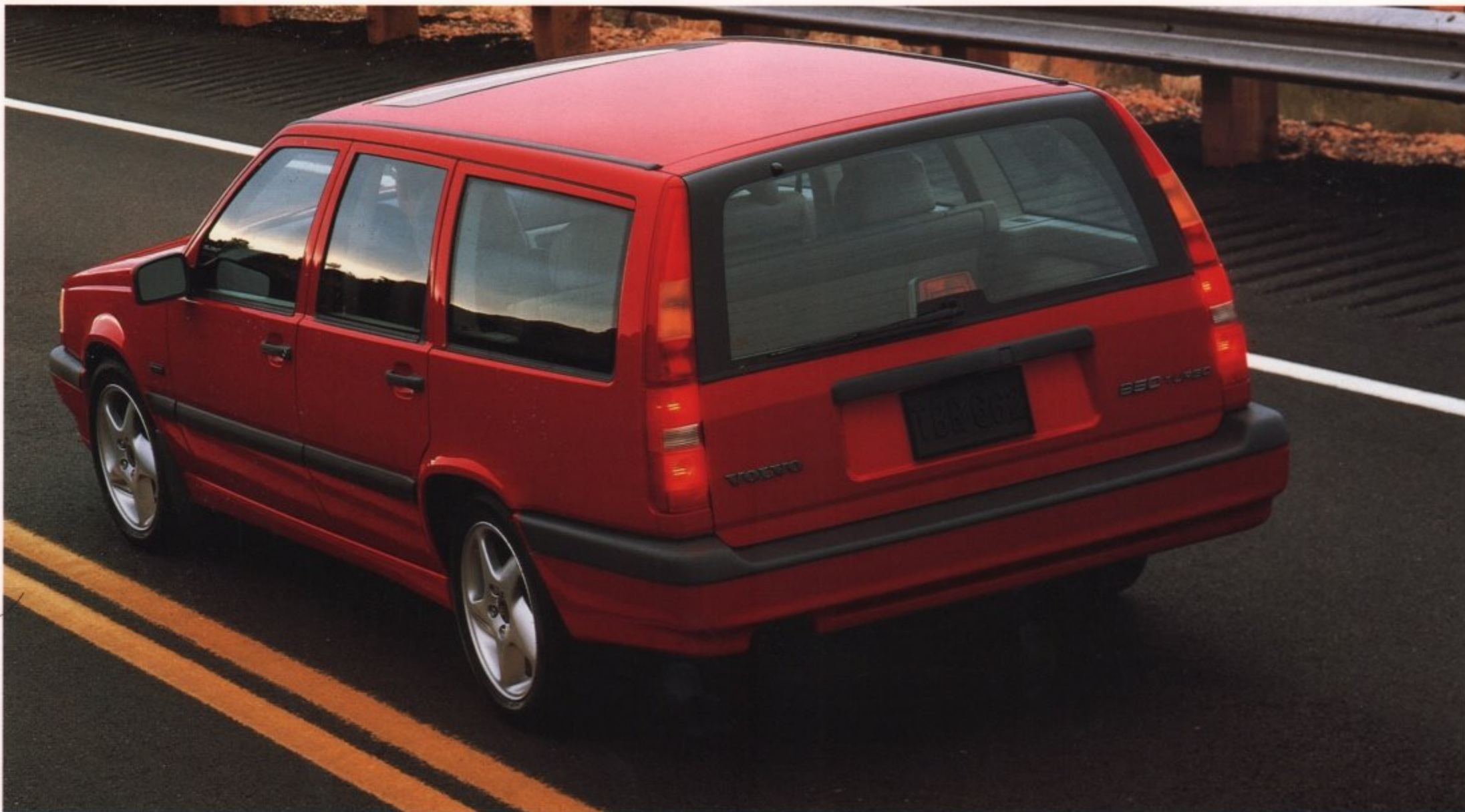
850 Turbo Sportswagon