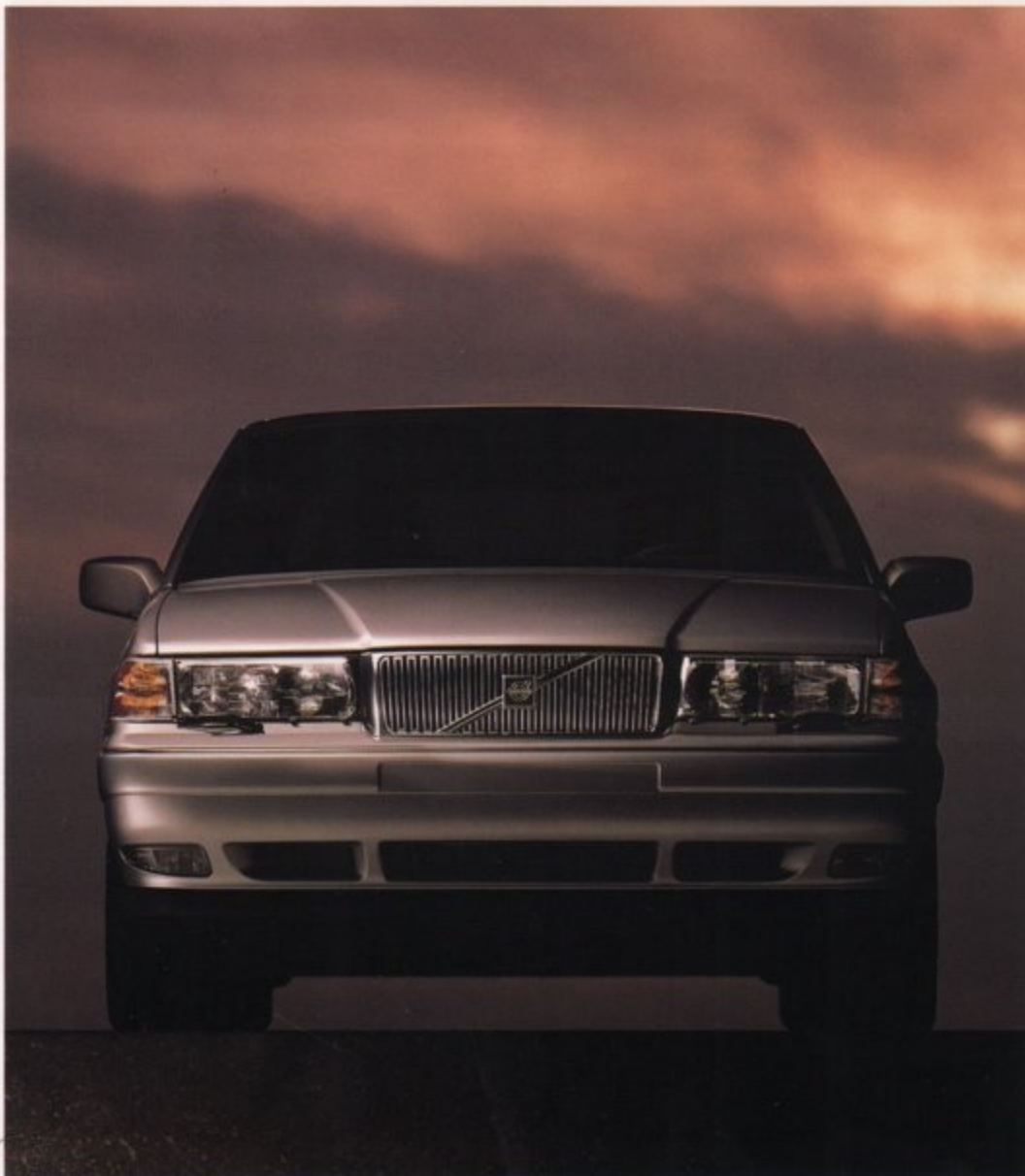
960 Touring Sedan