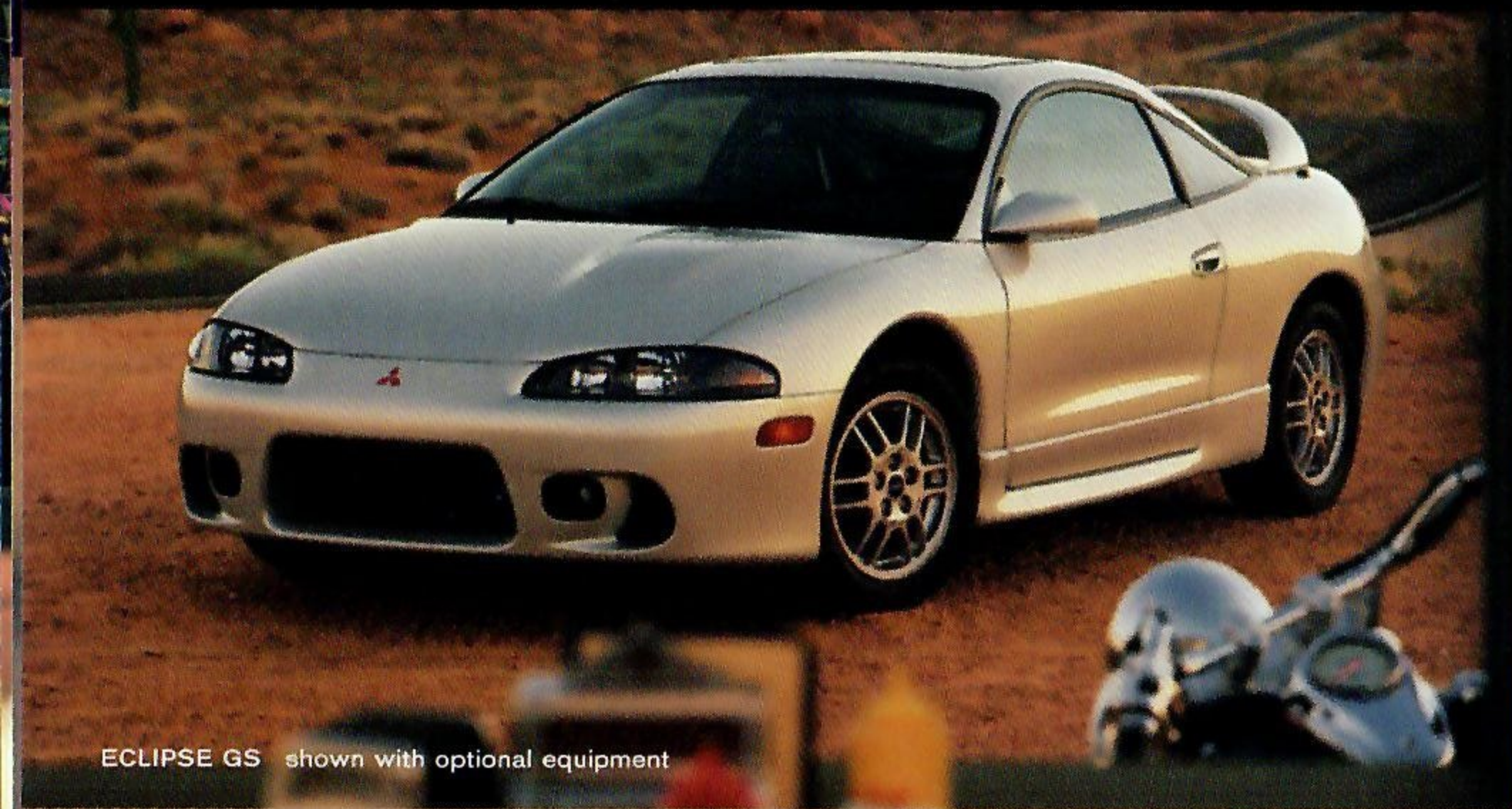
ECLIPSE GS shown with optional equipment

How much excitement can you handle? The Mitsubishi Eclipse offers several savory ways to fulfill your appetite. Start with a sleek, aggressive shape, enjoy an agile, fully independent multi-link suspension, and feast on a main course of up to 210 turbocharged horsepower. There are four coupe versions—two turbocharged and one even adding the surefooted handling stability of All-Wheel Drive. Pick one of the two Eclipse Spyder models, and the fine-crafted soft-top opens to the sun in just 10 seconds. And no matter which way you go, you'll find the Eclipse performs just as well in the comfort and convenience taste test. So go ahead, indulge yourself.