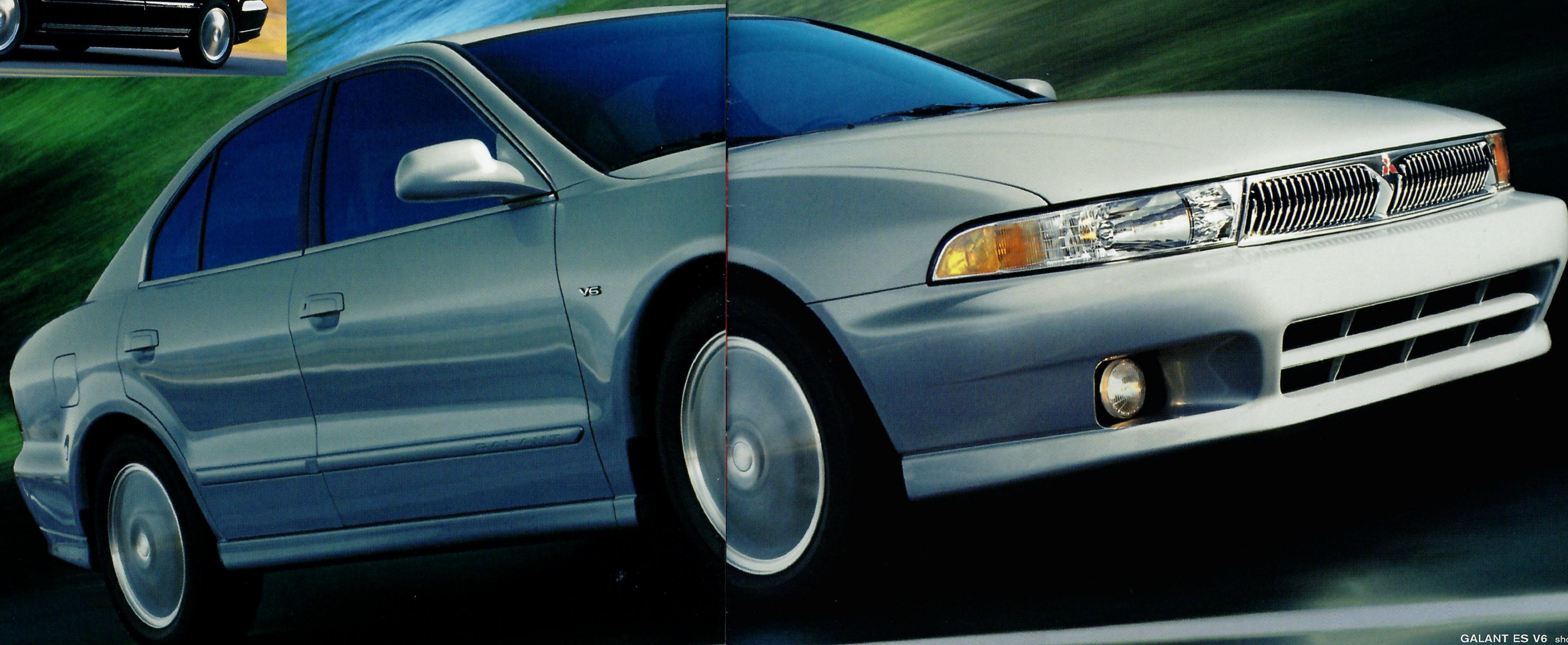
GALANT ES V6 shown with optional equipment

Sedans and pulses can coexist. Want proof? See the new Mitsubishi Galant. With a responsive 4-wheel independent suspension and available 3.0-liter V6, it's one family sedan that will get you home to your family faster. Beneath its sharp, sophisticated styling is the kind of quality engineering that ensures it's fun to drive and made to last. And inside the light, airy cabin you'll find all the room, comfort and security required for a trip into town, out for the evening or off to your favorite weekend spot. There are five value-rich models from which to choose, including the sport-tuned GTZ. No matter which one you prefer, you'll discover that there is life after four doors.