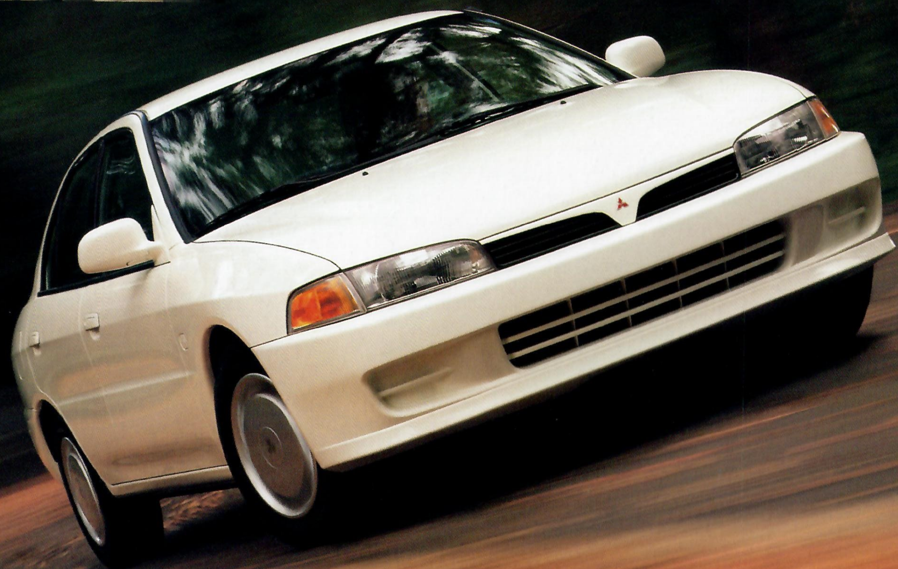
MIRAGE SEDAN LS shown with optional equipment