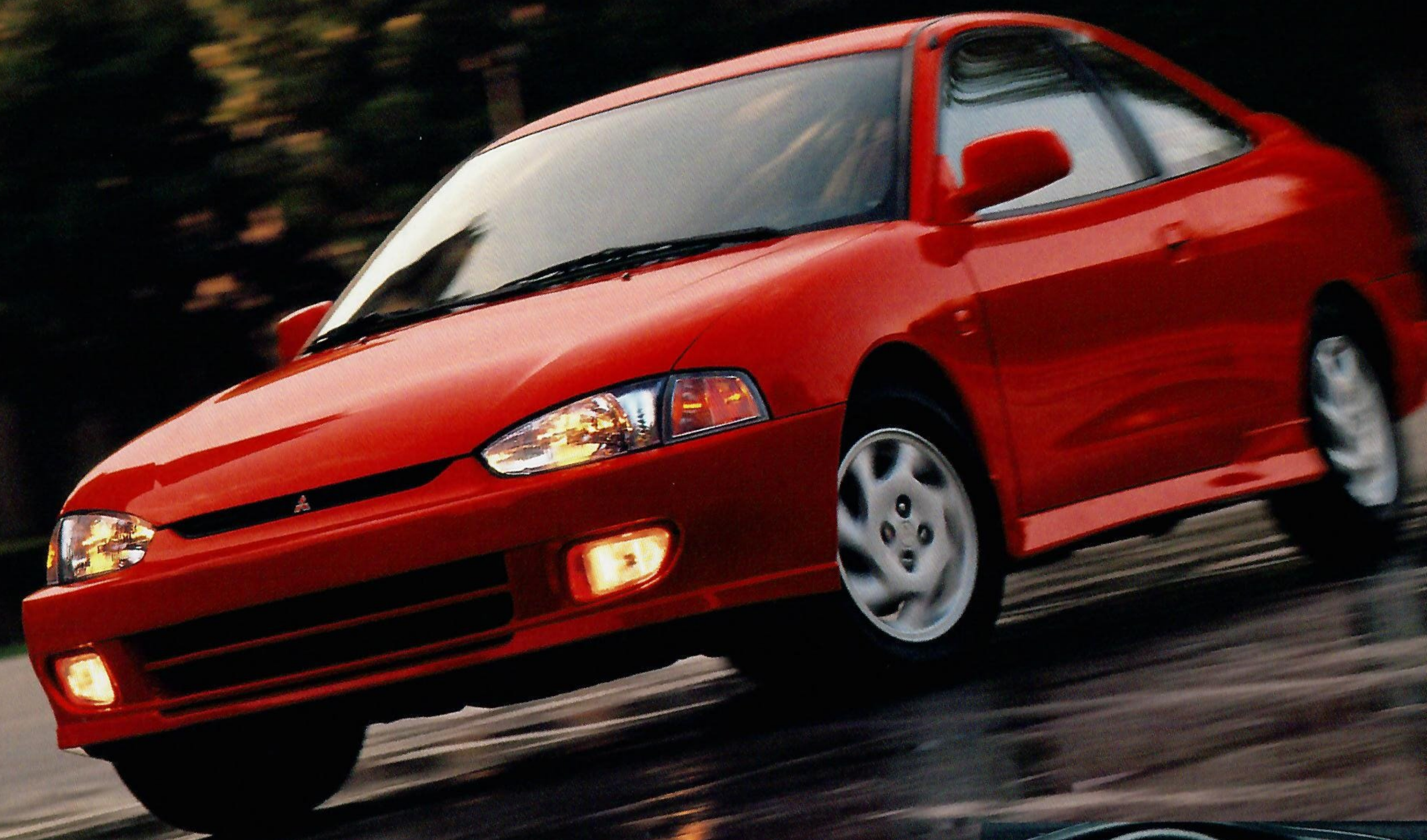
MIRAGE COUPE LS shown with optional equipment

Question: How do you get loads of fun for little dough? Answer: Drive a Mirage Coupe with its nimble suspension and powerful yet economical multi-valve 1.5- or 1.8-liter engine. And you know what's most fun? Zipping around in a sporty car that makes other coupes look like boxcars.