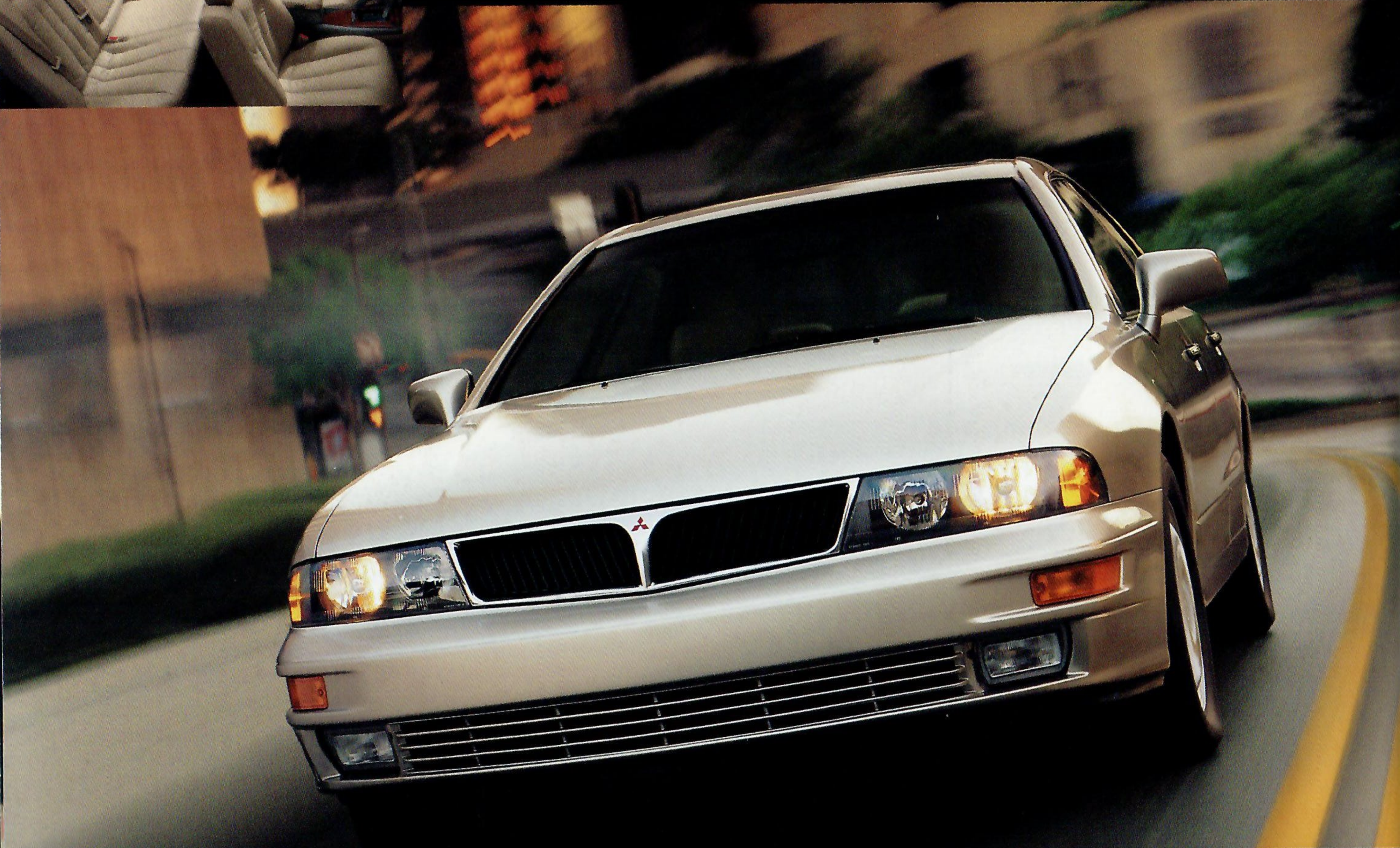
DIAMANTE shown with optional equipment