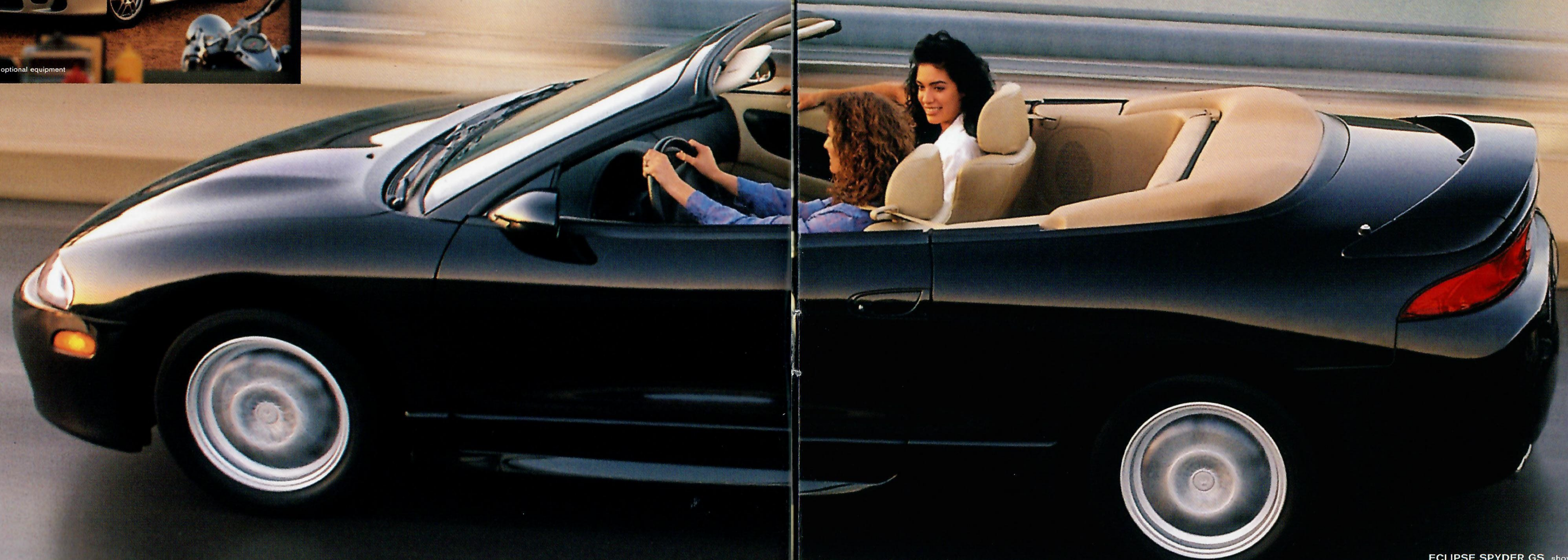
ECLIPSE SPYDER GS shown with optional equipment

How much excitement can you handle? The Mitsubishi Eclipse offers several savory ways to fulfill your appetite. Start with a sleek, aggressive shape, enjoy an agile, fully independent multi-link suspension, and feast on a main course of up to 210 turbocharged horsepower. There are four coupe versions—two turbocharged and one even adding the surefooted handling stability of All-Wheel Drive. Pick one of the two Eclipse Spyder models, and the fine-crafted soft-top opens to the sun in just 10 seconds. And no matter which way you go, you'll find the Eclipse performs just as well in the comfort and convenience taste test. So go ahead, indulge yourself.