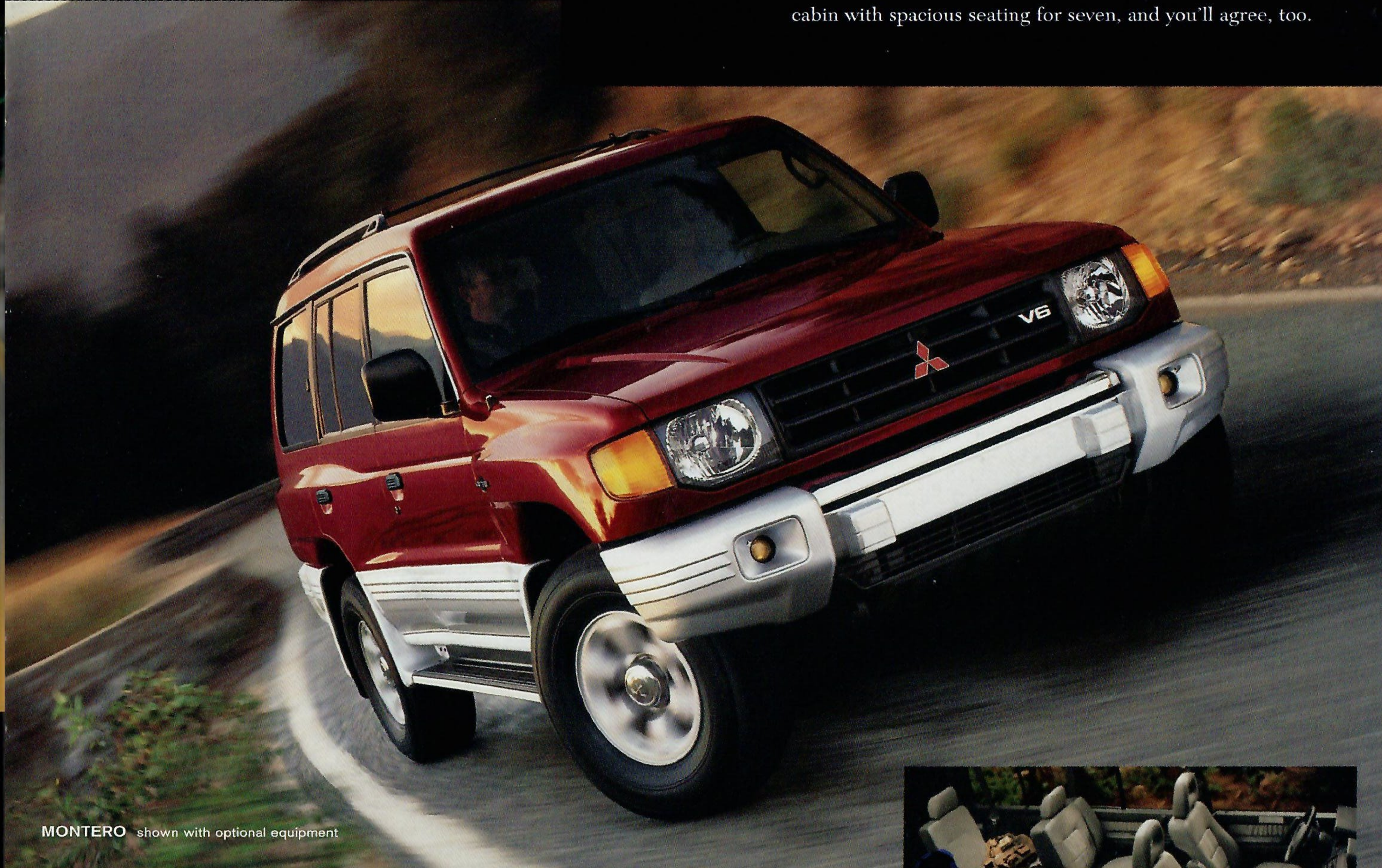
MONTERO shown with optional equipment

It's hard to get people to agree on anything. But Mitsubishi's time-honored SUV, with Active Trac 4WD, ™ a 3.5-liter V6 and Multi-Mode ™ ABS, is revered in 170 countries around the globe. Experience the world from inside its richly outfitted cabin with spacious seating for seven, and you'll agree, too.