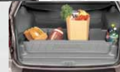
Cargo tray and cargo bin with dividers up. Provides convenient transportation of various articles.