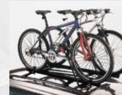
Bike attachment transports two bicycles securely.*