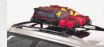
Roof cargo basket increases cargo carrying capacity.*