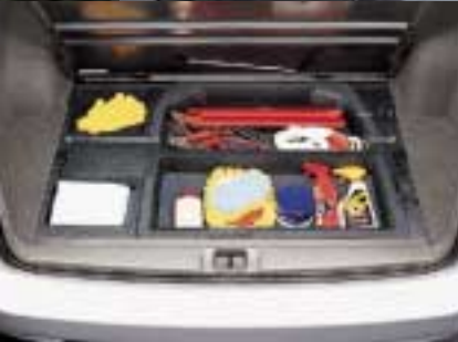
Sub-floor storage in all Legacy wagon and sedan models not only means extra space to stow gear, but because it's hidden away, it offers peace of mind as well.