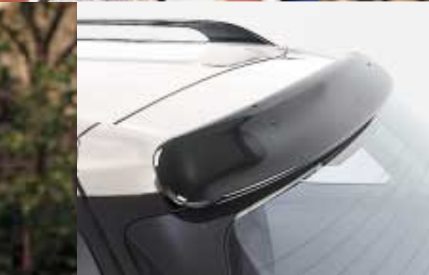
Accessory rear window dust deflector helps keep back window clear of dust for better vision.

* All-Weather Package includes dual-mode heated front seats, heated exterior mirrors and a windshield wiper de-icer.