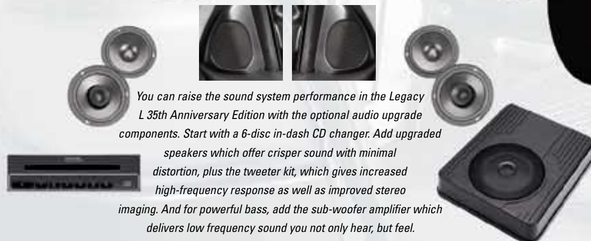
You can raise the sound system performance in the Legacy L 35th Anniversary Edition with the optional audio upgrade components. Start with a 6-disc in-dash CD changer. Add upgraded speakers which offer crisper sound with minimal distortion, plus the tweeter kit, which gives increased high-frequency response as well as improved stereo imaging. And for powerful bass, add the sub-woofer amplifier which delivers low frequency sound you not only hear, but feel.