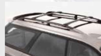
Cross bars may be used in conjunction with all genuine Subaru roof attachments and carriers.