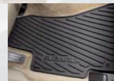
All weather heavy-gauge, custom fitted protective mats.