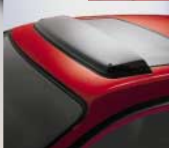
Accessory moonroof air deflector helps reduce wind noise and cut sun glare.