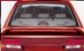
Accessory rear spoiler adds a sporty flavor to Legacy sedan models.

* Based on the Polk Company retail registration statistics as of 7/01/02.