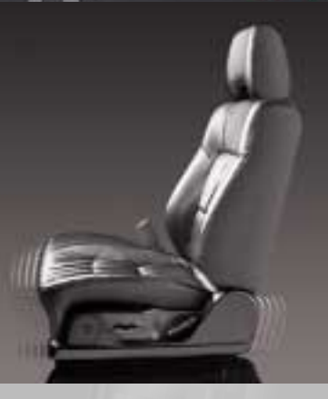
Outback, Outback Limited, and Outback H6-3.0 35th Anniversary Edition models feature a standard 6-way power driver's seat.