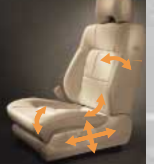
Outback H6-3.0 VDC, H6-3.0 L.L.Bean Edition and H6-3.0 Sedan models add the luxury of an 8-way power driver's seat.