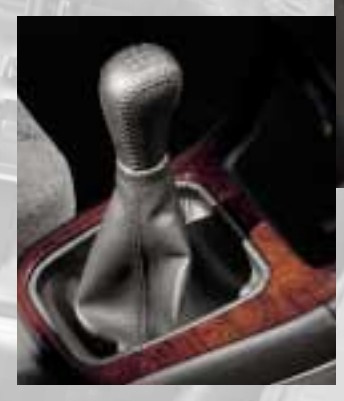
All 4-cylinder Outback models feature a standard smooth shifting 5-speed manual or an available 4-speed electronically controlled automatic transmission.