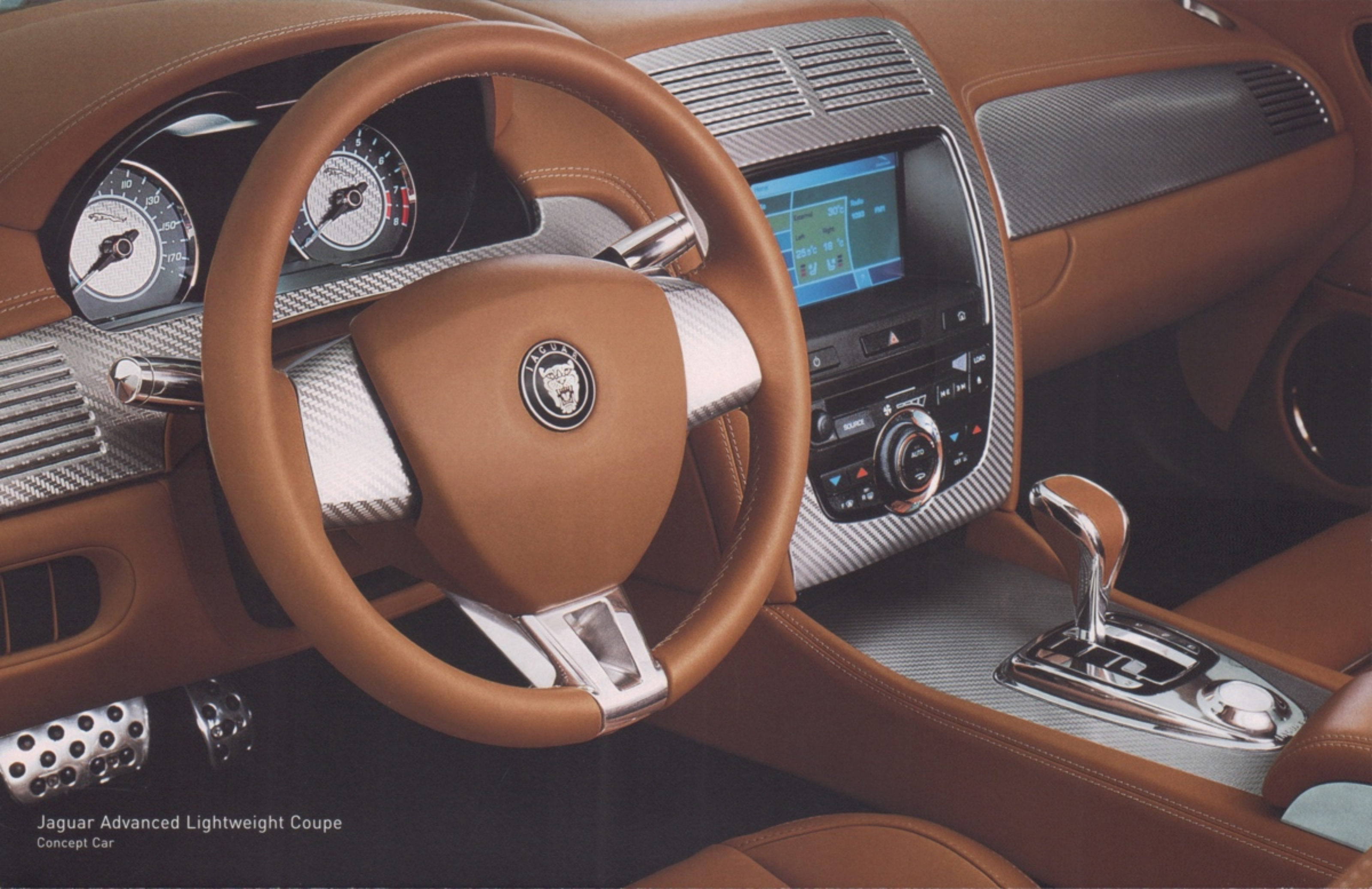
Jaguar Advanced Lightweight Coupe Concept Car