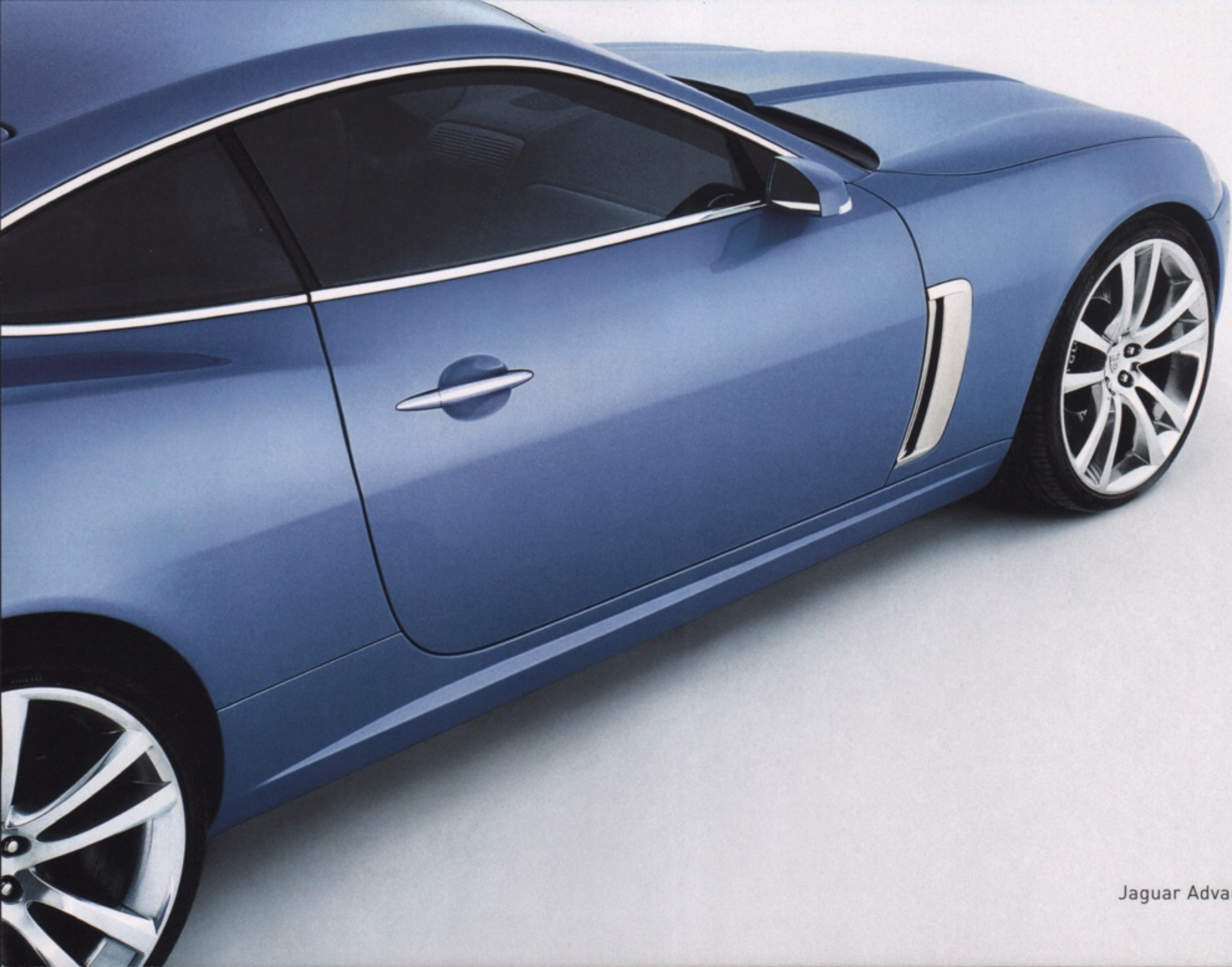
Jaguar Advanced Lightweight Coupe Concept Car