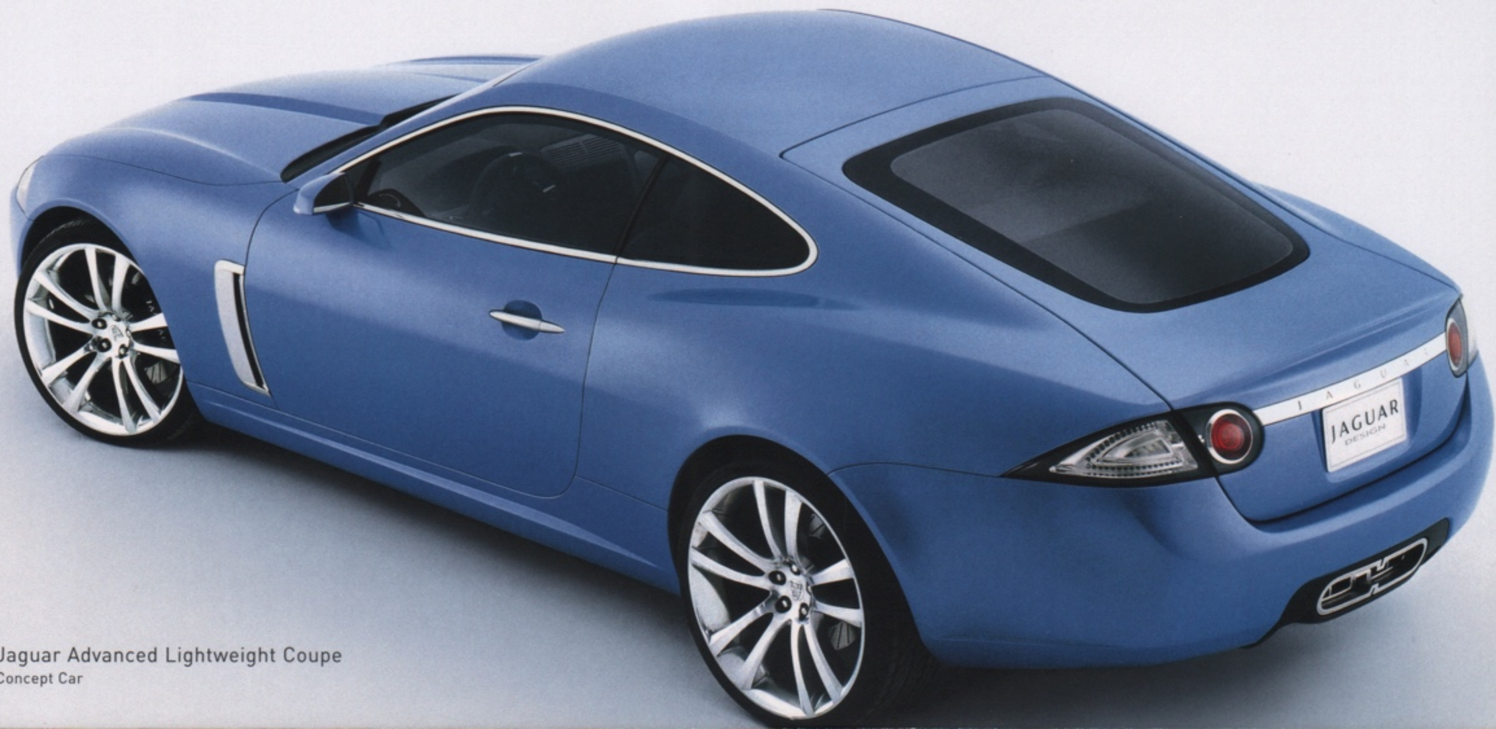
Jaguar Advanced Lightweight Coupe Concept Car