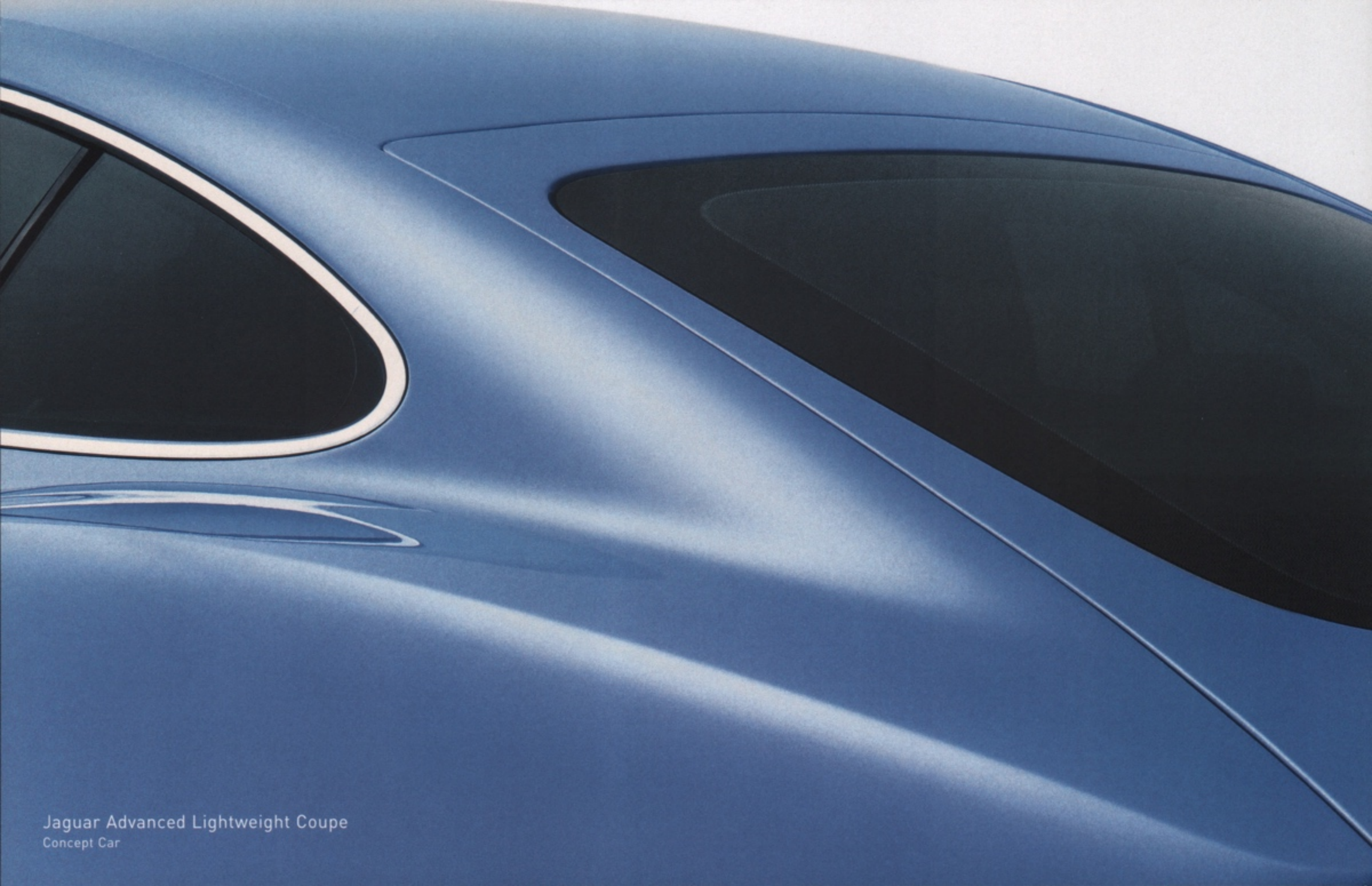
Jaguar Advanced Lightweight Coupe Concept Car