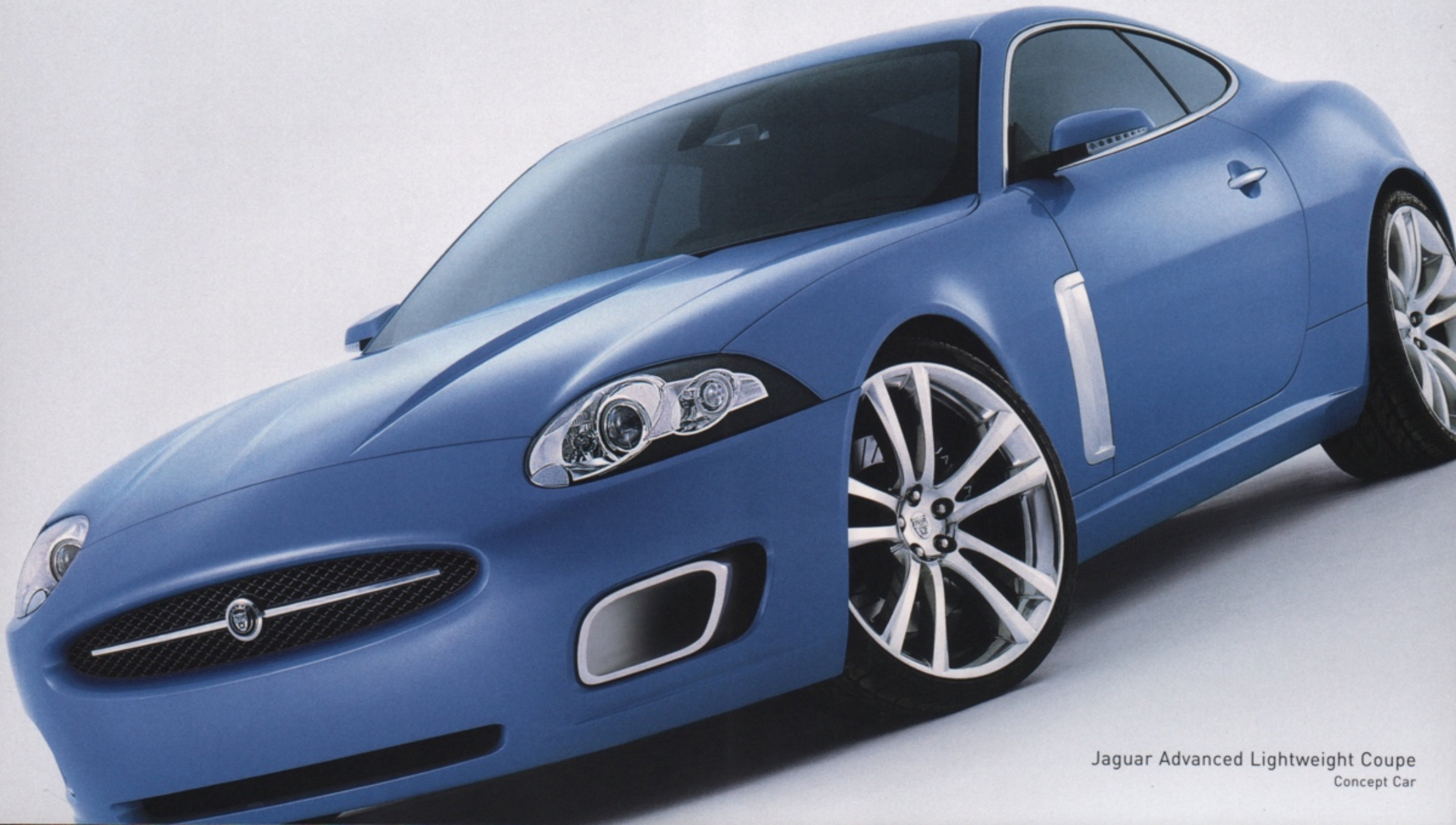
Jaguar Advanced Lightweight Coupe Concept Car