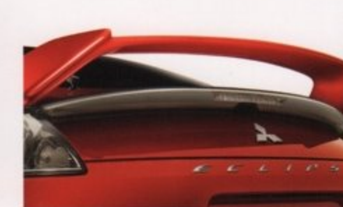
REAR WING SPOILER