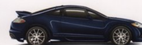
MAIZEN BLUE PEARL / CHARCOAL INTERIOR