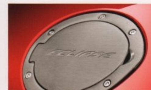
ALLOY FUEL DOOR