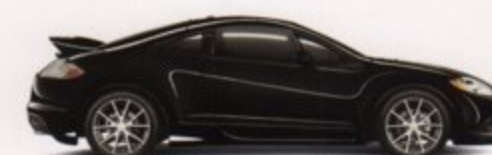
KALAPANA BLACK / CHARCOAL OR GRAY INTERIOR