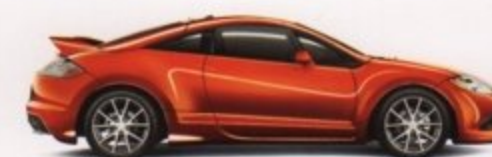
SUNSET PEARLESCENT / CHARCOAL OR TERRA COTTA 1 INTERIOR