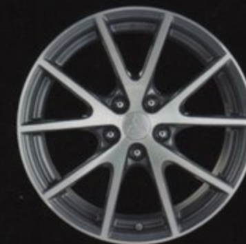
18-INCH MACHINE-FINISH ALLOY WHEELS