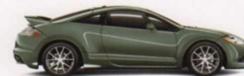
SATIN MEISAI GRAY PEARL / CHARCOAL OR GRAY INTERIOR