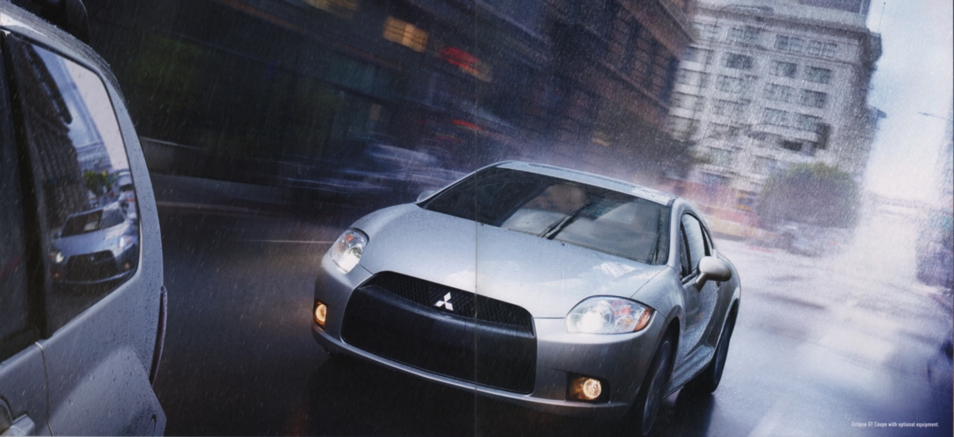
Eclipse GT Coupe with optional equipment.