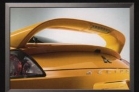
LARGE WING SPOILER