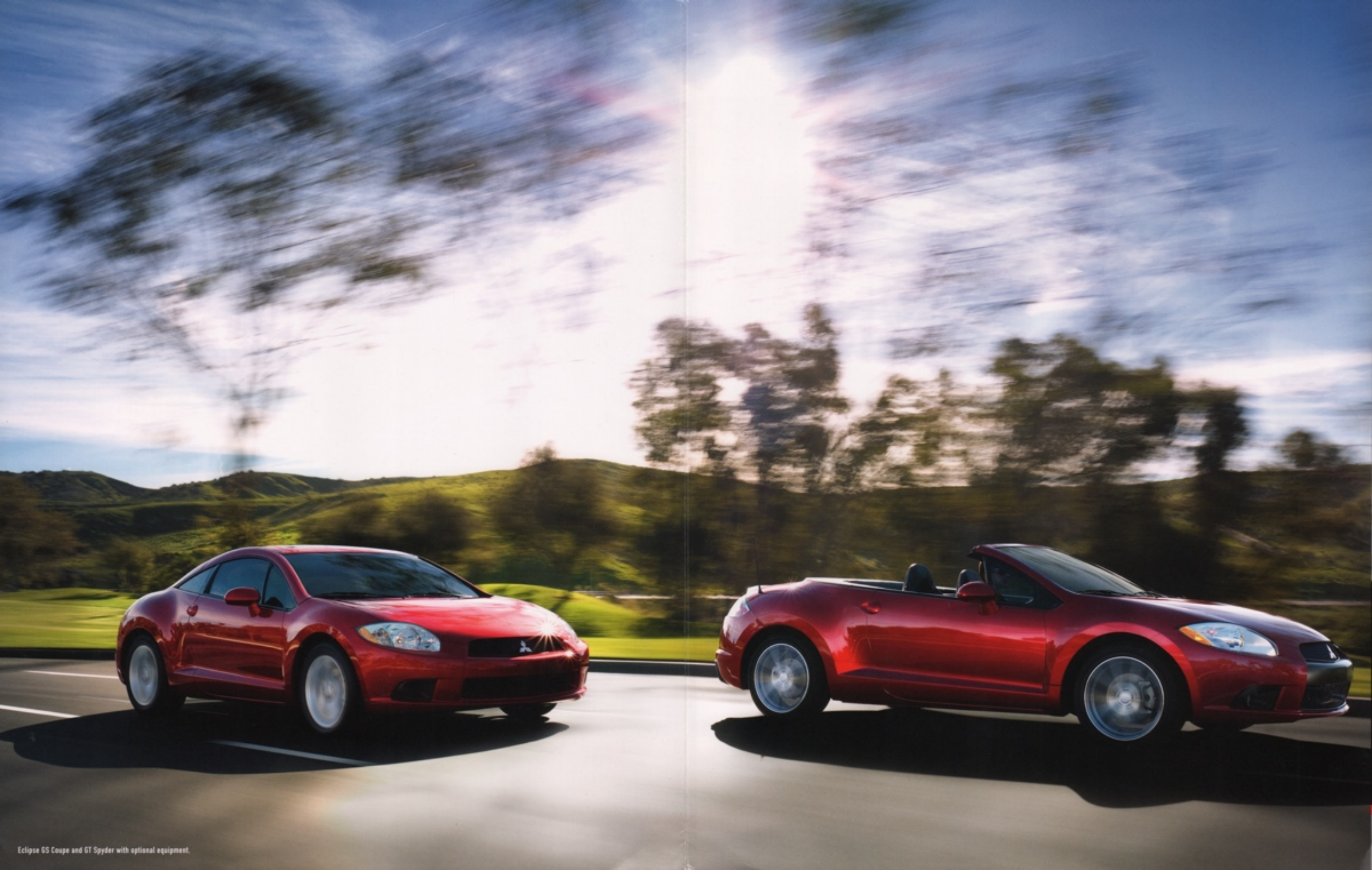
Eclipse GS Coupe and GT Spyder with optional equipment.