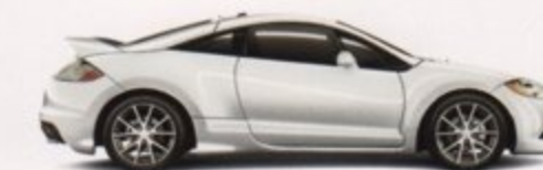
NORTHSTAR WHITE / CHARCOAL INTERIOR