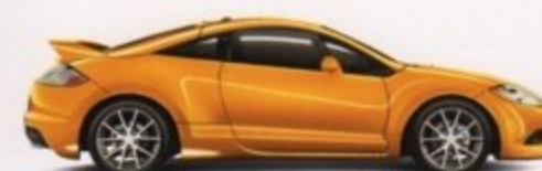
SOLAR / CHARCOAL INTERIOR