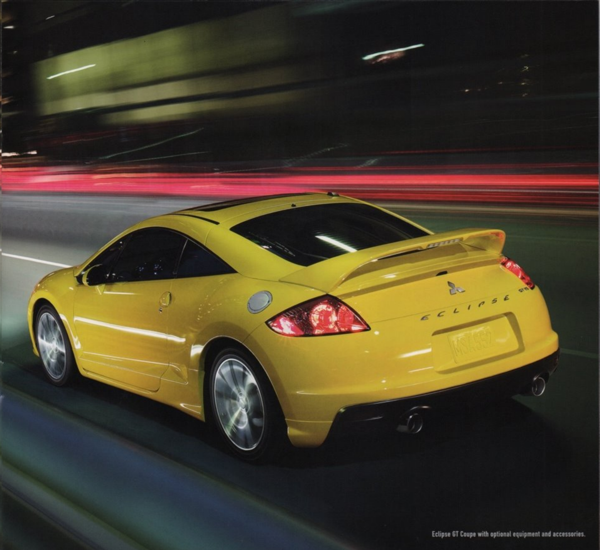
Eclipse GT Coupe with optional equipment and accessories.