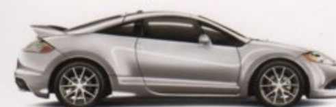
QUICK SILVER PEARL / CHARCOAL OR GRAY INTERIOR