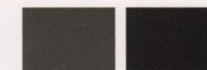
GRAY CLOTH TOP GRAY INTERIOR