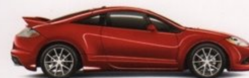
RAVE RED PEARL / CHARCOAL INTERIOR