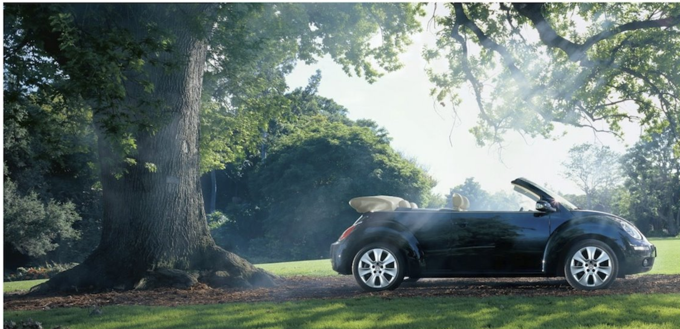
New Beetle Convertible shown with accessory roof cover.

With so many unparalleled features and benefits, the New Beetle can very well allow itself the big grin you see when looking at it face on. And you'll be grinning right back as you enjoy its German engineering, European styling, spirited performance, roomy interior, innovative features ... the list really does go on and on. That said, there's even more to the 2010 New Beetle than meets the eye. So take a closer look and see just how fun it can be.