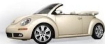
Harvest Moon Beige