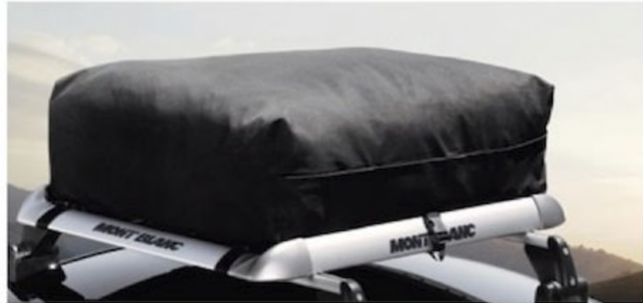
Aluminum luggage platform and soft luggage carrier

To drive and thrive in a New Beetle, you have to be a unique kind of person. Here's where you can push that to the maximum. Stainless steel pedal caps will allow your feet to have as much fun as you do. Downforce, aerodynamics and style are the inspiration for a rear hatch spoiler. You can protect your convertible roof and make your car's appearance a little more sleek with an interior-matching boot cover. Choosing factory cargo organizers will help organize your cargo. And Monster Mats™ will keep your carpets clean. Splash guards will protect the underbody from gravel, sand and salt. Add a base rack system to carry everything from bikes to skis to kayaks to who-knows-what, and your New Beetle can let you tackle all the great outdoors.