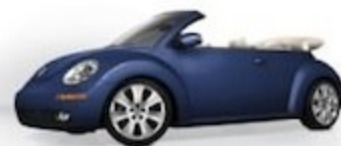
Shadow Blue Metallic**