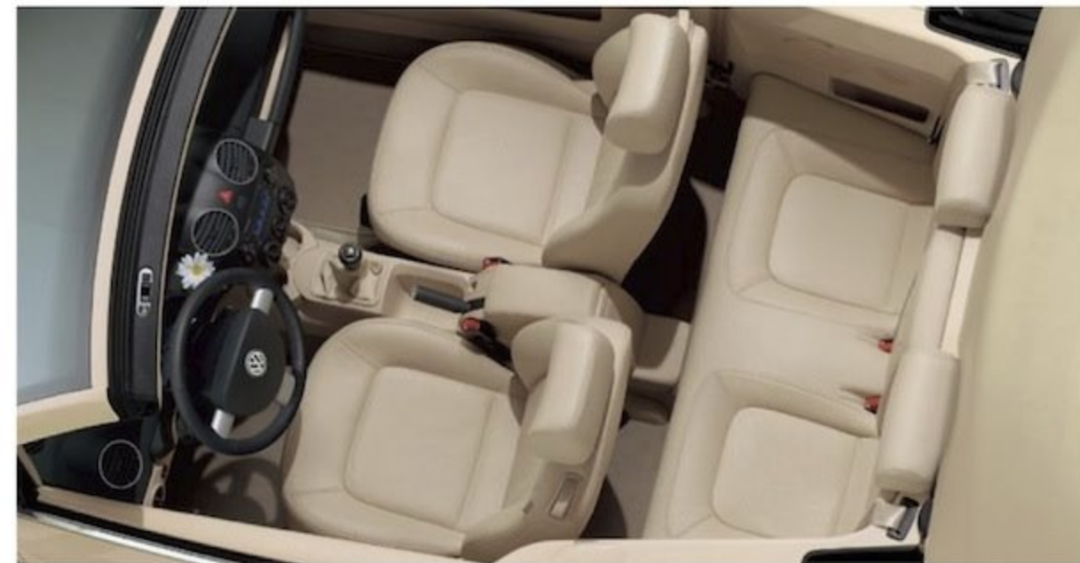
European model shown.

The 2010 New Beetle is designed for driving pleasure of the peppy kind. This is due to the 2.5L, 5-cylinder engine that unleashes 150 hp, 170 lb-ft of torque and a ton of euphoria on the road. Kudos also goes out to the available 6-speed automatic transmission that performs like a sporty manual, much to the delight of New Beetle drivers, and passengers, everywhere.