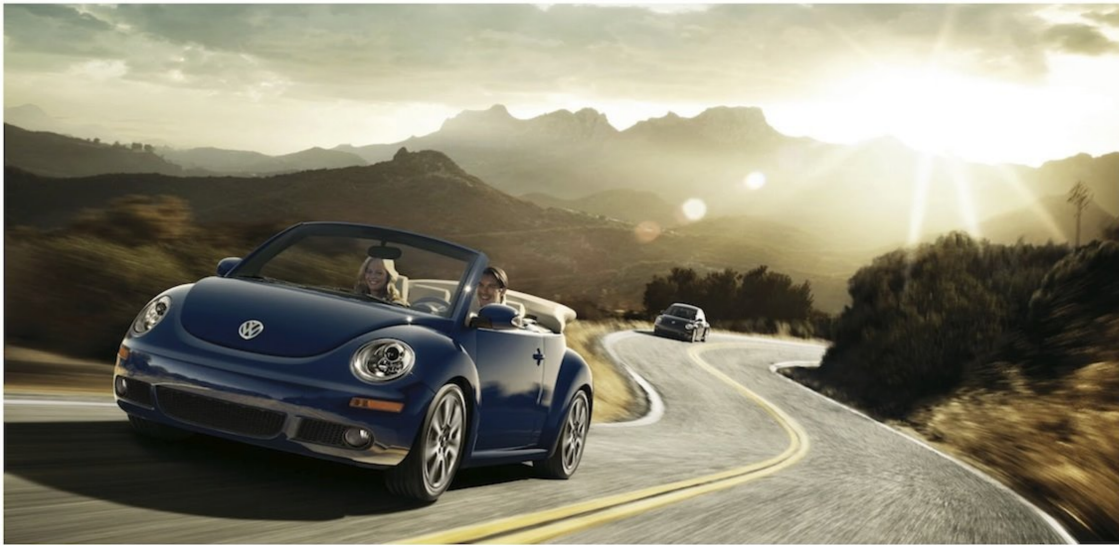
New Beetle Convertible shown with accessory roof cover.