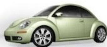
Gecko Green Metallic*