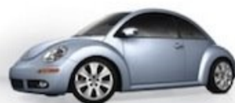
Heaven Blue Metallic