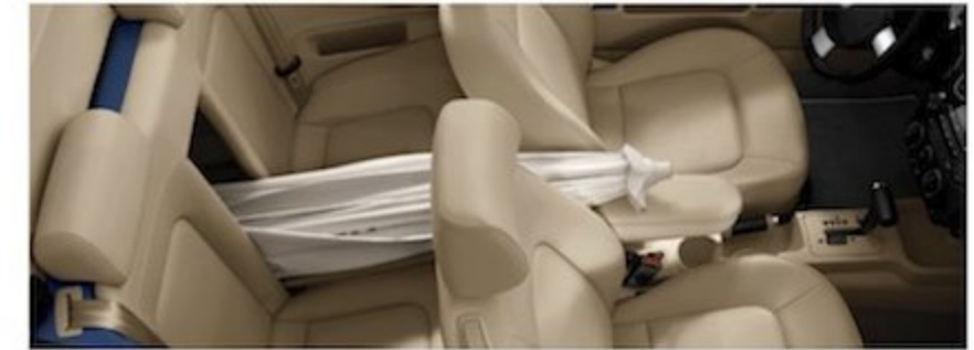
New Beetle Convertible shown with accessory roof cover.