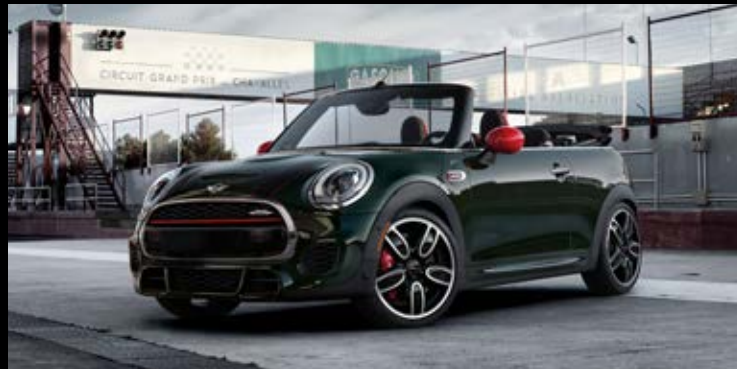
THE MINI JOHN COOPER WORKS CONVERTIBLE. Perfect when you love both open throttles and open tops.