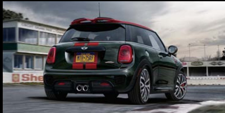
THE MINI JOHN COOPER WORKS HARDTOP. For iconic looks and high performance, it's a classic choice.

When our Engineers set out to design a new MINI, they always start with MINI John Cooper Works models. Once they've built and perfected the most powerful and commanding MINI, they base all other models on this high standard.