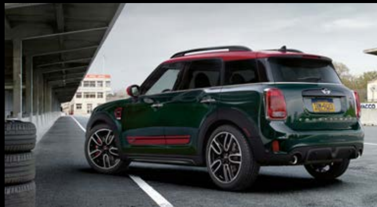
THE MINI JOHN COOPER WORKS COUNTRYMAN ALL4. The roomy choice for adrenaline-fueled excursions far and near.