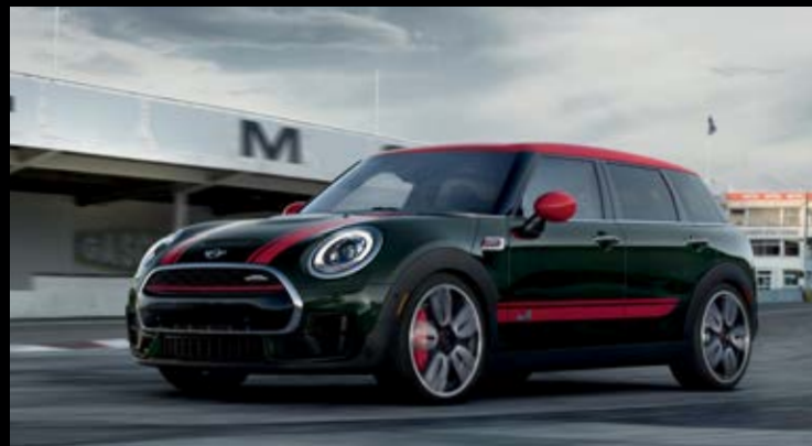
THE MINI JOHN COOPER WORKS CLUBMAN ALL4. For those as comfortable with tailor-made suits as racing suits.