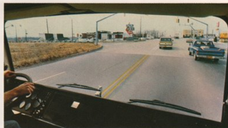
Visibility is great with wide-sweep windshield and large rear-view mirrors. Easy access, spacious cab and power steering to make the driver's job as comfortable as possible.