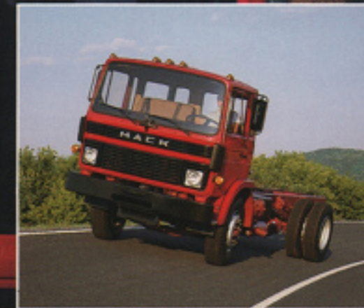
Mack's roomy, comfortable Mid-Liner cab incorporates wide door openings, self-cleaning cab steps, and strategically-placed grab handles for easy, safe entry and exit.

A comfortable driver's environment means a more productive operation. The Mid-Liner MS cab combines all of the benefits of cabover design—excellent visibility and a commanding seating position—with easy, safe entry and exit, and ample room for the driver and two full-size passengers. Rich, textured surface materials cover the cab interior and door panels, sealing out noise and weather. Form-fitting seats and standard integral power steering minimize fatigue. The instrument panel displays clear, functional gauges at a glance and convenient controls within easy reach. Storage bins and provisions for radios are also included, along with padded sun visors. A comprehensive ventilation system, including in-door vent windows and optional in-dash air conditioning, provides effective coverage. The suspended accelerator, brake, and clutch pedals help keep the driver's floor area clean. And the hand falls naturally to the transmission's smooth-shifting lever.