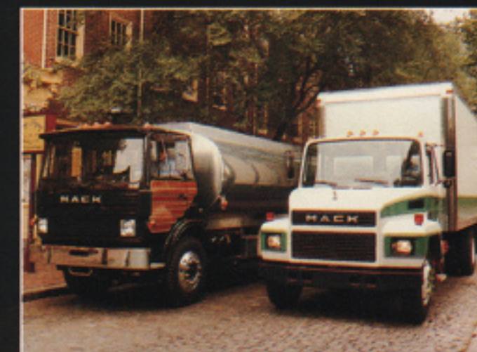
The Mack Mid-Liner MS (left) and CS (right) models. Business machines with proven performance.