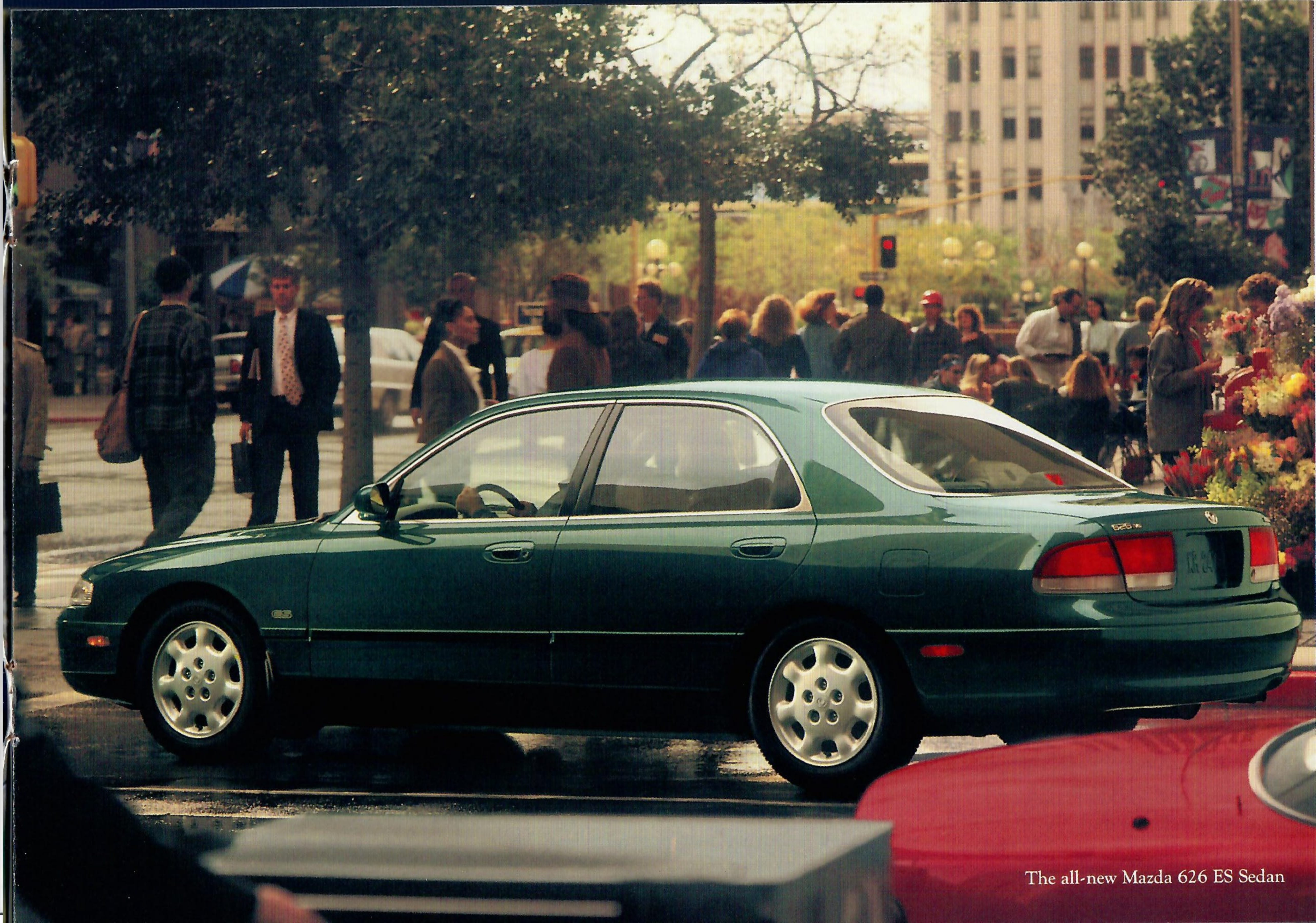
The all-new Mazda 626 ES Sedan

*Seating surfaces upholstered in leather except for seat side panels, rear sides of seatbacks, and other minor areas.