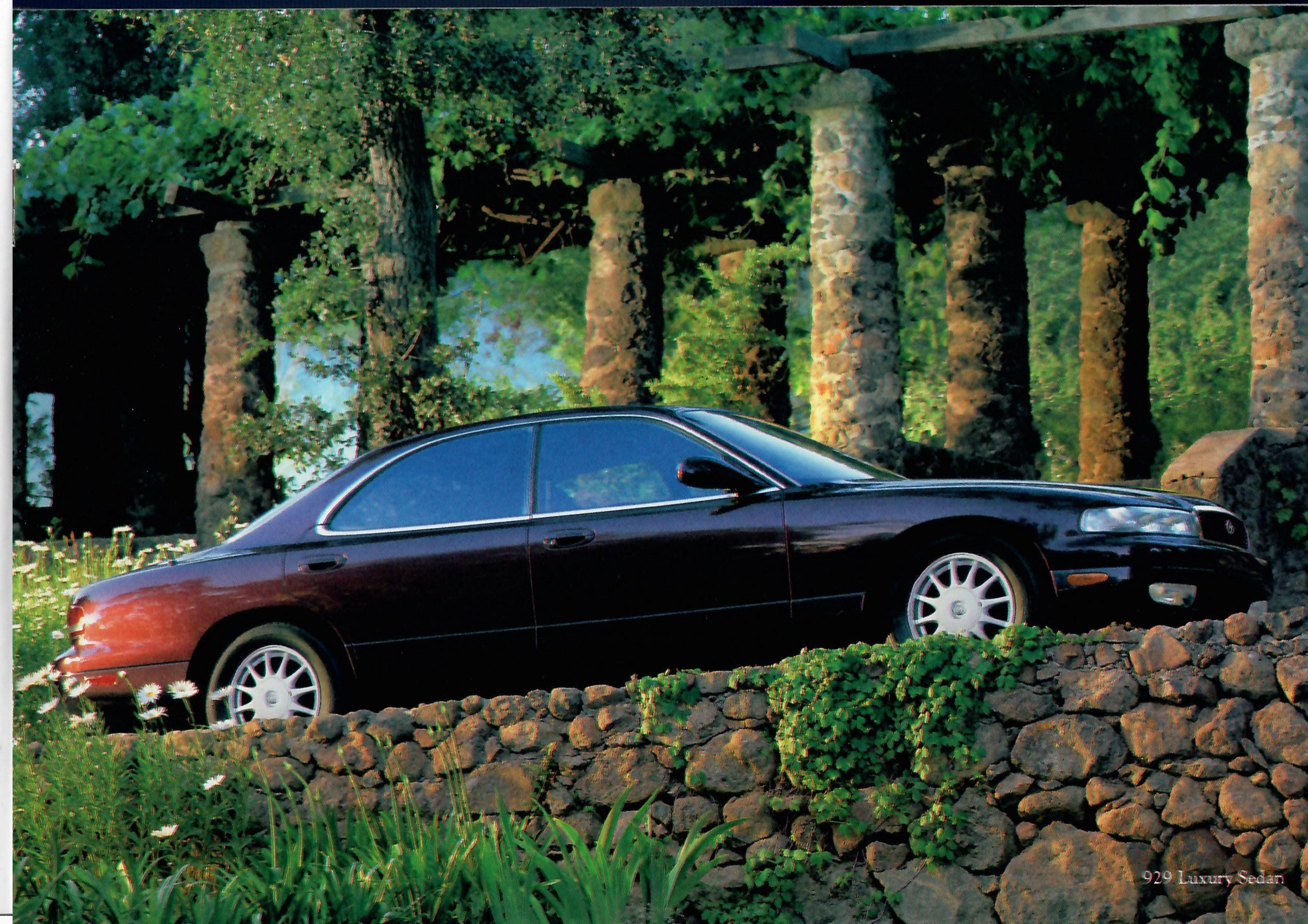
929 Luxury Sedan

*Seats upholstered in leather except for back side of front seats, bottom cushion side panels, and other minor areas.