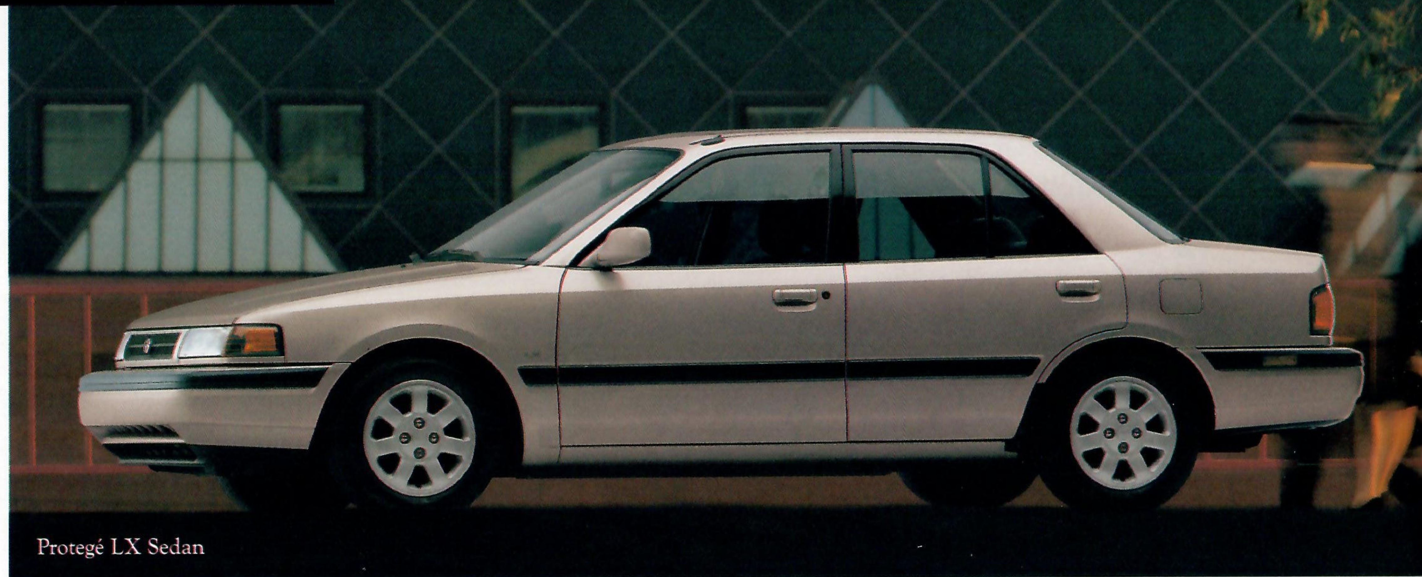
Protegé LX Sedan

"This little car has a lot of good moves and thrives on hard driving."