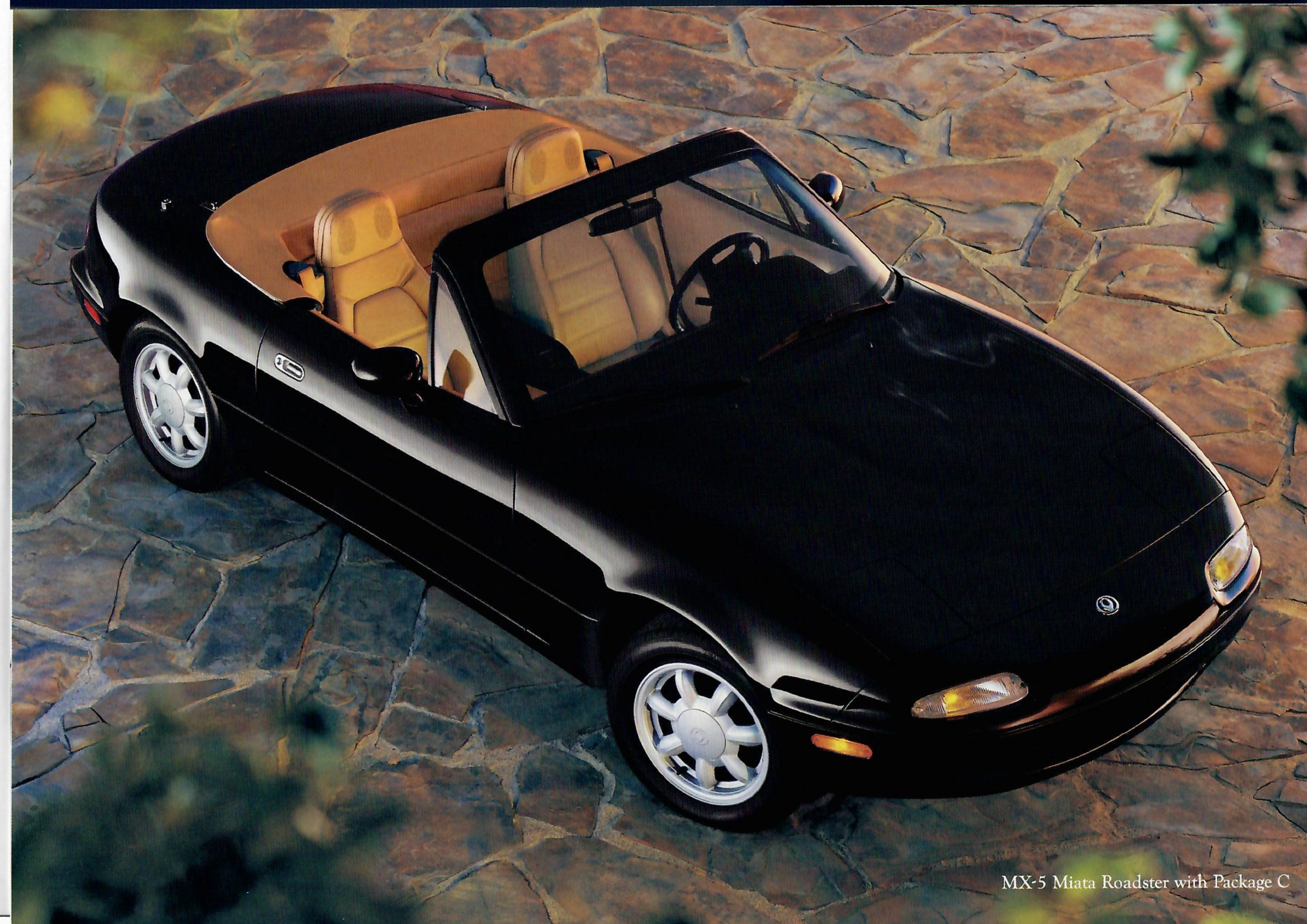
MX-5 Miata Roadster with Package C

**Seats upholstered in leather except for vinyl on rear side of seatbacks and other minor areas.