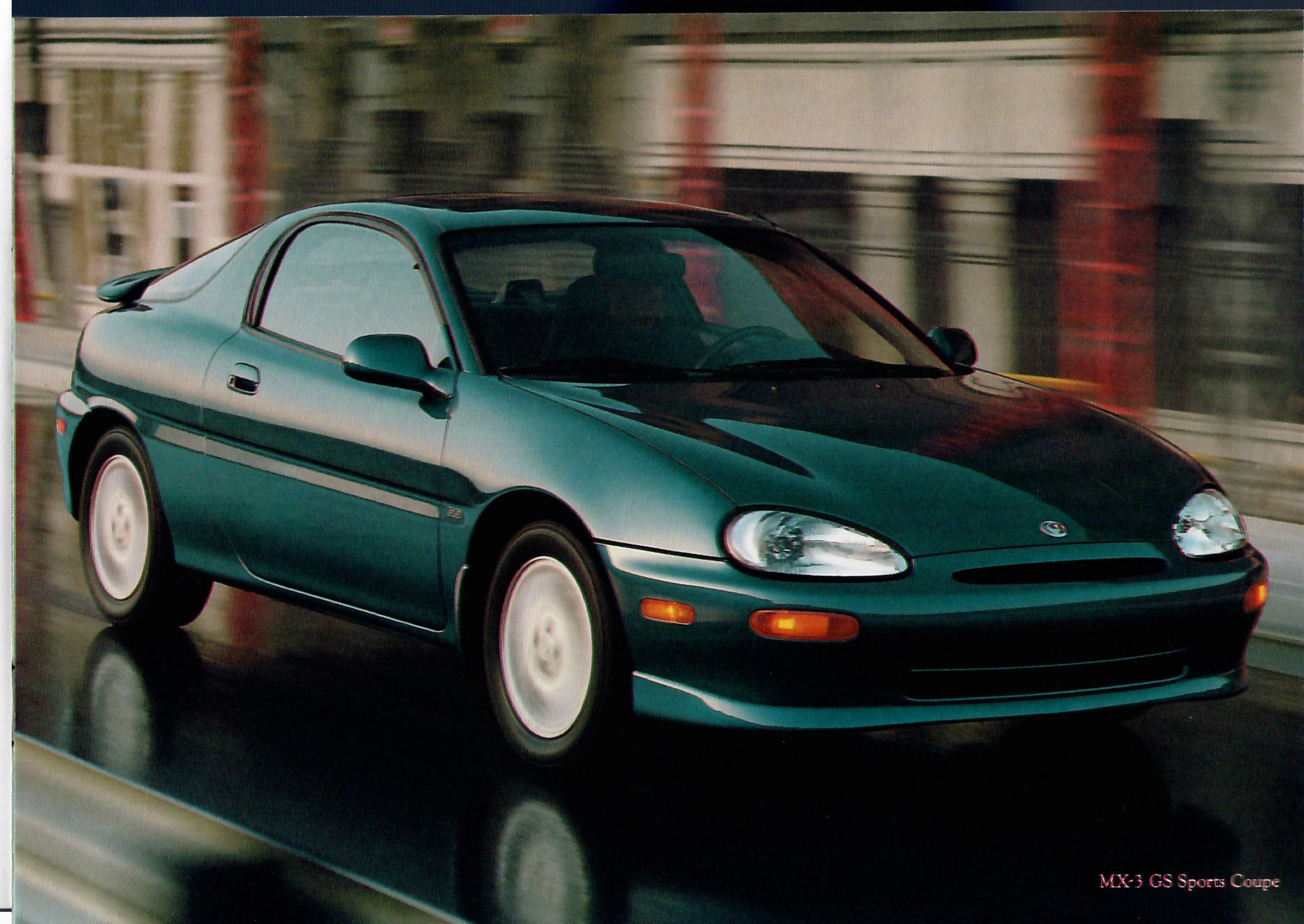
MX-3 GS Sports Coupe