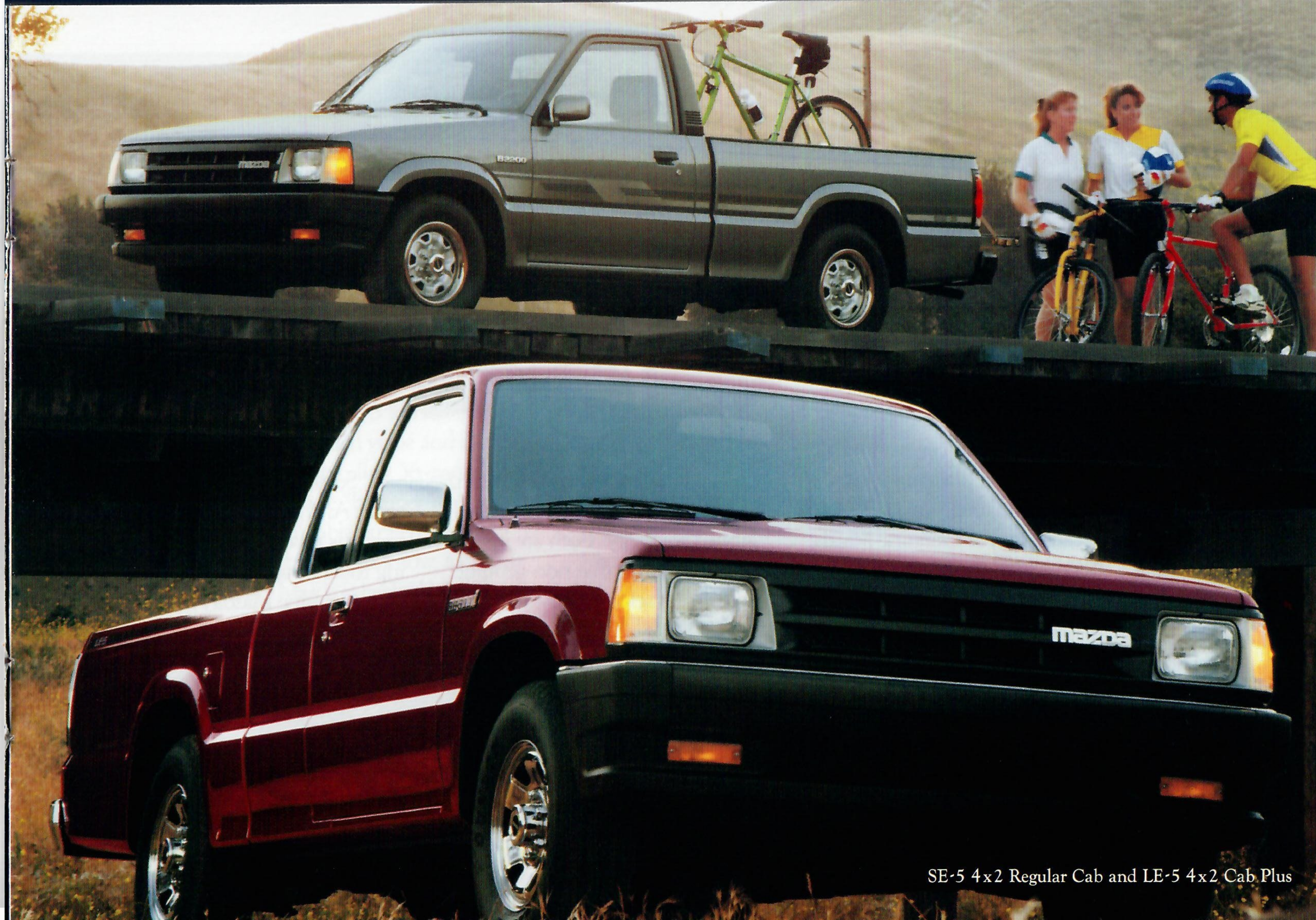
SE-5 4x2 Regular Cab and LE-5 4x2 Cab Plus