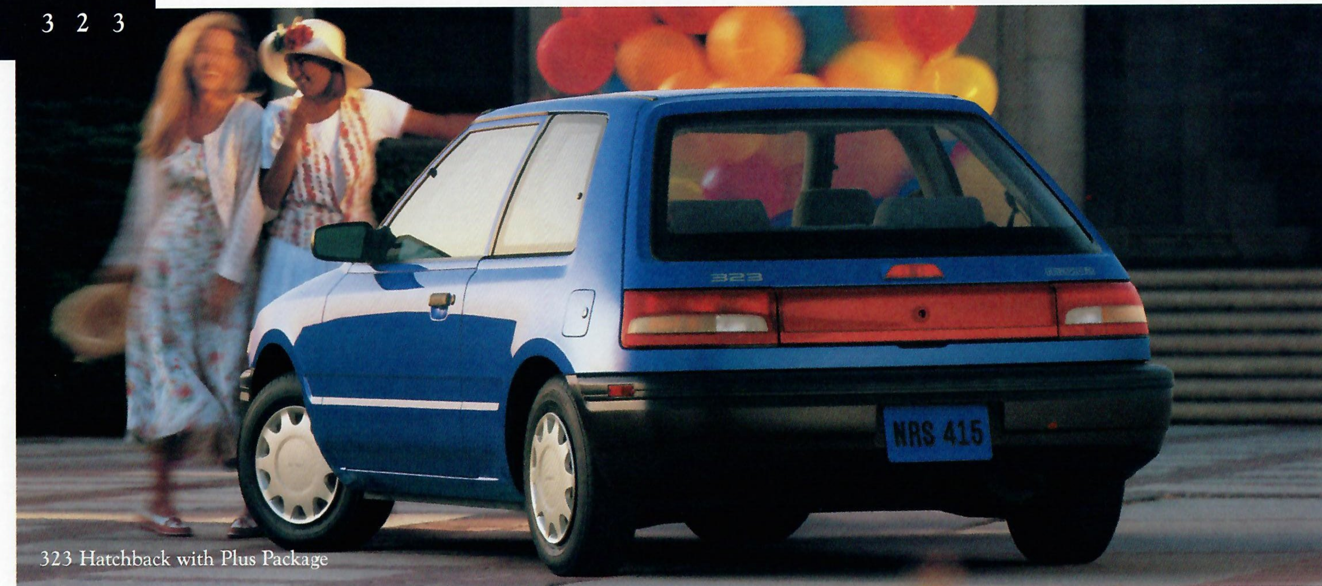
323 Hatchback with Plus Package

"It's hard to beat the 323 in terms of pure per-dollar value."