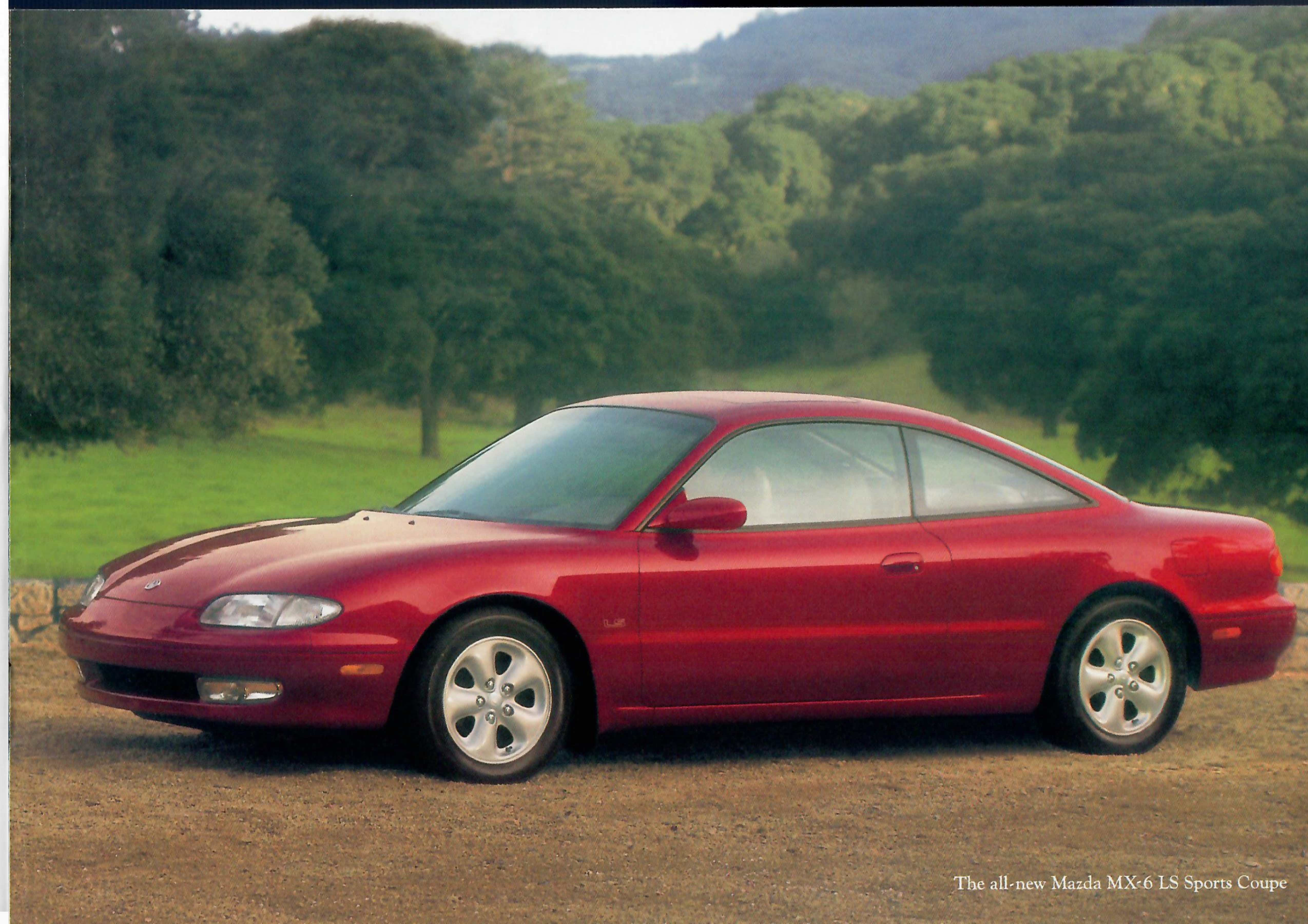
The all-new Mazda MX-6 LS Sports Coupe

*Seating surfaces upholstered in leather except for seat side panels, rear sides of seatbacks, and other minor areas.