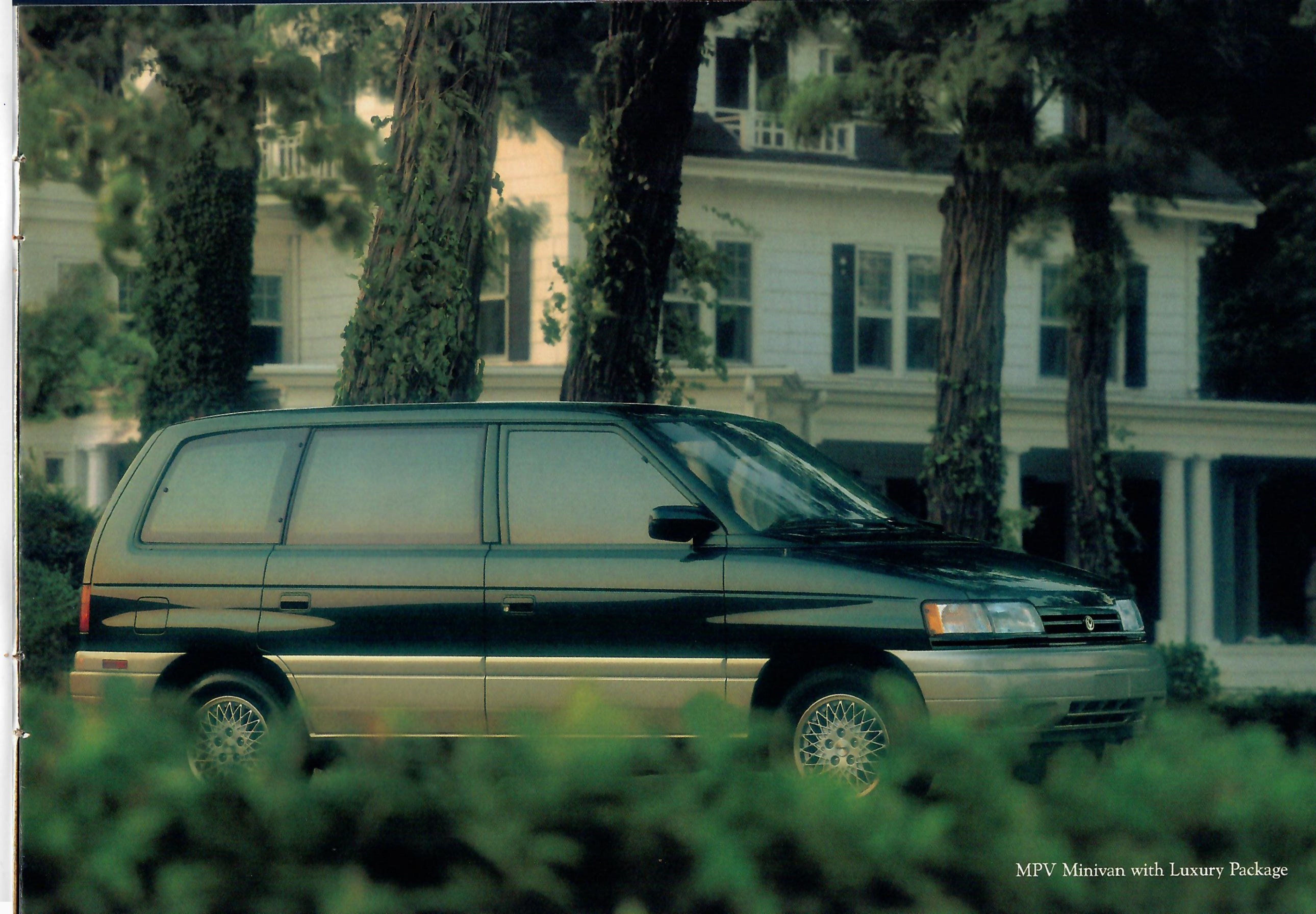
MPV Minivan with Luxury Package

**Seats upholstered in leather except for vinyl on rear side of seatbacks and other minor areas.