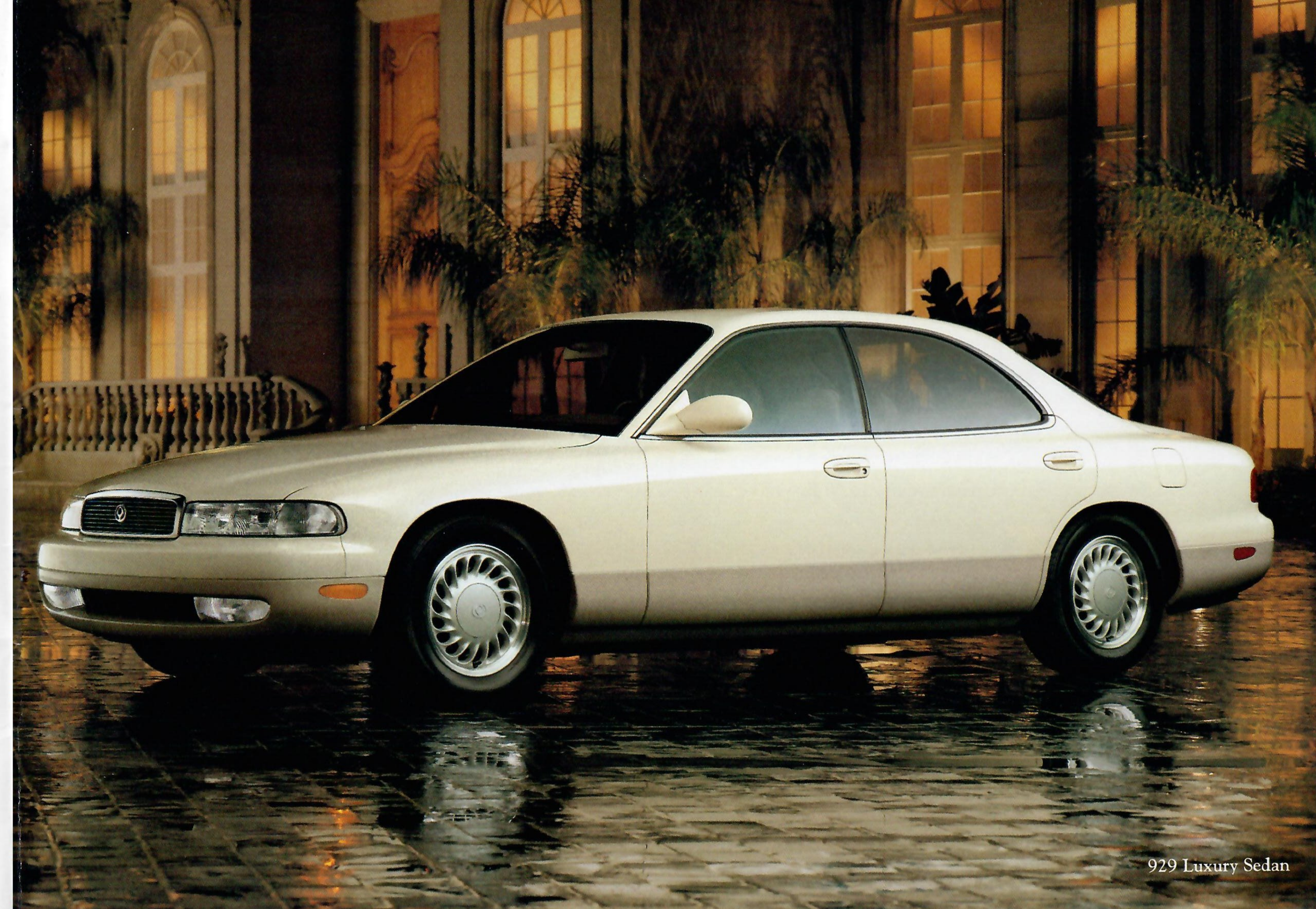
929 Luxury Sedan