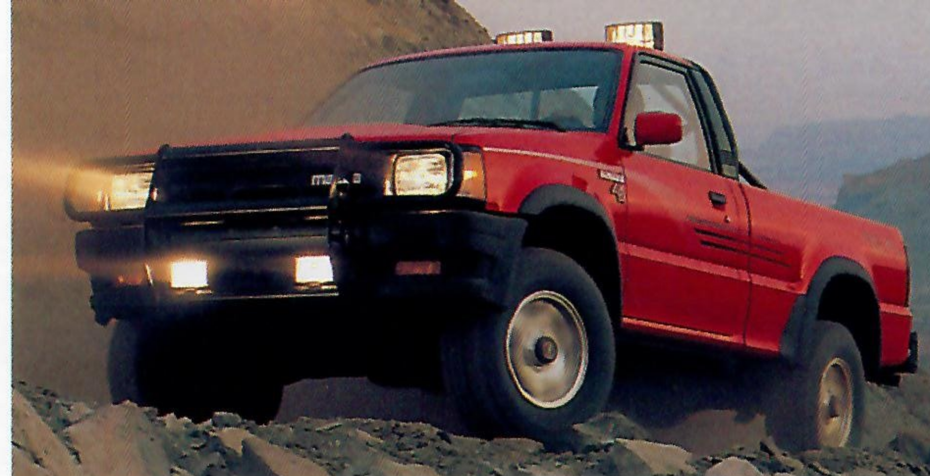
Light bar and attached lights are not Mazda accessories.