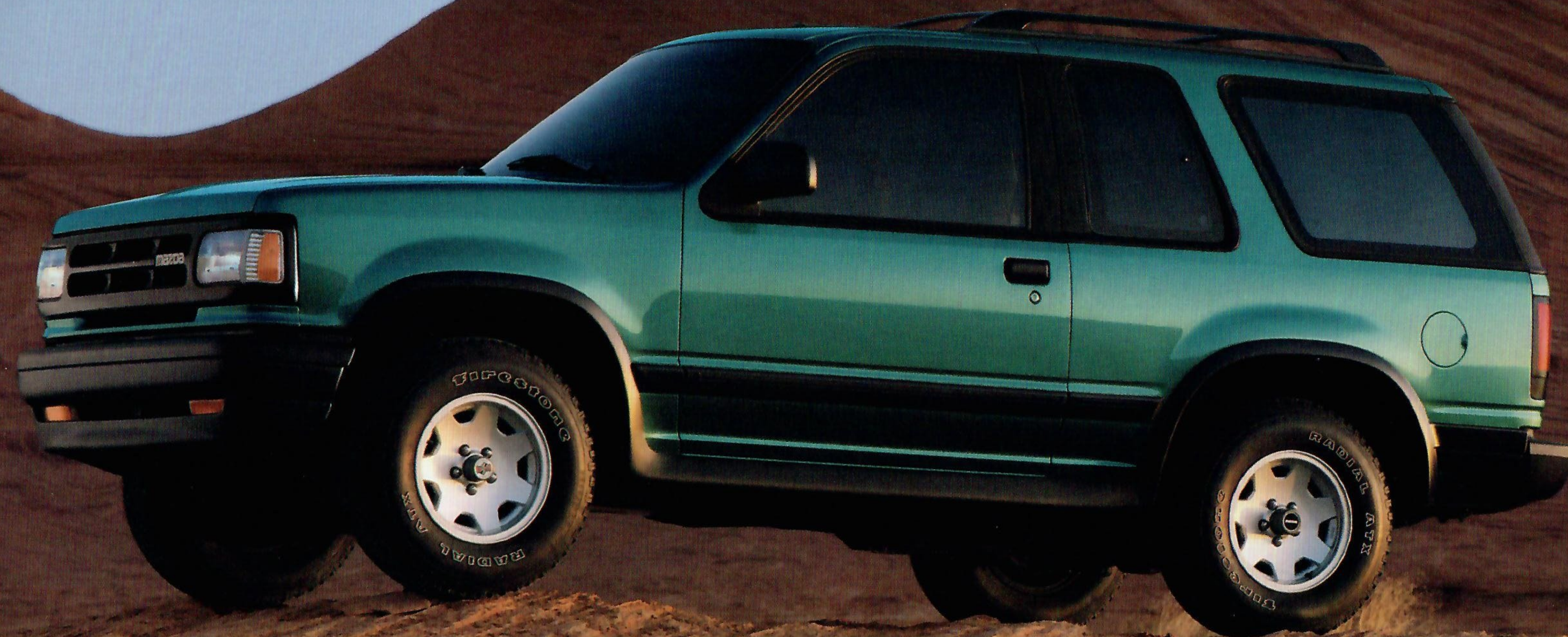
Navajo LX 4x4 Sport Utility

*Seating surfaces upholstered in leather. Seat side panels, rear sides of seatbacks, and other minor areas covered in vinyl.