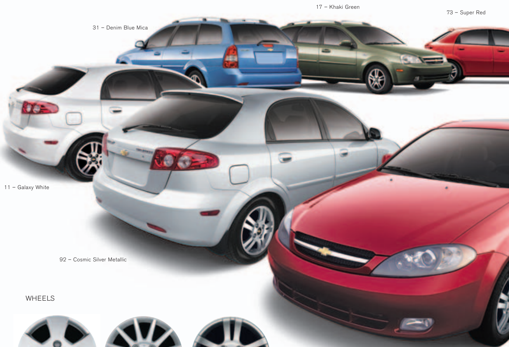
11 – Galaxy White