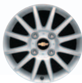
B – 15" multi-spoke aluminum wheel