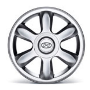
15-INCH GLS ALLOY WHEEL