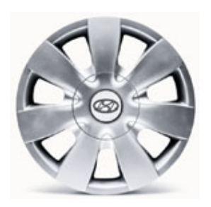
14-INCH GS WHEEL COVER