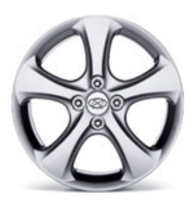
16-INCH SE ALLOY WHEEL