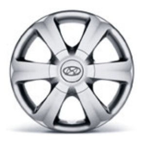
14-INCH GLS WHEEL COVER