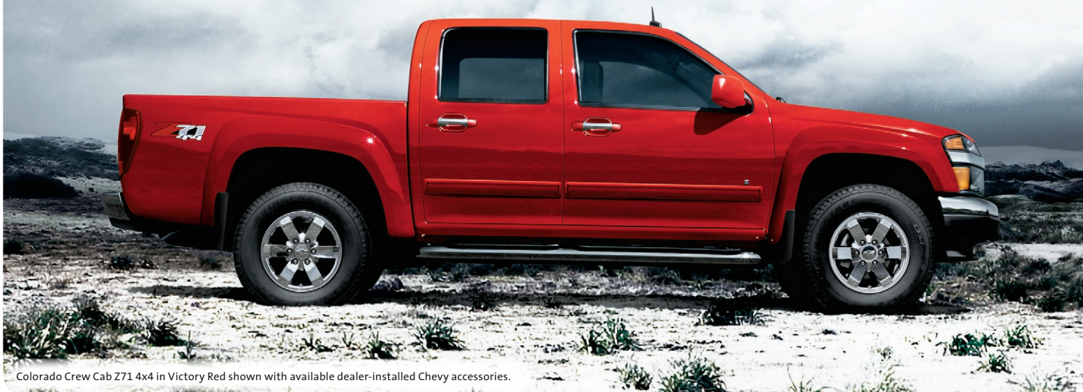
Colorado Crew Cab Z71 4x4 in Victory Red shown with available dealer-installed Chevy accessories.

Whether it's a day's work or a weekend of roughing it, Chevy Colorado is up to the challenge with reliability and strength that delivers on a dollar. Just check out these truck credentials. The available 5.3L V8 engine pumps out 300 horsepower and has better fuel economy than Dodge Dakota V8. 1 Colorado also makes your money work hard with a strong lineup of standard features: StabiliTrak Electronic Stability Control (including Traction Control), head-curtain side-impact air bags, 2 air conditioning, cruise control, Daytime Running Lamps, and a bedliner. Chevy Colorado is designed to fit your wallet, garage and life — without backing down.