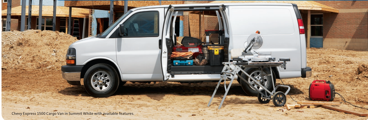
Chevy Express 1500 Cargo Van in Summit White with available features.

Chevy Express Cargo Van and Commercial Cutaway models bring dedication and strength to any job. Powerful engines. Available All-Wheel-Drive (AWD) on 1500 models. Regular and extended wheelbase lengths on 2500 and 3500 models. 4500 Commercial Cutaway offers better available payload 1 than any competitor and 14,200-lb. standard GVWR 2 . All models are backed by the Chevy 100,000 mile/5-year 3 transferable Powertrain Limited Warranty plus Roadside Assistance and Courtesy Transportation Programs.