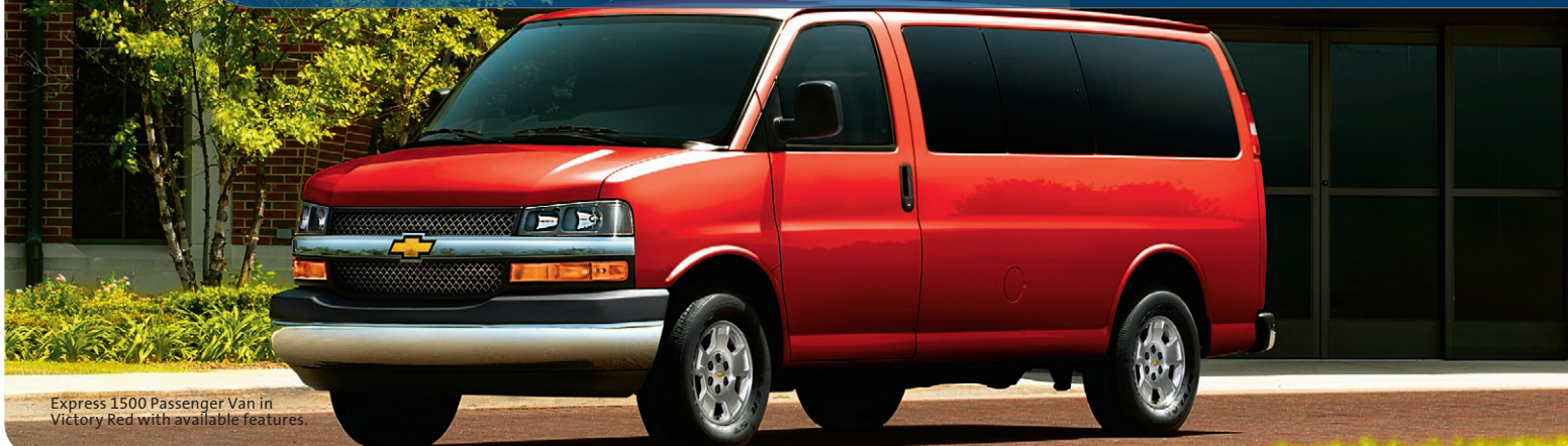
Express 1500 Passenger Van in Victory Red with available features.

Chevy Express Passenger Van offers space and flexibility with 8-, 12- and 15-passenger seating configurations. Standard safety features include head-curtain side-impact air bags 1 and the StabiliTrak Electronic Stability Control System. The engine lineup includes the Vortec 5.3L V8 and Vortec 6.0L V8, which are both FlexFuel-capable 2 for 2010. A six-speed automatic transmission is standard on 2500 and 3500 models. Backed by the Chevy 100,000 mile/5-year 3 transferable Powertrain Limited Warranty plus Roadside Assistance and Courtesy Transportation Programs. That's the best coverage in America.