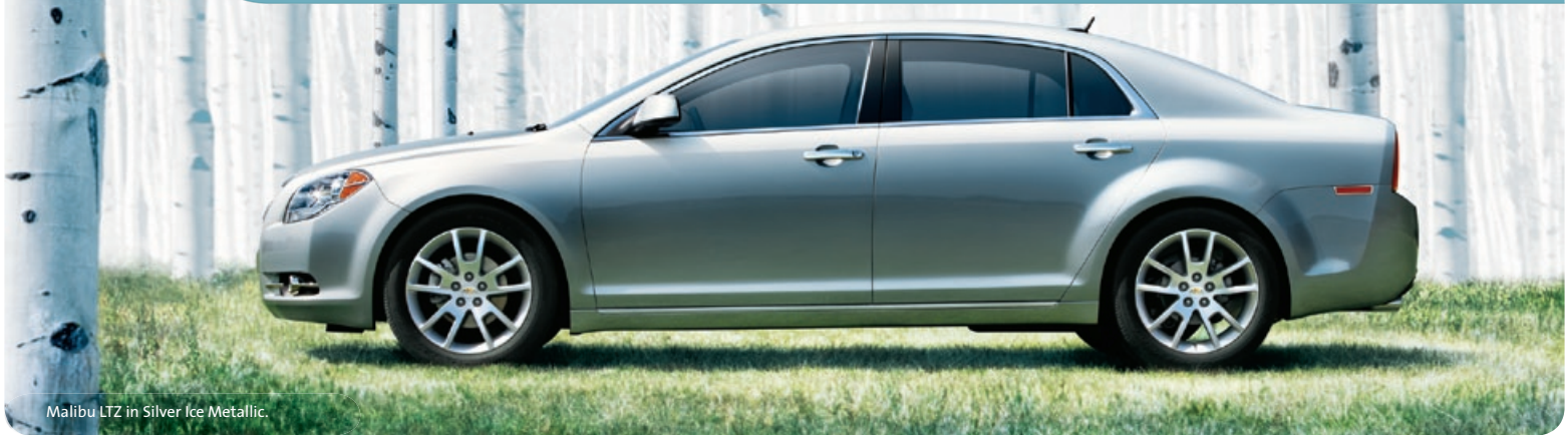
Malibu LTZ in Silver Ice Metallic.

Heralded by critics and owners alike — with more than 30 awards to its credit — Chevy Malibu continues to command attention and acclaim. Malibu has been named a Consumers Digest BEST BUY two years in a row. And it was named a 2009 BEST NEW FAMILY VEHICLE by Kelley Blue Book's kbb.com . 1 A beautifully crafted car with a precision build and meticulous attention to detail, Malibu is also fuel-efficient, offering an EPA estimated 33 MPG highway. 2 “Just drive one, and you’ll see why we’ve named it an AUTOMOBILE Magazine All-Star for two years in a row...” — AUTOMOBILE Magazine , February 2009