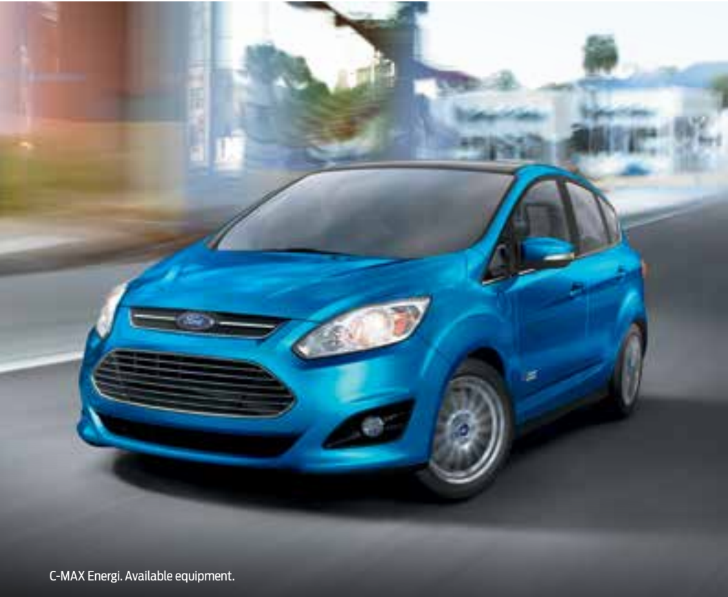
C-MAX Energi. Available equipment.