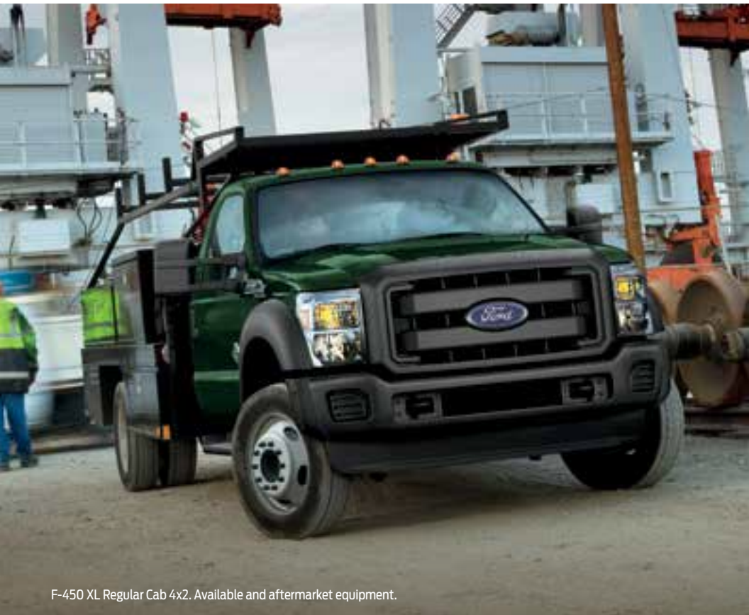
F-450 XL Regular Cab 4x2. Available and aftermarket equipment.