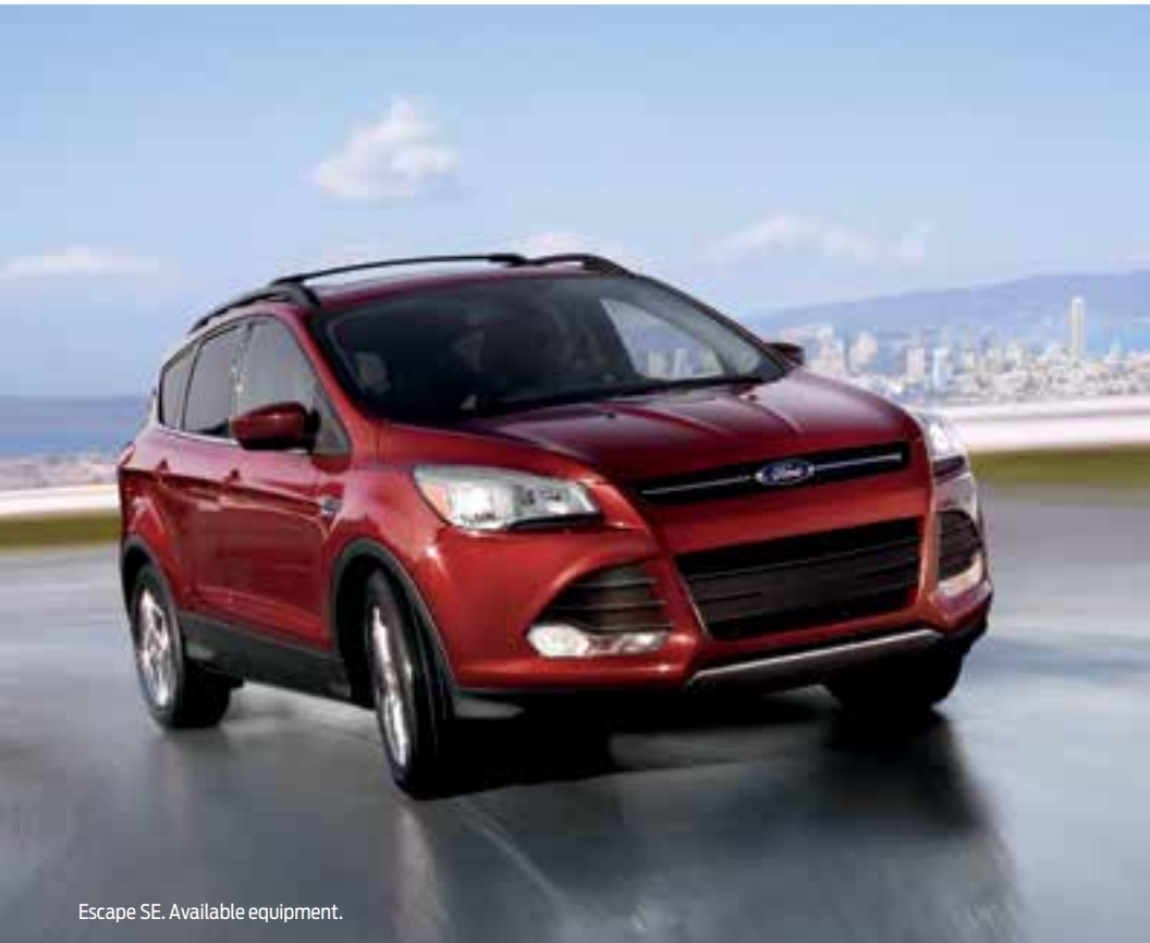
Escape SE. Available equipment.