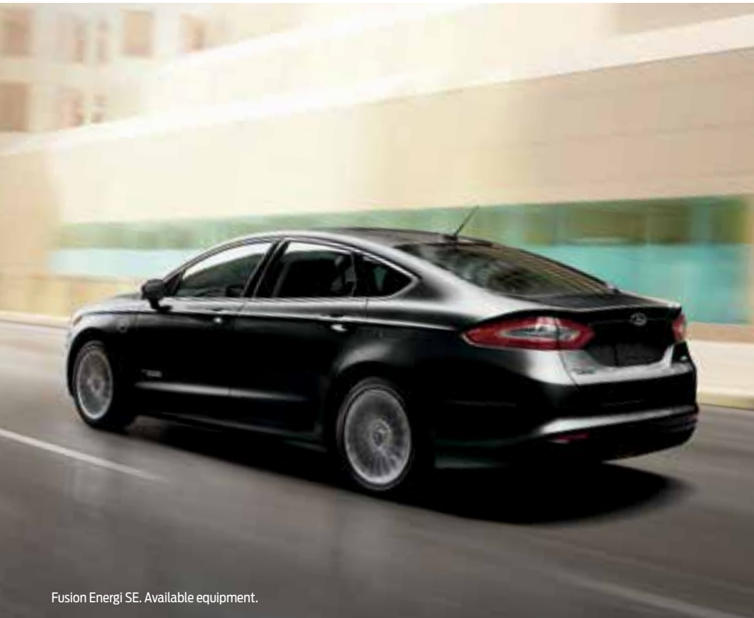
Fusion Energi SE. Available equipment.