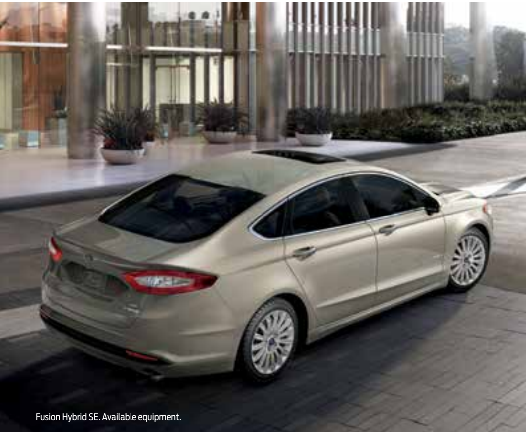
Fusion Hybrid SE. Available equipment.