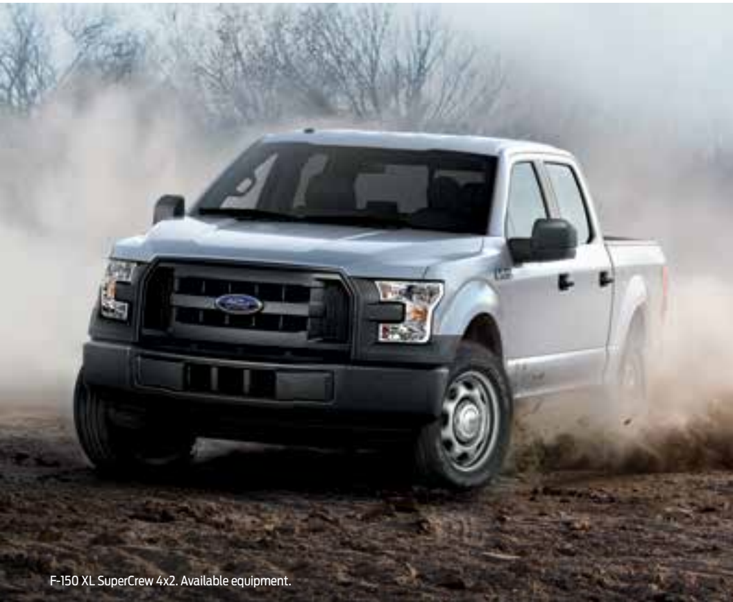
F-150 XL SuperCrew 4x2. Available equipment.