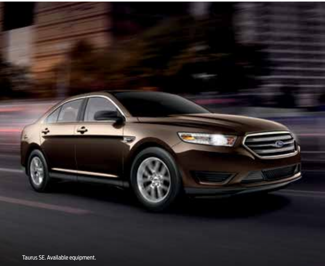
Taurus SE. Available equipment.