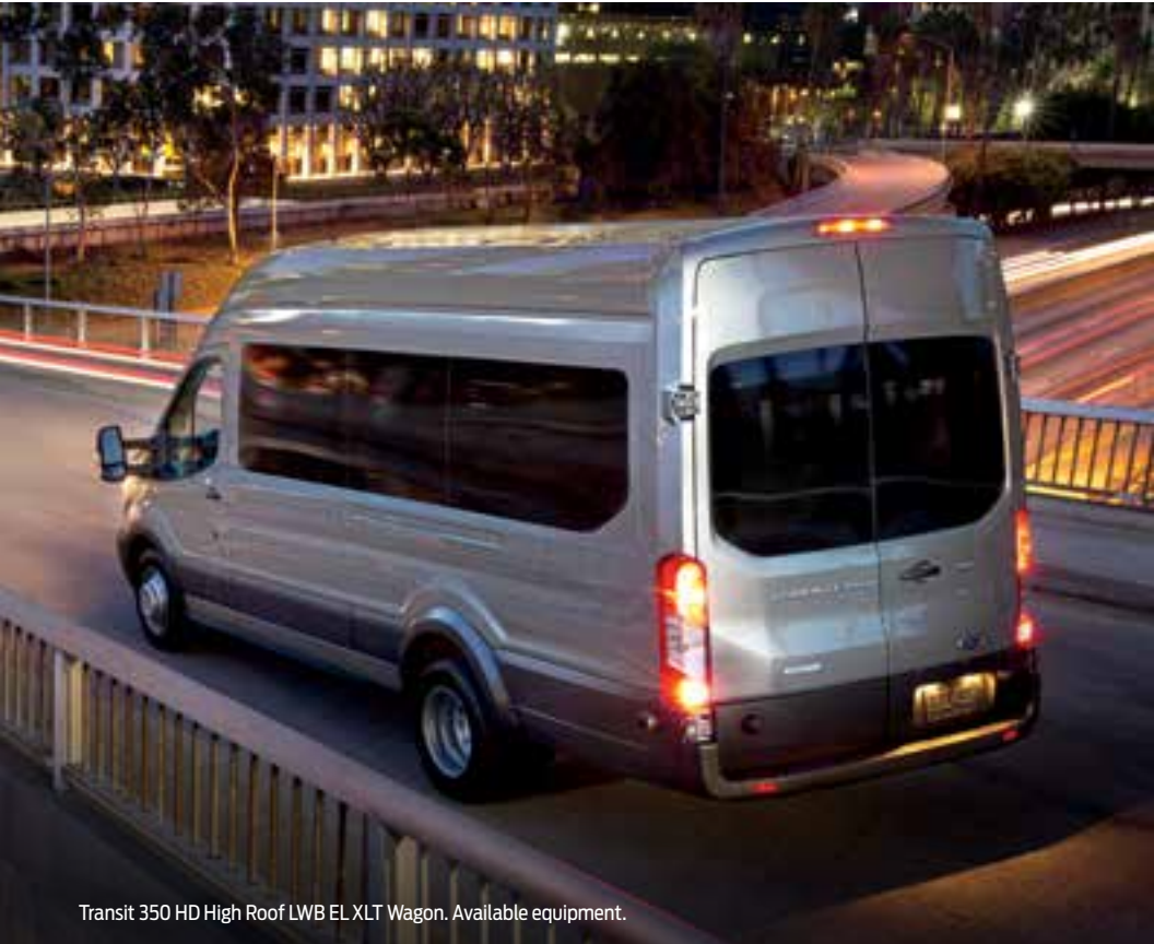
Transit 350 HD High Roof LWB EL XLT Wagon. Available equipment.