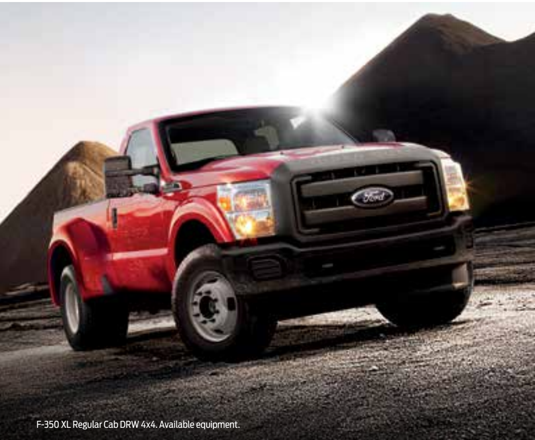
F-350 XL Regular Cab DRW 4x4. Available equipment.