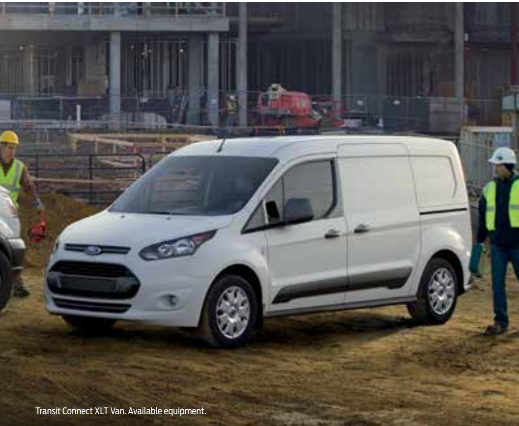
Transit Connect XLT Van. Available equipment.