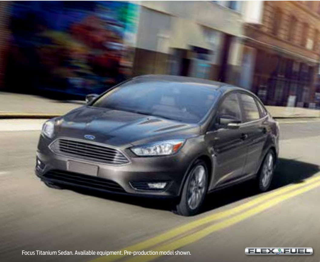
Focus Titanium Sedan. Available equipment. Pre-production model shown.