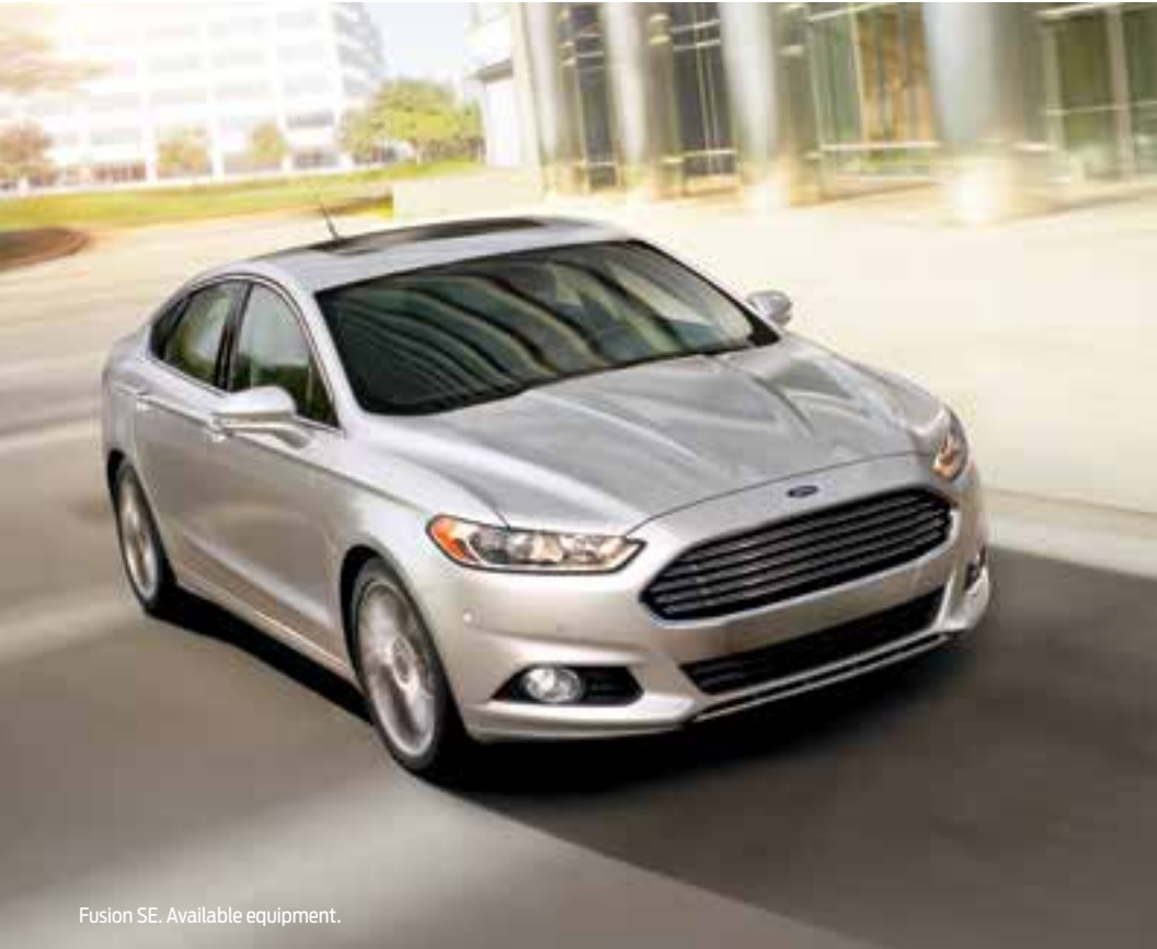
Fusion SE. Available equipment.