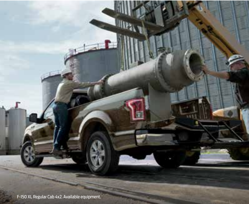
F-150 XL Regular Cab 4x2. Available equipment.