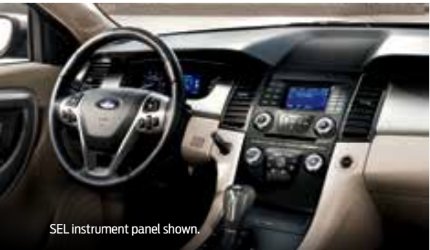
SEL instrument panel shown.