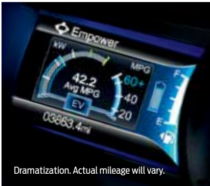
Dramatization. Actual mileage will vary.

EcoCloth seats with REPREVE® fabric. Contain the equivalent of nearly 40 recycled 16-oz. plastic bottles. Not available on Sonata Hybrid, Camry Hybrid.