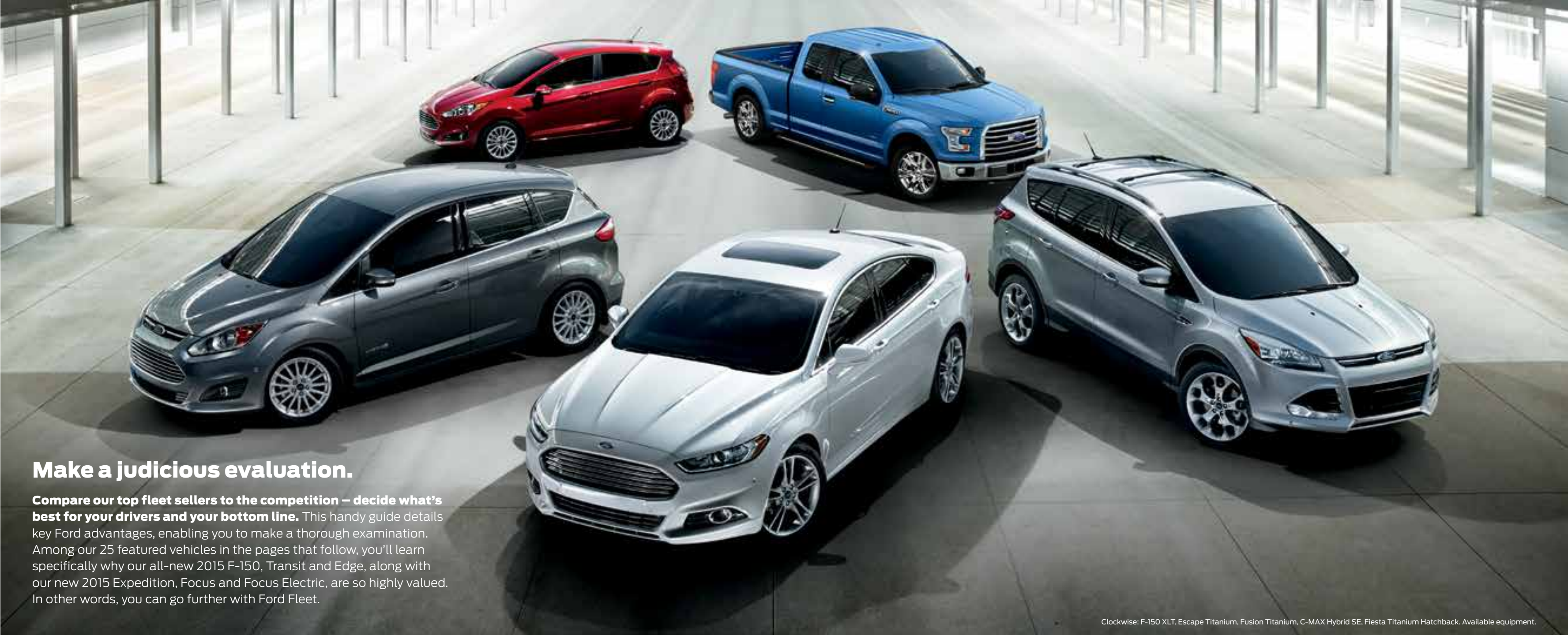
Clockwise: F-150 XLT, Escape Titanium, Fusion Titanium, C-MAX Hybrid SE, Fiesta Titanium Hatchback. Available equipment.

Compare our top fleet sellers to the competition – decide what’s best for your drivers and your bottom line. This handy guide details key Ford advantages, enabling you to make a thorough examination. Among our 25 featured vehicles in the pages that follow, you’ll learn specifically why our all-new 2015 F-150, Transit and Edge, along with our new 2015 Expedition, Focus and Focus Electric, are so highly valued. In other words, you can go further with Ford Fleet.