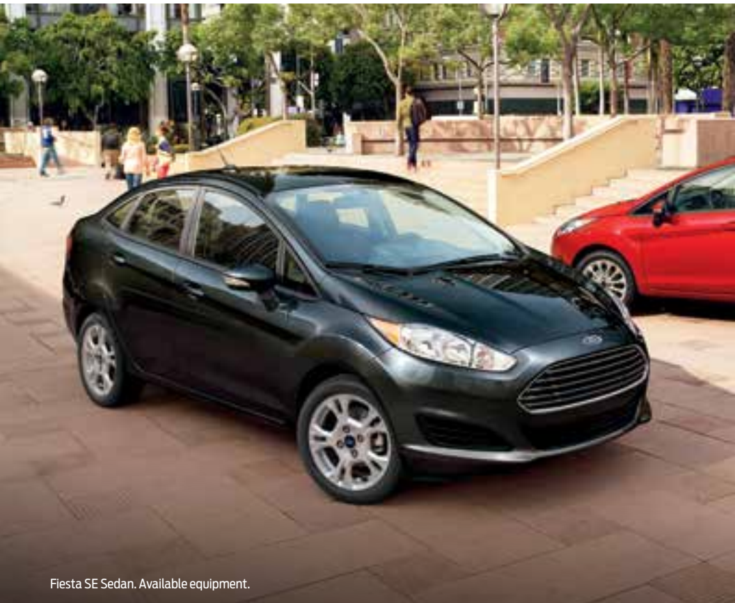
Fiesta SE Sedan. Available equipment.