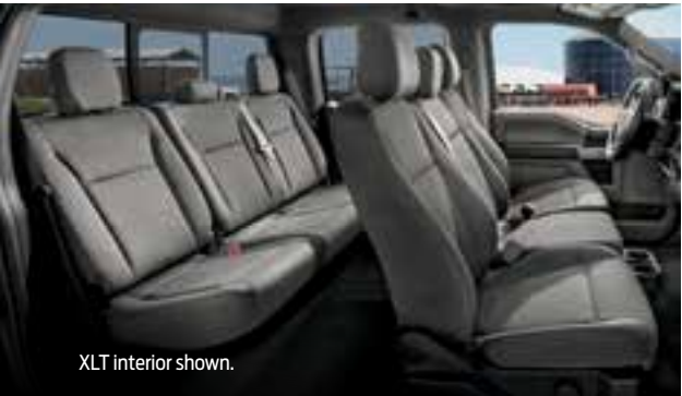
XLT interior shown.