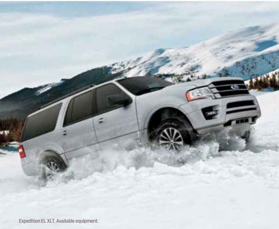
Expedition EL XLT. Available equipment.