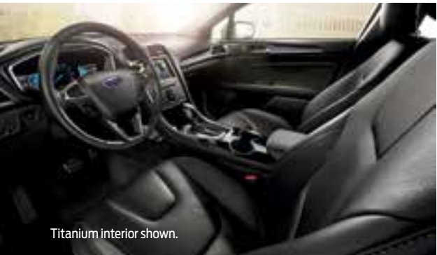
Titanium interior shown.