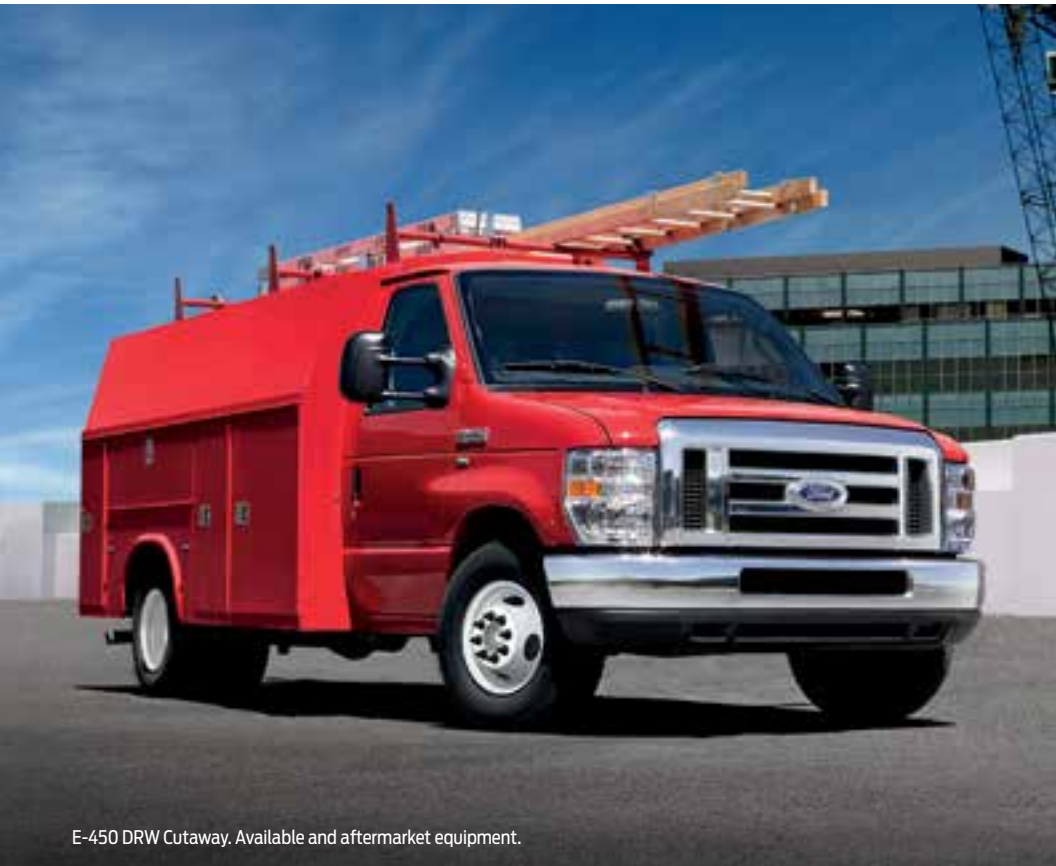
E-450 DRW Cutaway. Available and aftermarket equipment.