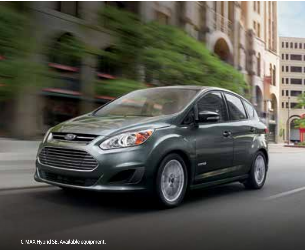
C-MAX Hybrid SE. Available equipment.