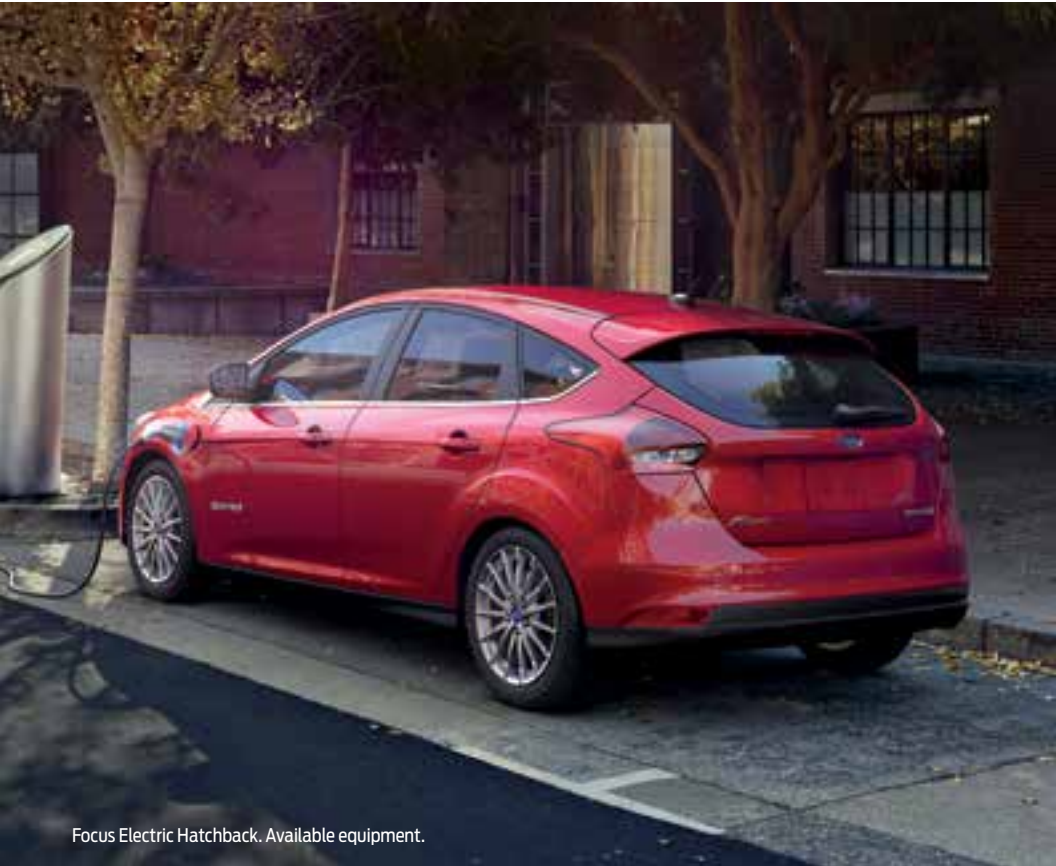
Focus Electric Hatchback. Available equipment.