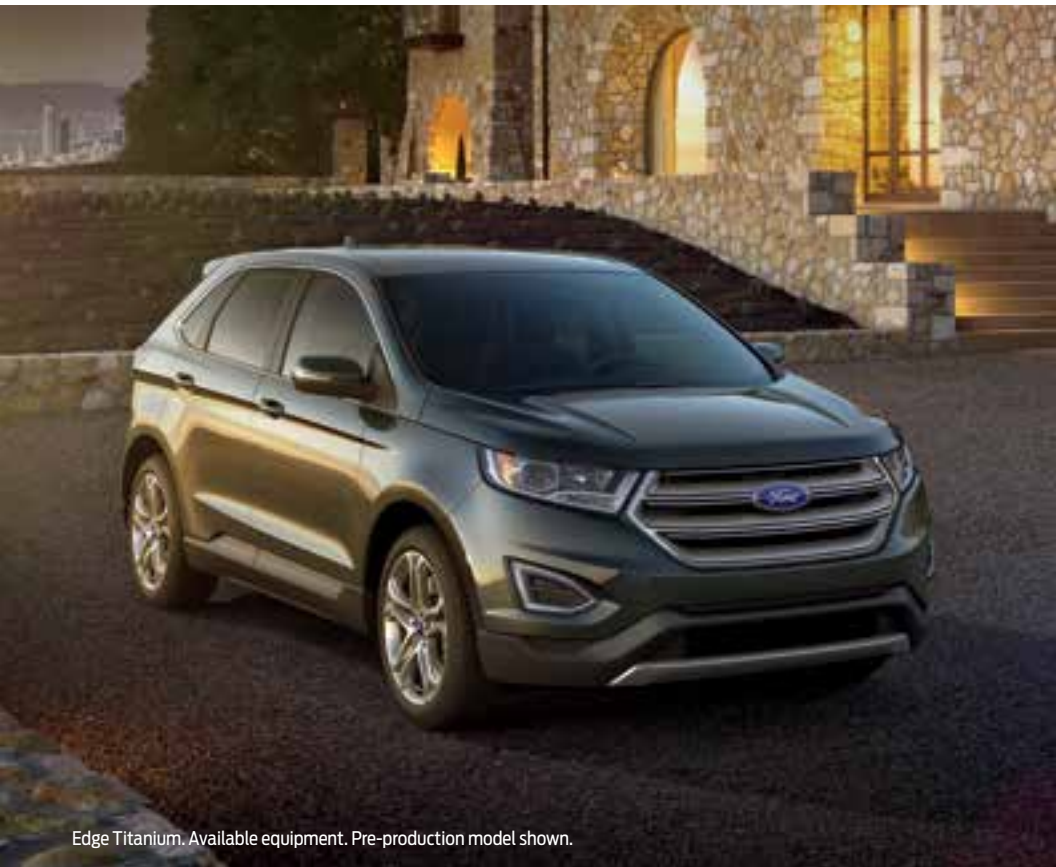
Edge Titanium. Available equipment. Pre-production model shown.