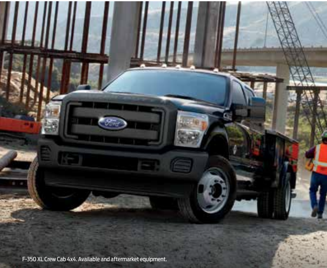
F-350 XL Crew Cab 4x4. Available and aftermarket equipment.