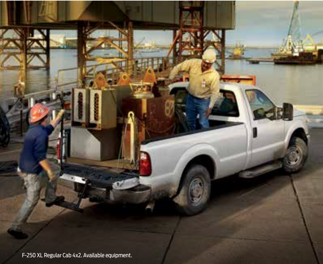
F-250 XL Regular Cab 4x2. Available equipment.