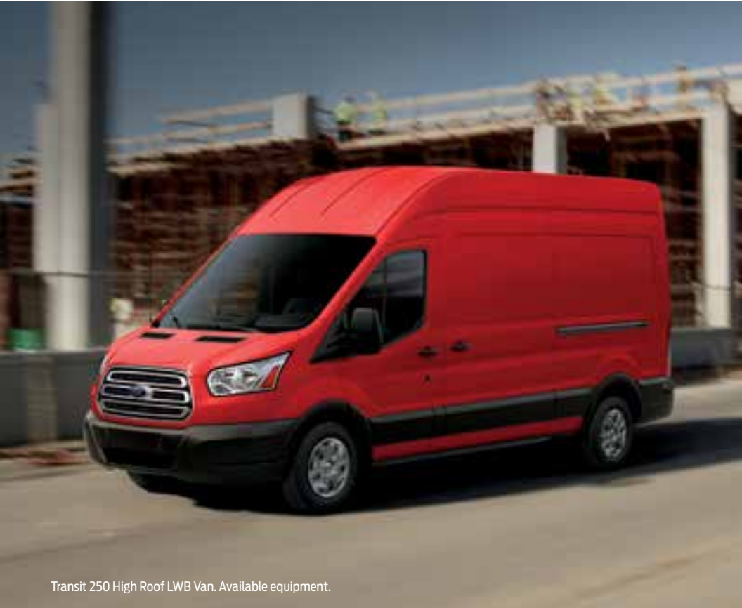
Transit 250 High Roof LWB Van. Available equipment.