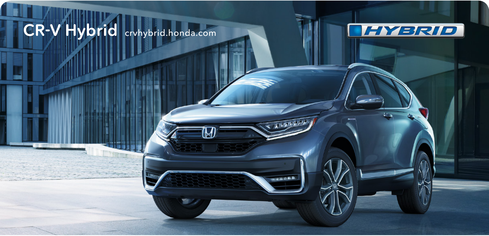
CR-V Hybrid crvhybrid.honda.com

*Available features. Please visit automobiles.honda.com/cr-v#specifications for actual trim application.