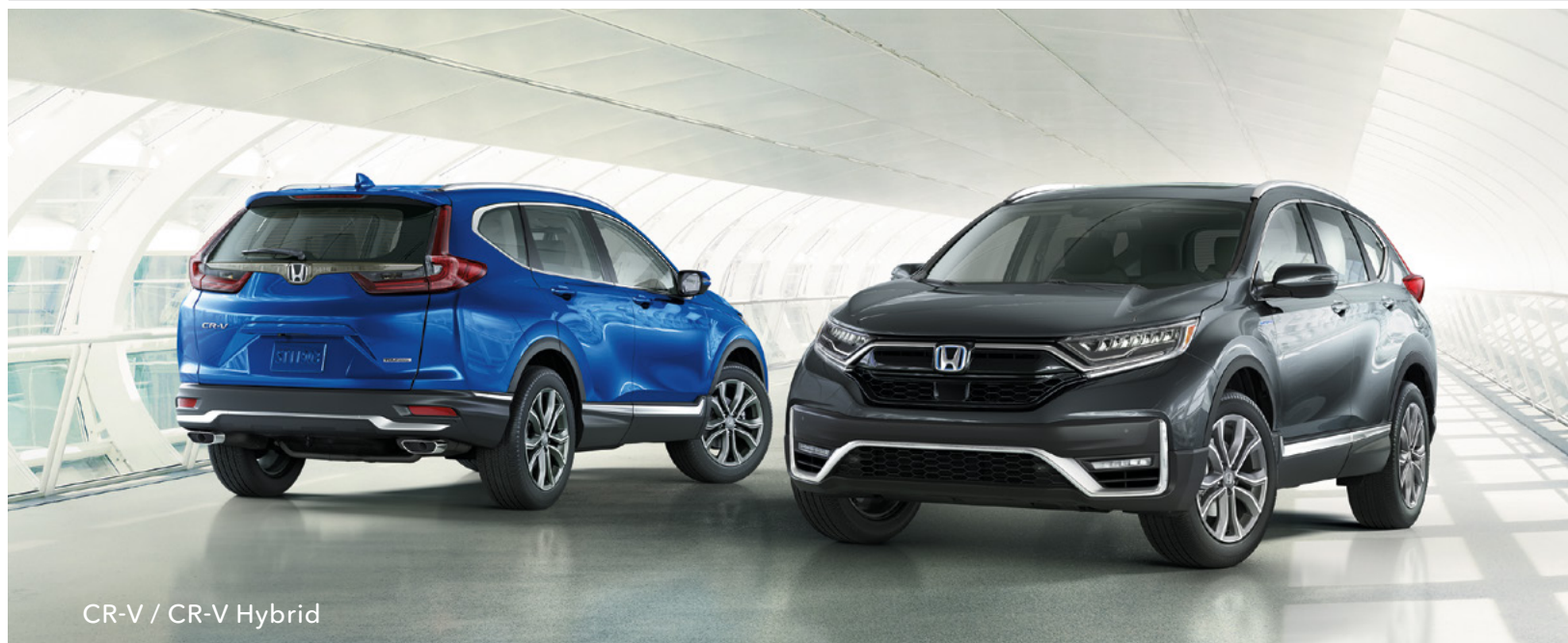
CR-V / CR-V Hybrid