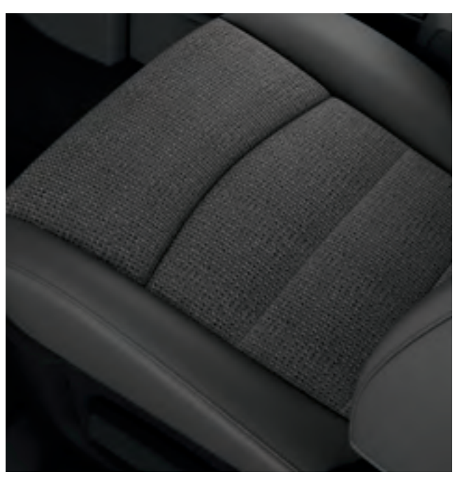
Sedoso/Carbide Cloth Diesel Gray Tradesman, Express and Warlock

Sedoso/Alloy Cloth Black Tradesman, Express and Warlock