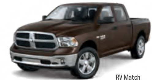
Walnut Brown Metallic Not available on Express