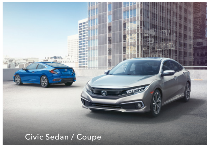
Civic Sedan / Coupe