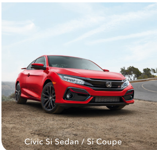
Civic Si Sedan / Si Coupe