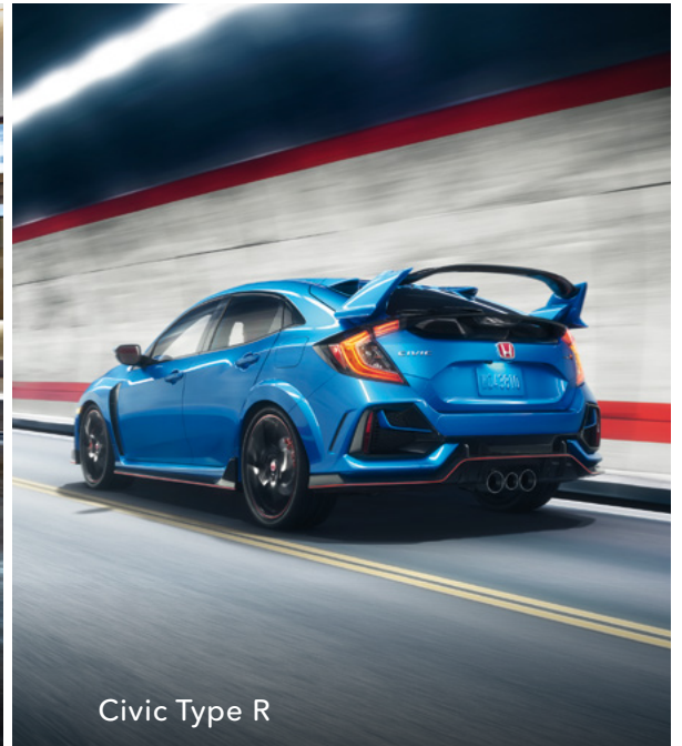
Civic Type R