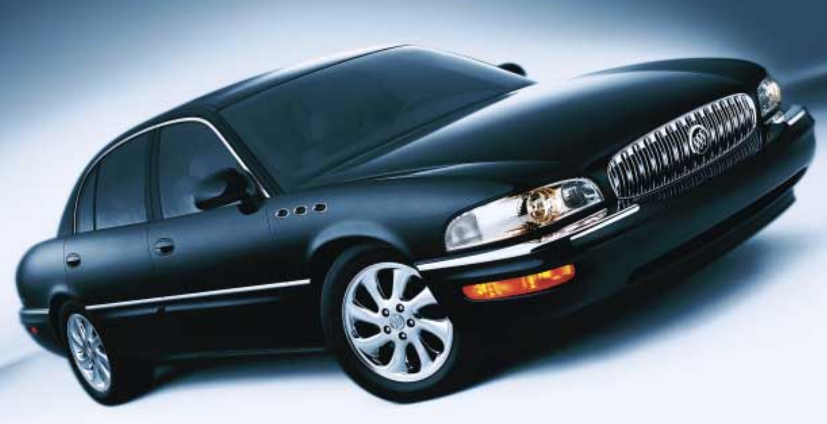
Park Avenue Ultra shown in Black with optional equipment.