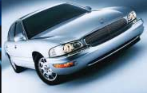
Park Avenue in Sterling Silver Metallic with optional equipment.