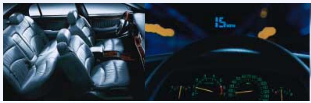
Park Avenue Ultra interior with Faux Burled Walnut Woodgrain Trim.