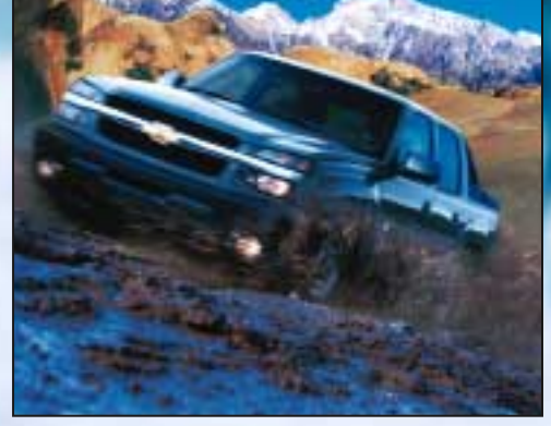
Avalanche 2500 4x4 shown in Dark Gray Metallic.

*Dependability based on longevity:1981–July 2001 full-line light-duty truck company registrations. Excludes other GM divisions.