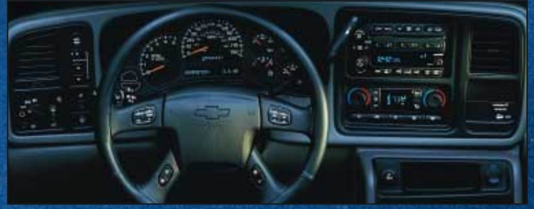
Silverado 1500 LT 4x4 Extended Cab instrument panel shown in Medium Gray with optional equipment.