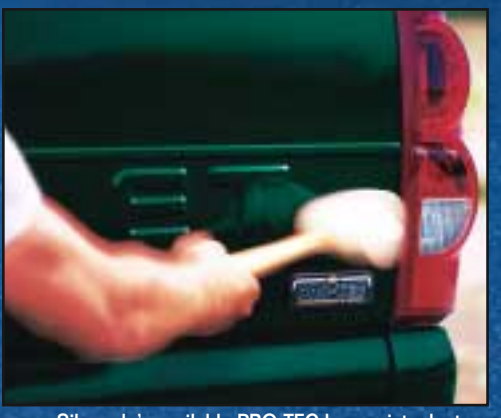
Silverado's available PRO-TEC box resists dents and dings.

Silverado 1500 LS Extended Cab Short Box with QUADRASTEER shown in Light Pewter Metallic with optional equipment.