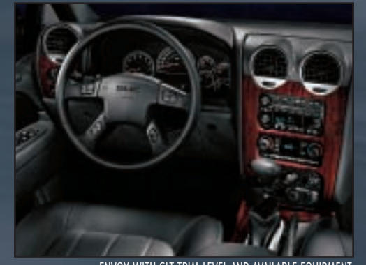
ENVOY WITH SLT TRIM LEVEL AND AVAILABLE EQUIPMENT.