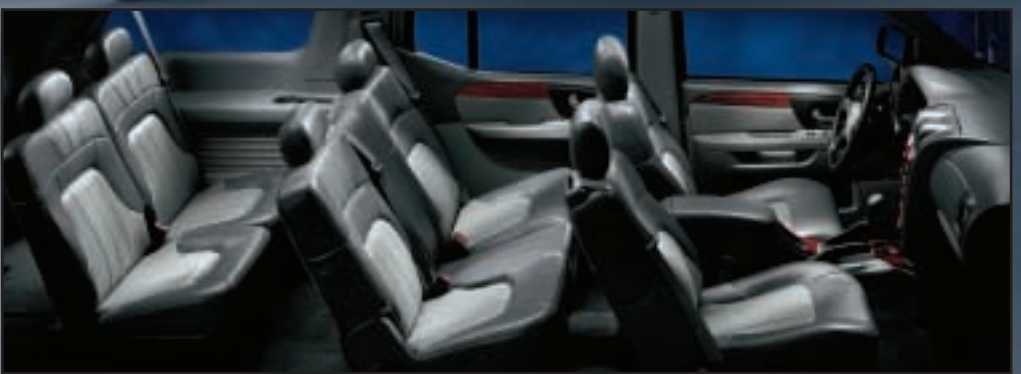
ENVOY XL WITH SLT TRIM LEVEL AND AVAILABLE EQUIPMENT.