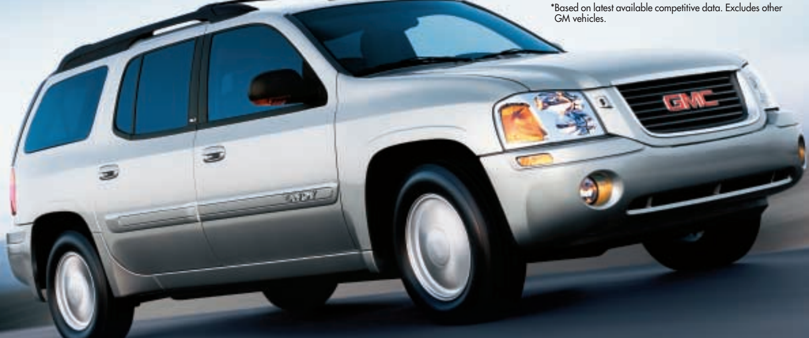
ENVOY XL SHOWN IN PEWTER METALLIC.

Envoy and Envoy XL encompass the Professional Grade qualities of a GMC® SUV with extraordinary comfort. These versatile vehicles have unsurpassed standard horsepower in their class, thanks to a 275-hp Vortec™ 4200 engine.* New for 2003, Envoy XL offers even more power with the available 290-hp Vortec 5300 V8 engine. Fully 16 inches longer than the five-passenger Envoy, XL affords third-row seating for two 6'2" adults without sacrificing legroom. 4WD models with Autotrac® help maintain traction off-road or on slippery surfaces. Nearly 100 years of imagination and experience help propel Envoy into the next generation of SUVs.