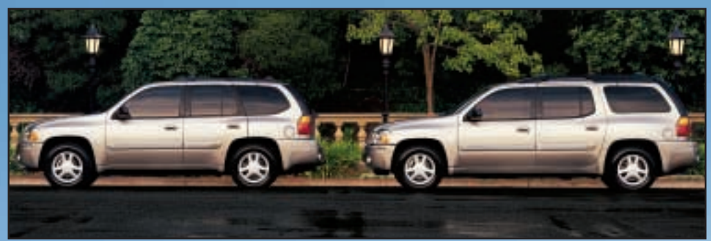
ENVOY SLT AND ENVOY XL SLT SHOWN IN PEWTER METALLIC.

Envoy and Envoy XL encompass the Professional Grade qualities of a GMC® SUV with extraordinary comfort. These versatile vehicles have unsurpassed standard horsepower in their class, thanks to a 275-hp Vortec™ 4200 engine.* New for 2003, Envoy XL offers even more power with the available 290-hp Vortec 5300 V8 engine. Fully 16 inches longer than the five-passenger Envoy, XL affords third-row seating for two 6'2" adults without sacrificing legroom. 4WD models with Autotrac® help maintain traction off-road or on slippery surfaces. Nearly 100 years of imagination and experience help propel Envoy into the next generation of SUVs.