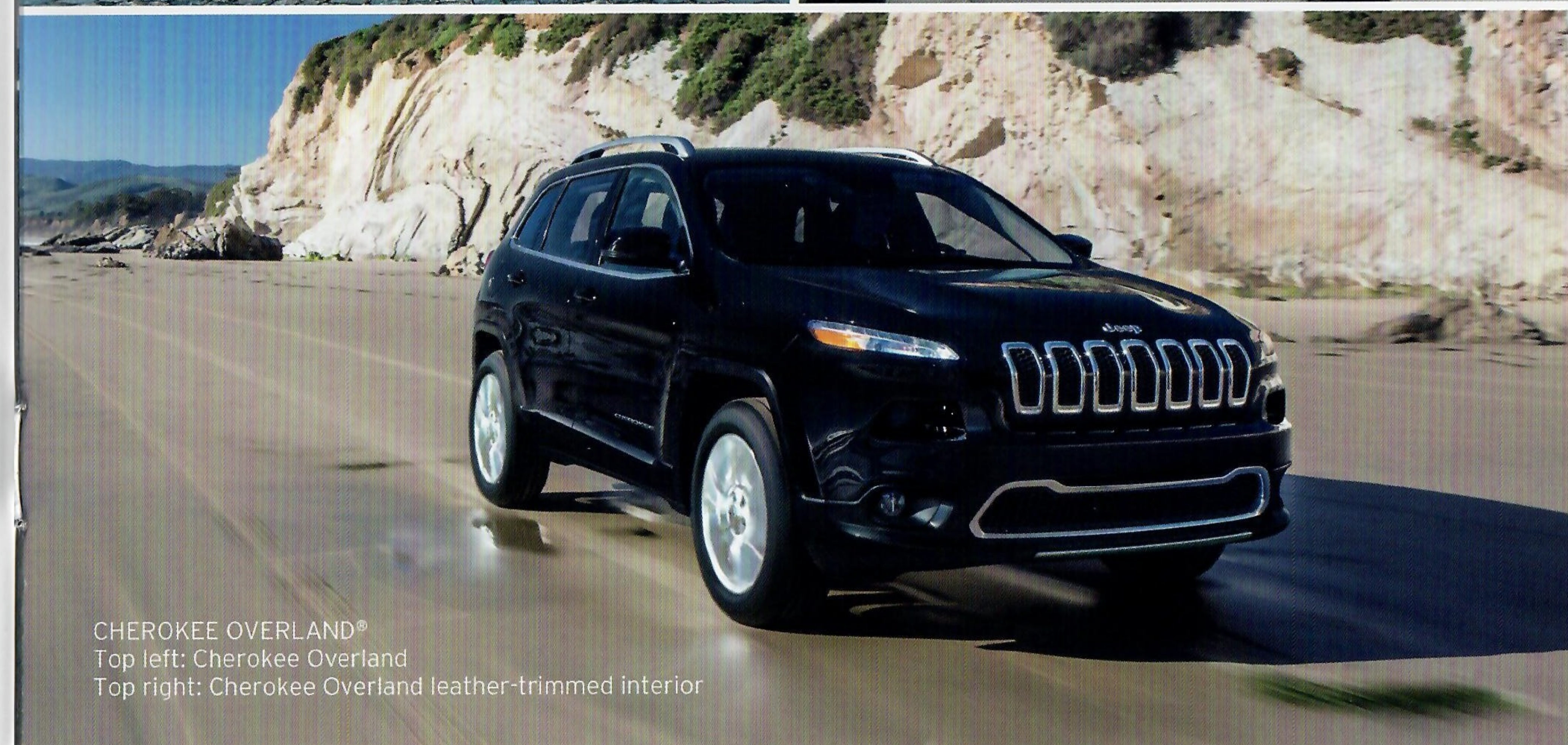
CHEROKEE OVERLAND® Top left: Cherokee Overland Top right: Cherokee Overland leather-trimmed interior