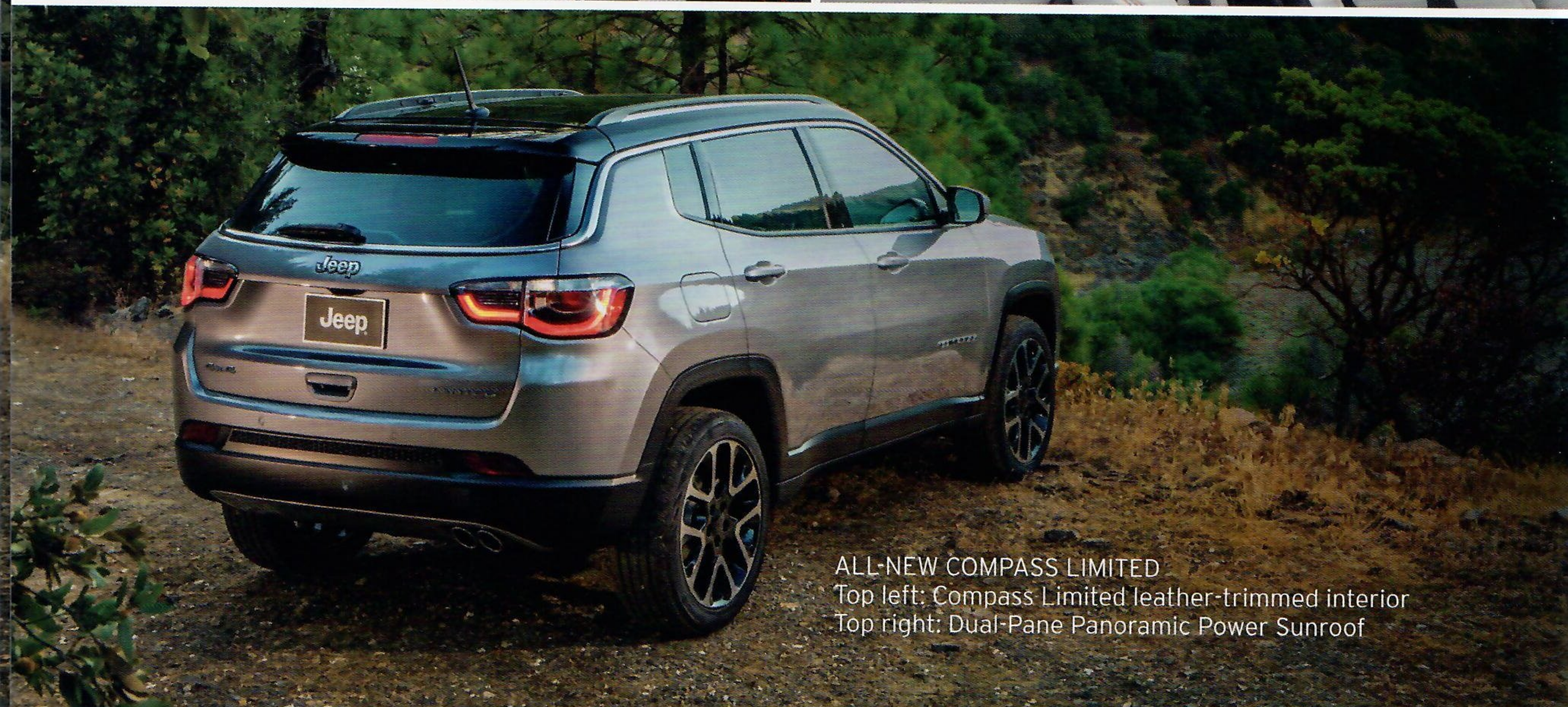
ALL-NEW COMPASS LIMITED Top left: Compass Limited leather-trimmed interior Top right: Dual-Pane Panoramic Power Sunroof