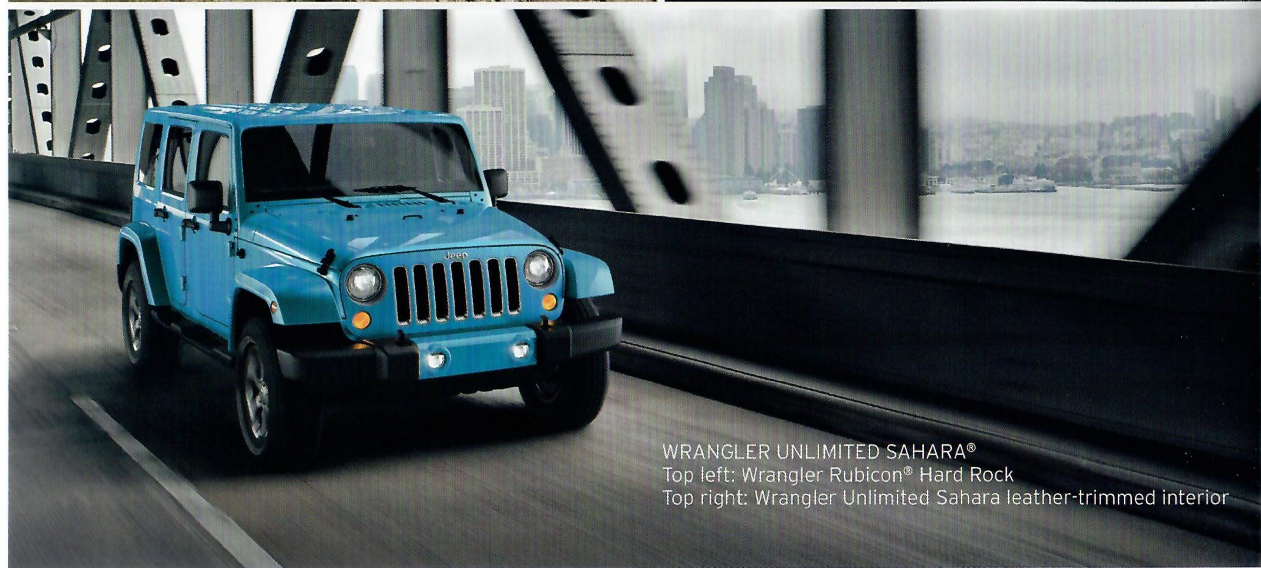
WRANGLER UNLIMITED SAHARA® Top left: Wrangler Rubicon® Hard Rock Top right: Wrangler Unlimited Sahara leather-trimmed interior