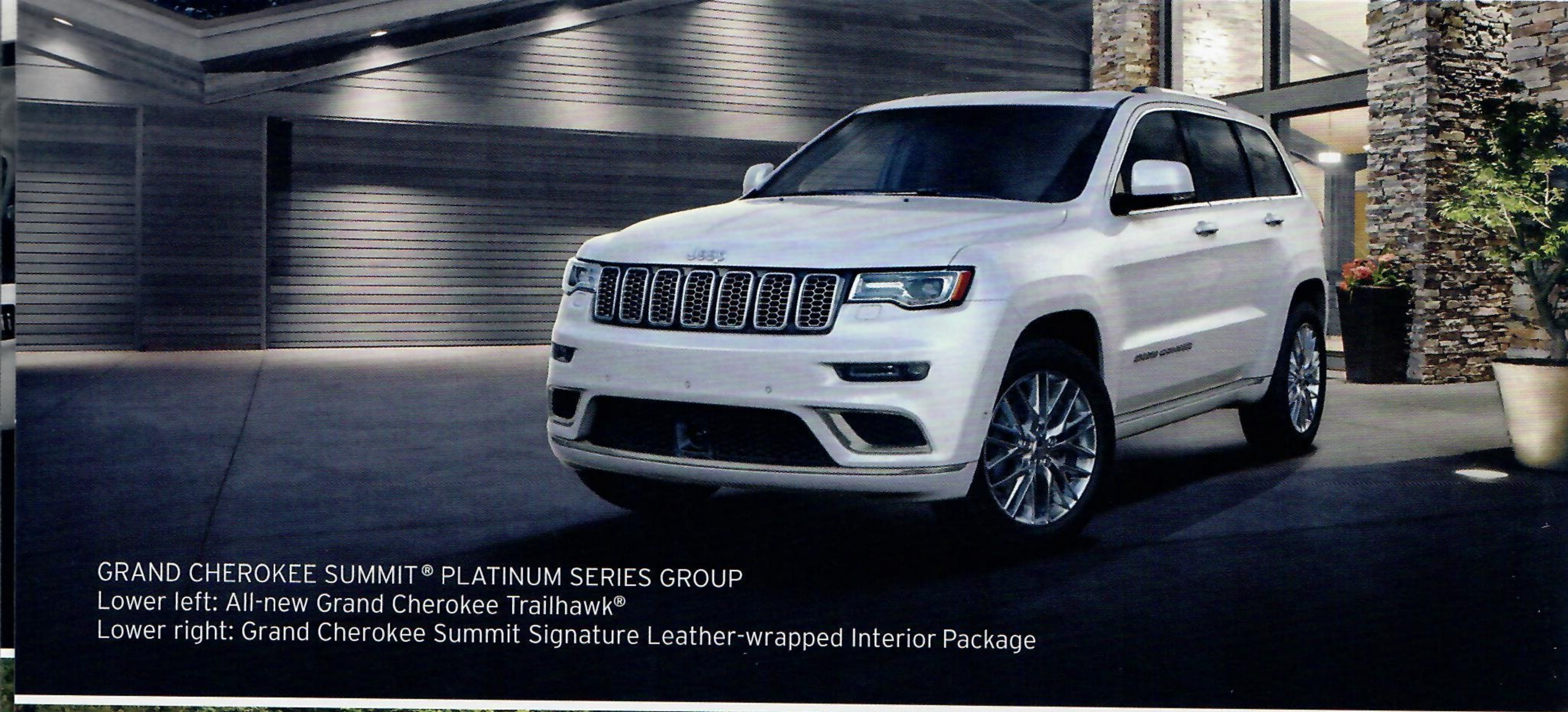
GRAND CHEROKEE SUMMIT® PLATINUM SERIES GROUP Lower left: All-new Grand Cherokee Trailhawk® Lower right: Grand Cherokee Summit Signature Leather-wrapped Interior Package