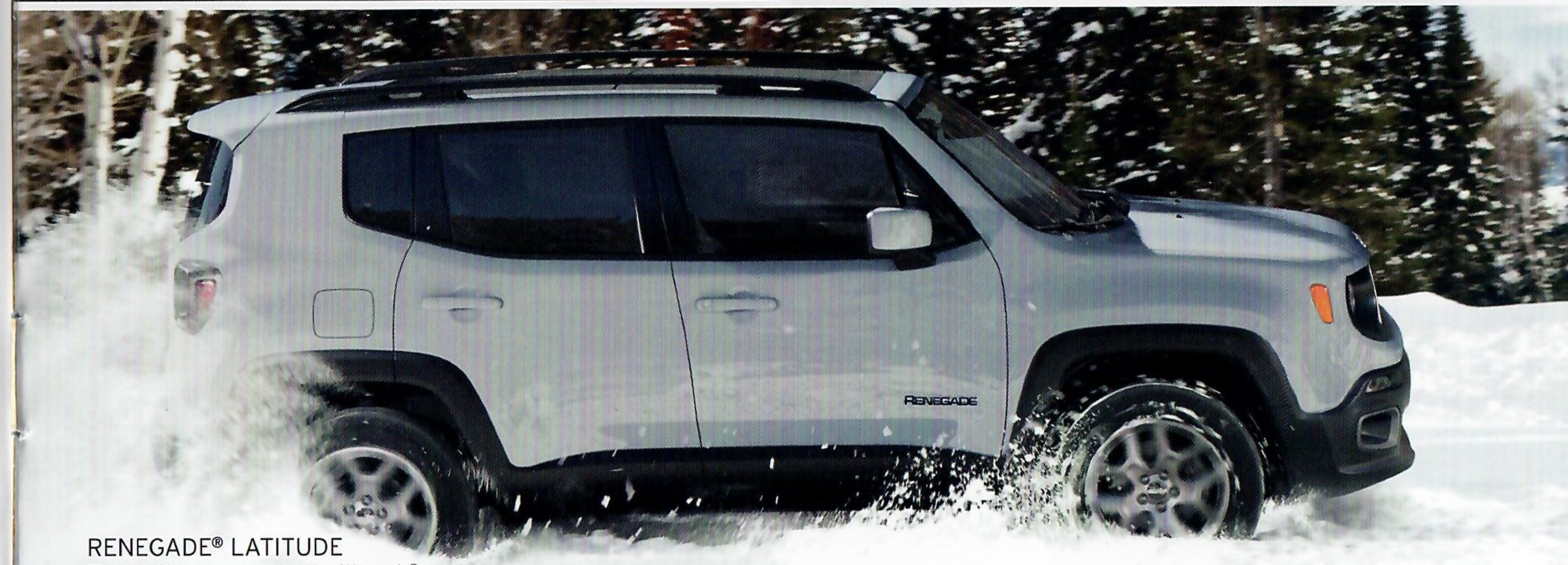
RENEGADE® LATITUDE Top left: Renegade Trailhawk® Top right: Renegade Limited leather-trimmed interior