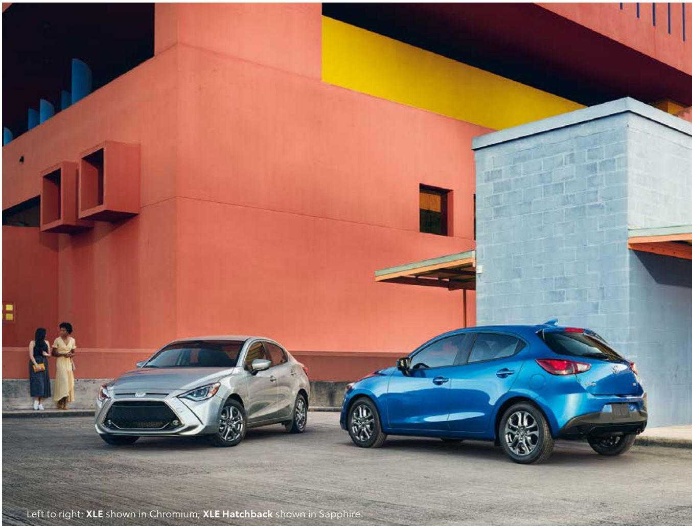
Left to right: XLE shown in Chromium; XLE Hatchback shown in Sapphire.