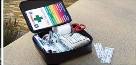
First aid kit