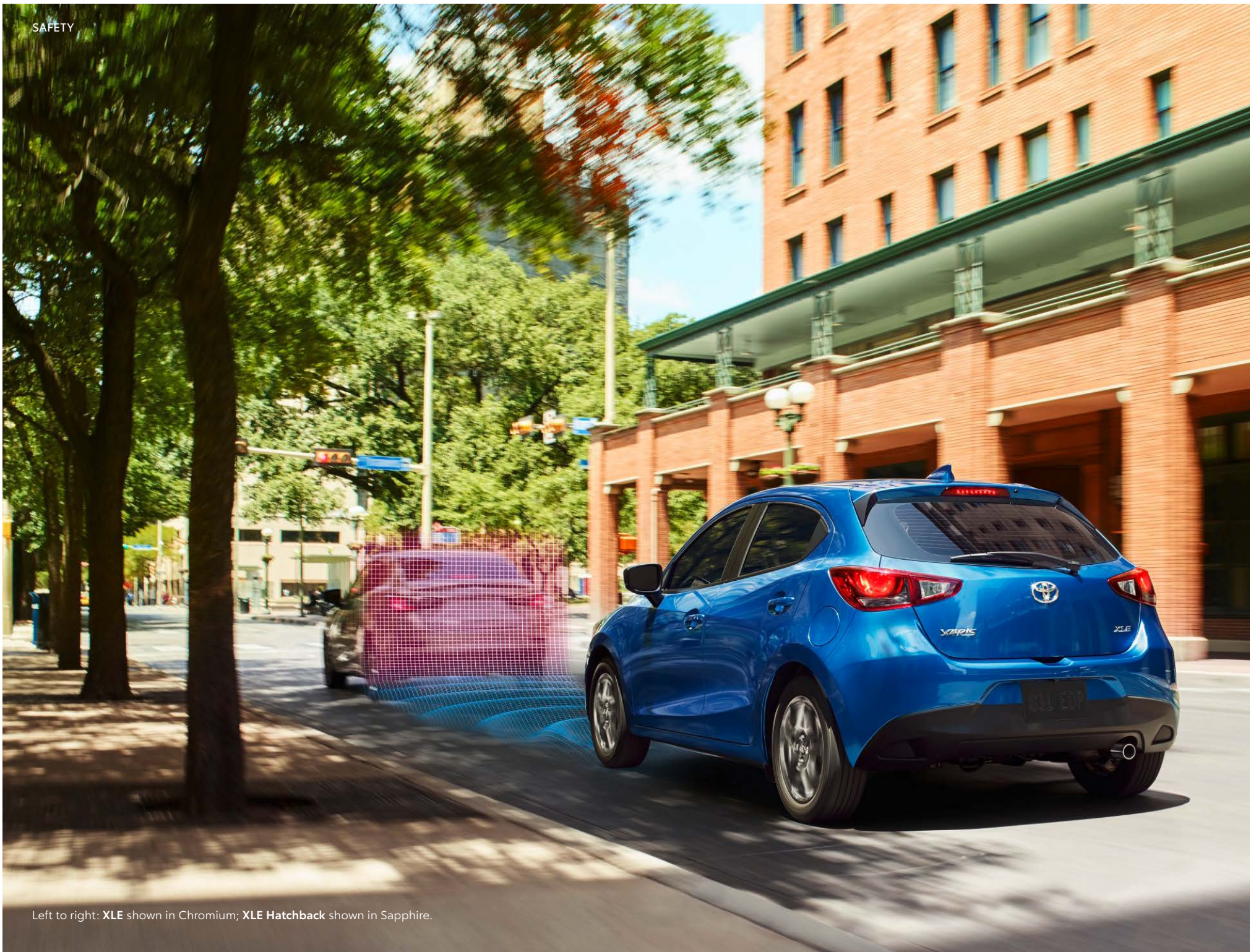
Left to right: XLE shown in Chromium; XLE Hatchback shown in Sapphire.