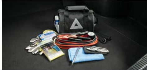
Emergency assistance kit