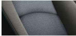
LE fabric shown in Blue Black