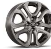
LE and XLE 16-in. Dark Gray split-spoke alloy wheel