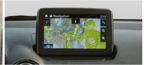
Navigation system upgrade 14

See numbered footnotes in Disclosures section.