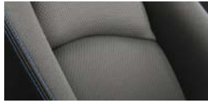
XLE leatherette trim shown in Black