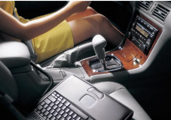
Above: Extra 12-volt outlet came in handy when the laptop's battery ran down en route.