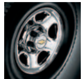
CHROME-STYLED 16" x 6.5" with chrome centre cap. Available on 1500 Express passenger models.