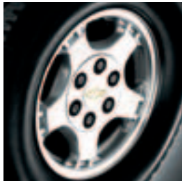
ALUMINUM 16" x 7" aluminum wheel with centre cap. Available on 1500 Express passenger models.