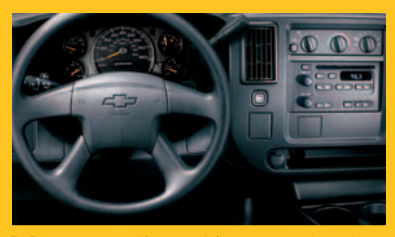
The Express instrument panel features a multi-function computer with comprehensive diagnostic capabilities and warning systems.