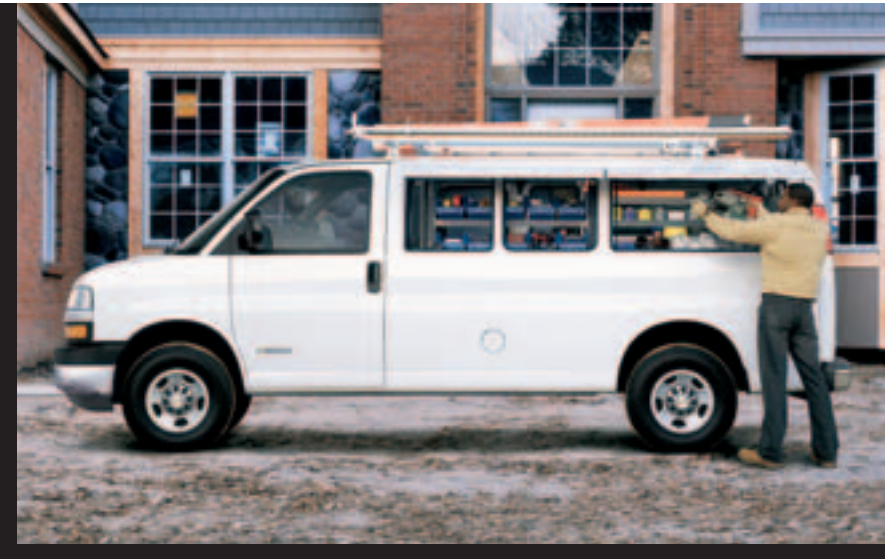
Express 2500 Regular Wheelbase Cargo Van showing the available Express Access Package.

Express Cargo Vans have always earned their keep with rock-solid hauling capabilities and Chevy dependability. Now, for 2006, Cargo Vans add to that already powerful combination, with an expanded engine lineup that is headlined by the newly available Duramax 6600 Diesel V8 that generates a whopping 460 lb.-ft. of torque and is mated with a heavy-duty four-speed automatic transmission. The lineup also includes four Vortec gasoline-powered engines, with three V8s to choose from: the 275 hp Vortec 4800, the 285 hp Vortec 5300, and the 300 hp Vortec 6000, in addition to the economical 195 hp Vortec 4300 V6. Even more reasons to go with the power among full-size Cargo Vans: Chevy Express. For more information on Chevy Express Cargo Vans, please ask your Sales Consultant for the Chevy Commercial Trucks Brochure.