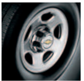
STYLED STEEL 16" x 6.5" painted gray with gray centre cap. Chrome centre cap is optional on Cargo and Base passenger models, standard on LS. 2500 and 3500 models feature 8-bolt attachment.