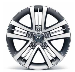
16-INCH ALLOY WHEEL