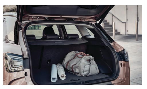
Hands-free smart liftgate with height adjustment