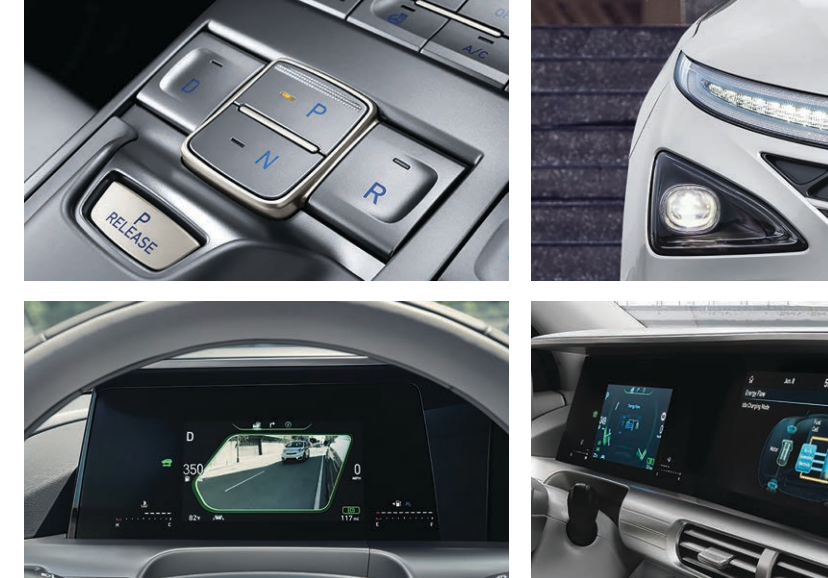
Shift-by-Wire push-button gear selector Blind-Spot View Monitor