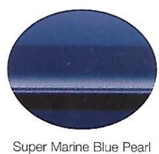
Super Marine Blue Pearl