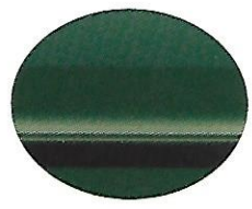
Clover Green Pearl