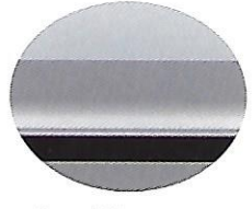
Crystal Silver Metallic