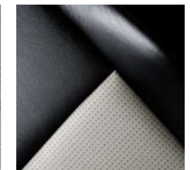
Leather/textile sport, Black (Vector, Aero only)