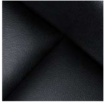
Premium natural leather sport, Black (Optional)