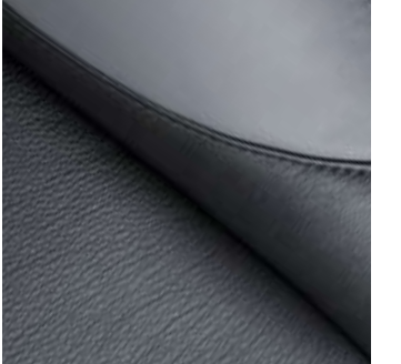
Premium natural leather sport, . Black/Shark (Optional)