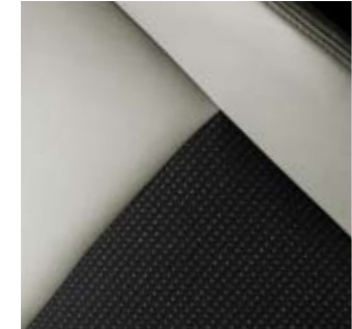
Leather/textile sport, Parchment (Vector, Aero only)