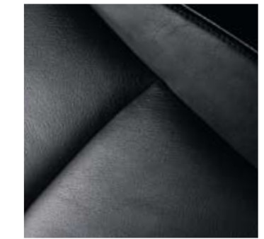
Appointed leather, Black (Optional Linear)