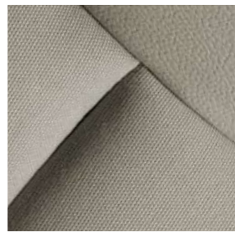
Leatherette/textile, Parchment (Linear only)