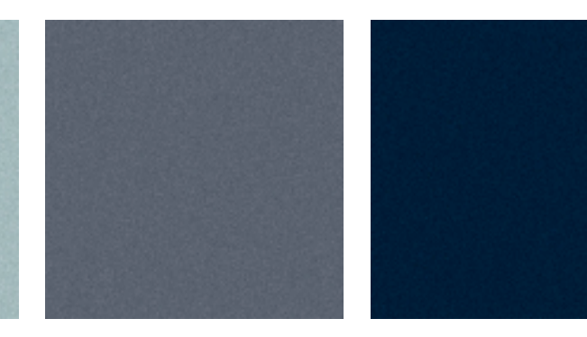
Titan Grey metallic<sup>*</sup>