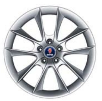
10-spoke 18×7½" (ALU 65)