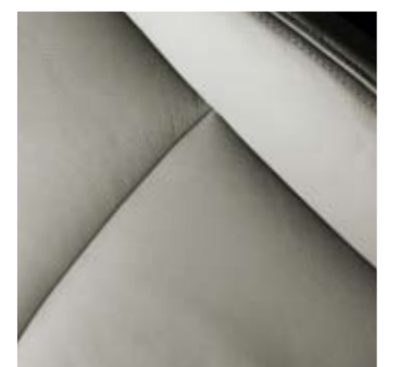
Appointed leather, Parchment (Optional Linear)