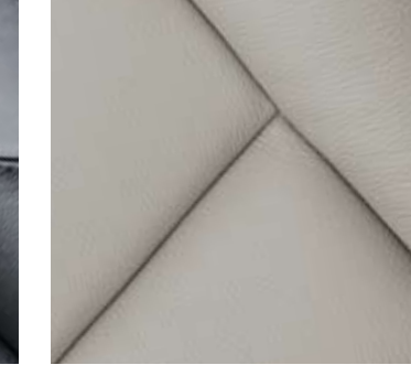
Premium natural leather sport, . Parchment (Optional)

The body-hugging sports seats available for the Saab 9-3 feature pronounced side and thigh support - making for exceptional comfort while keeping you