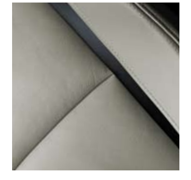
Leather sport, Parchment (Optional Vector, Aero)