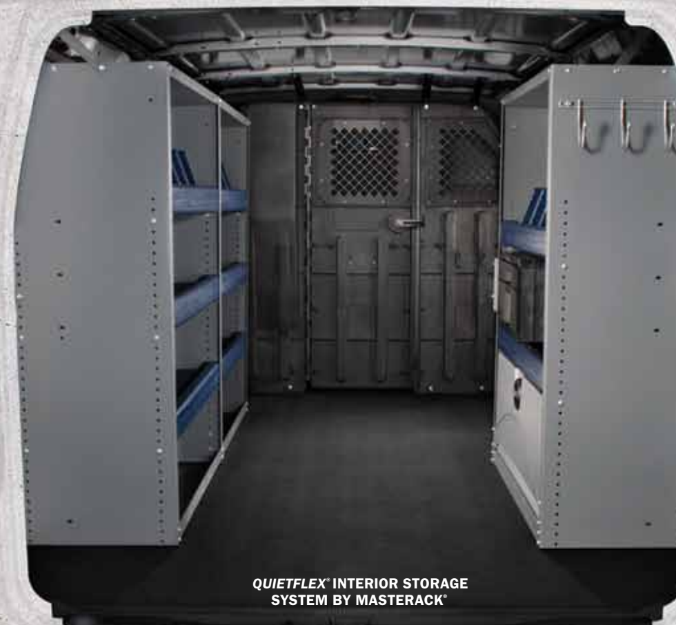
QUIETFLEX® INTERIOR STORAGE SYSTEM BY MASTERACK®