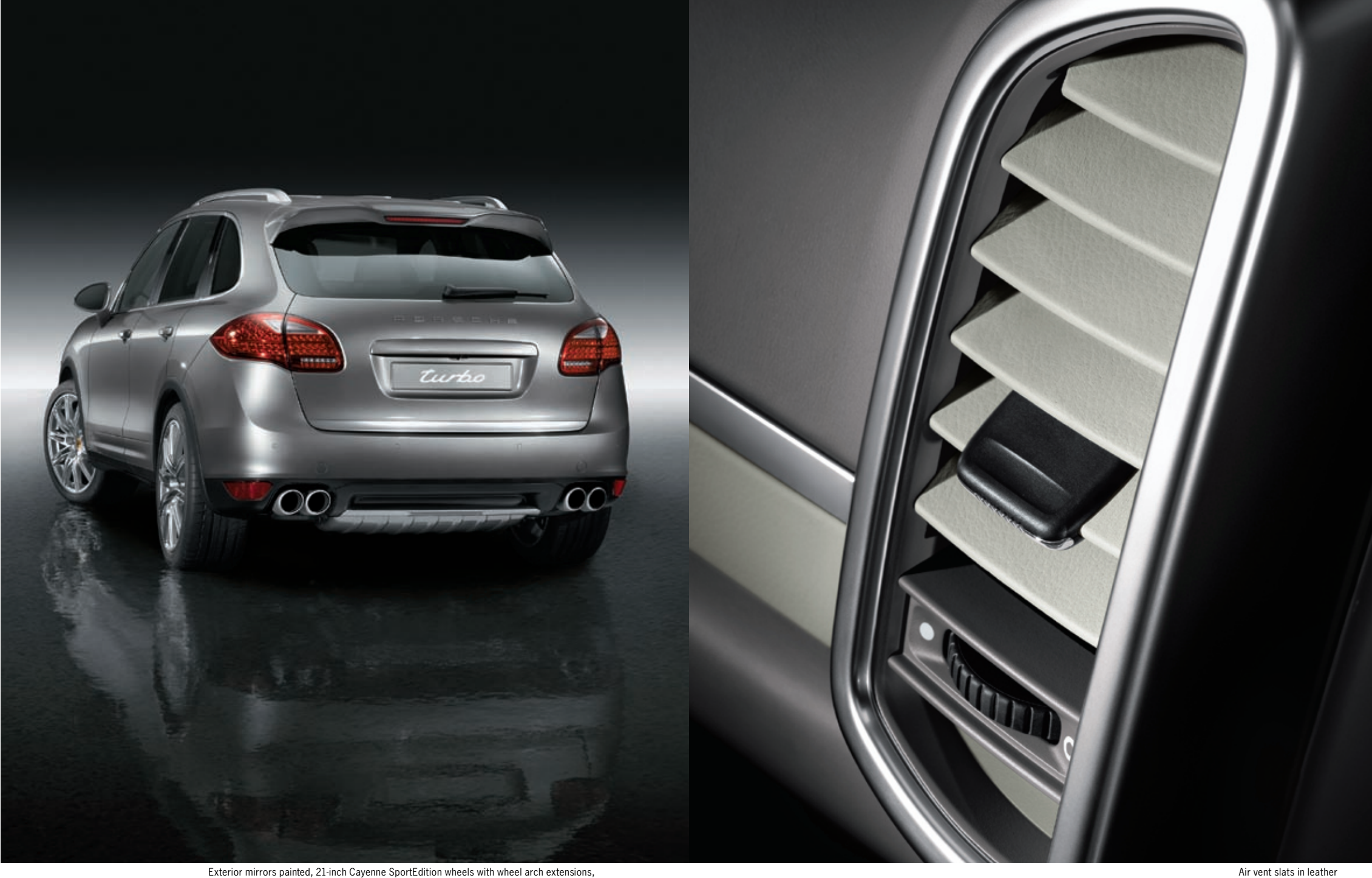
Exterior mirrors painted, 21-inch Cayenne SportEdition wheels with wheel arch extensions, roof spoiler separation edge painted, Porsche logo painted