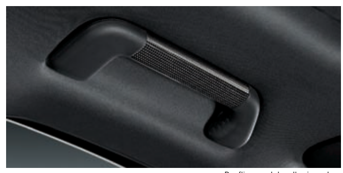
Roofliner grab handles in carbon