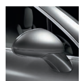
Exterior mirrors painted

Find out more about the equipment details of the Cayenne Turbo in Meteor Grey Metallic in the current Cayenne price list.