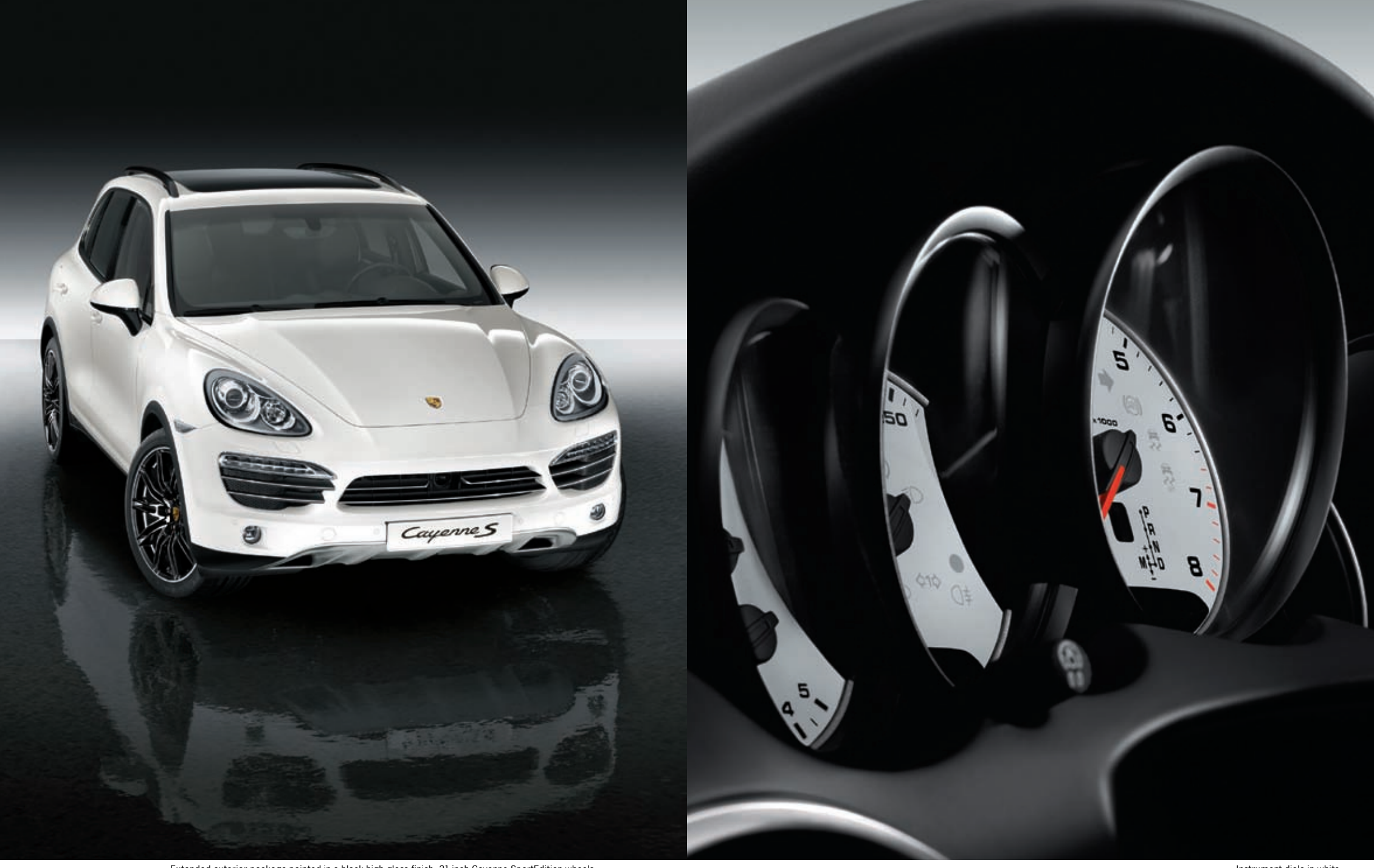
Extended exterior package painted in a black high-gloss finish, 21-inch Cayenne SportEdition wheels painted in a black high-gloss finish with wheel arch extensions