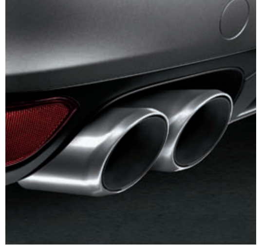
Sports exhaust system