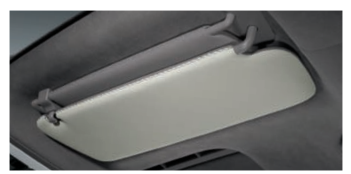
Sun visors in leather