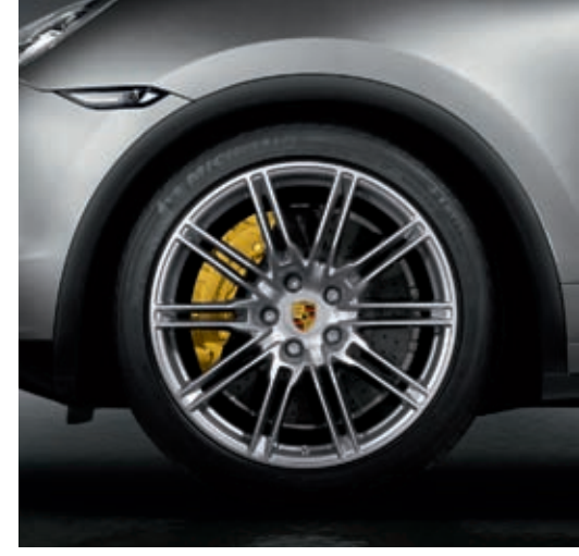
21-inch Cayenne SportEdition wheel with wheel arch extensions