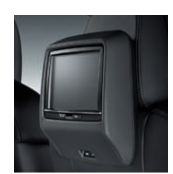
Porsche Rear Seat Entertainment

Find out more about the equipment details of the Cayenne S in Sand White in the current Cayenne price list.