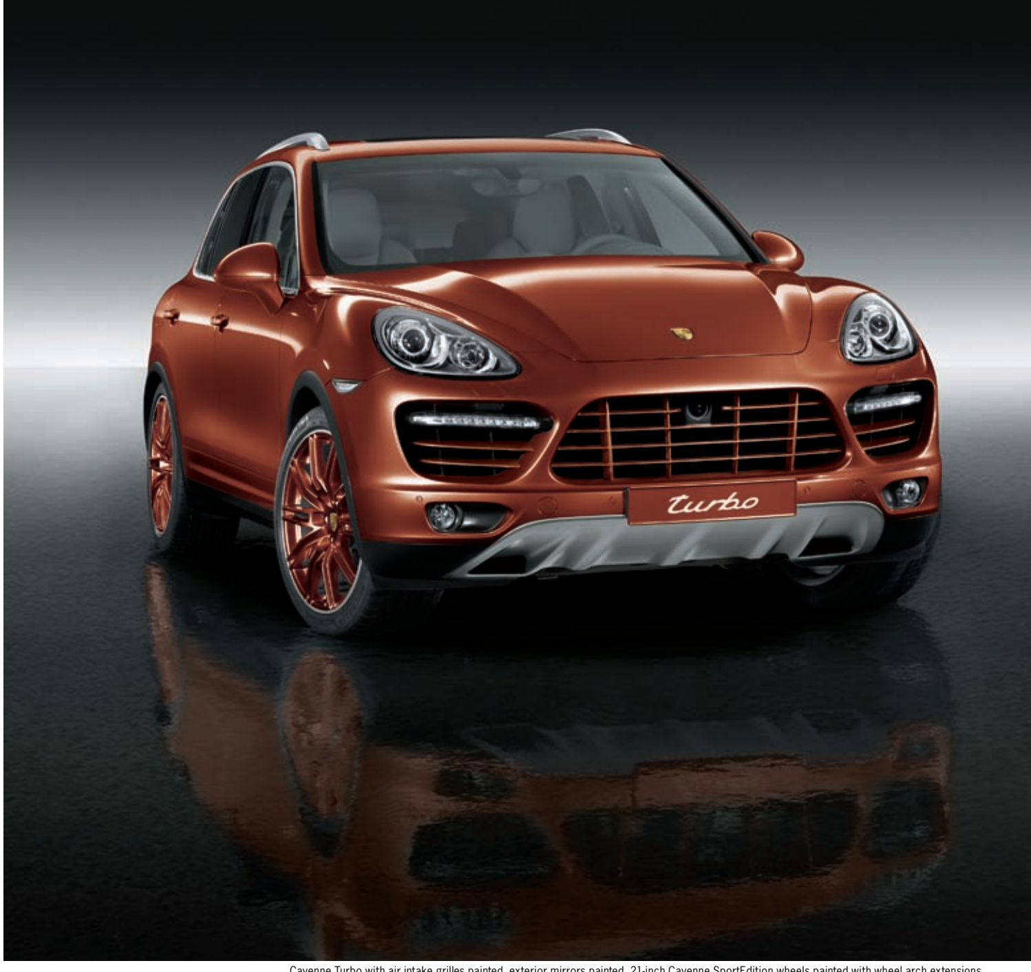
Cayenne Turbo with air intake grilles painted, exterior mirrors painted, 21-inch Cayenne SportEdition wheels painted with wheel arch extensions

Find out more about how to design your own special Porsche on page 28.