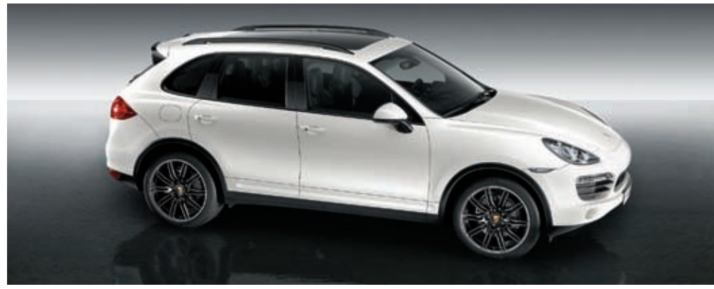
Extended exterior package painted in a black high-gloss finish, 21-inch Cayenne SportEdition wheels painted in a black high-gloss finish with wheel arch extensions