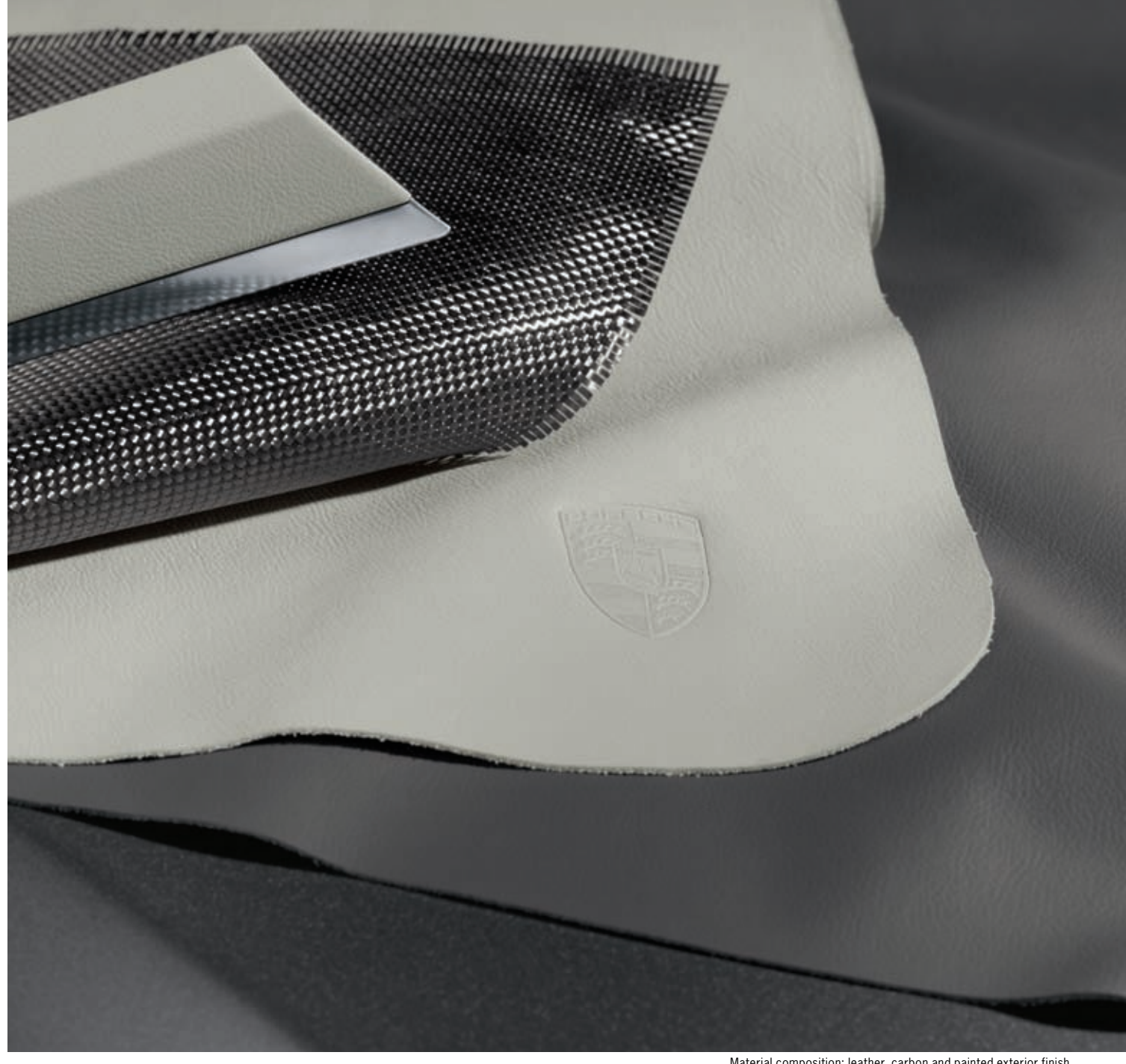
Material composition: leather, carbon and painted exterior finish

Personalised refinements to the interior and exterior are not the only options we offer. If you would like to make your Cayenne a little sportier, for example with the sports exhaust system, you can rest assured that your Porsche is in good hands.