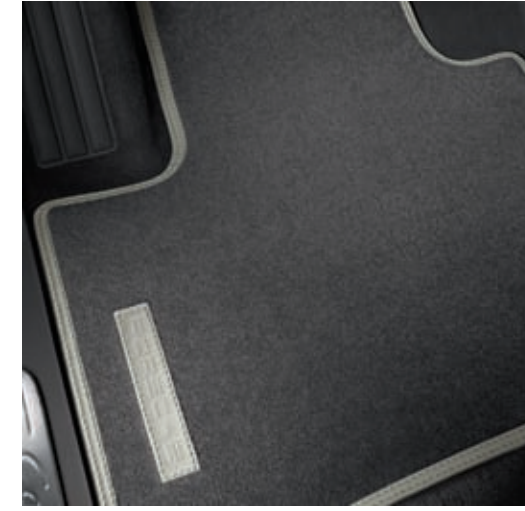
Personalised floor mats with leather edging