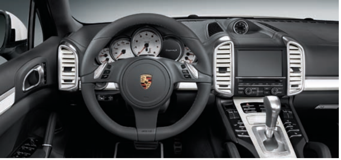
Interior package painted, air vent slats painted, instrument dials in white