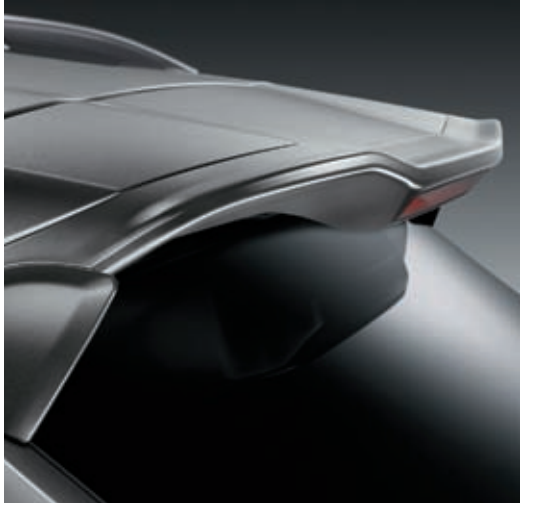
Roof spoiler separation edge painted