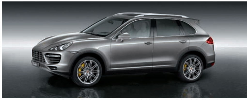
Air intake grilles painted, exterior mirrors painted, 21-inch Cayenne SportEdition wheels with wheel arch extensions, roof spoiler separation edge painted