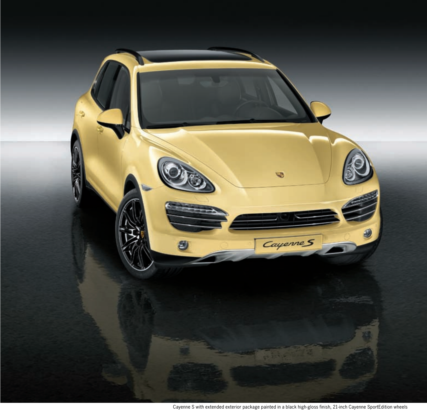
Cayenne S with extended exterior package painted in a black high-gloss finish, 21-inch Cayenne SportEdition wheels painted in a black high-gloss finish with wheel arch extensions